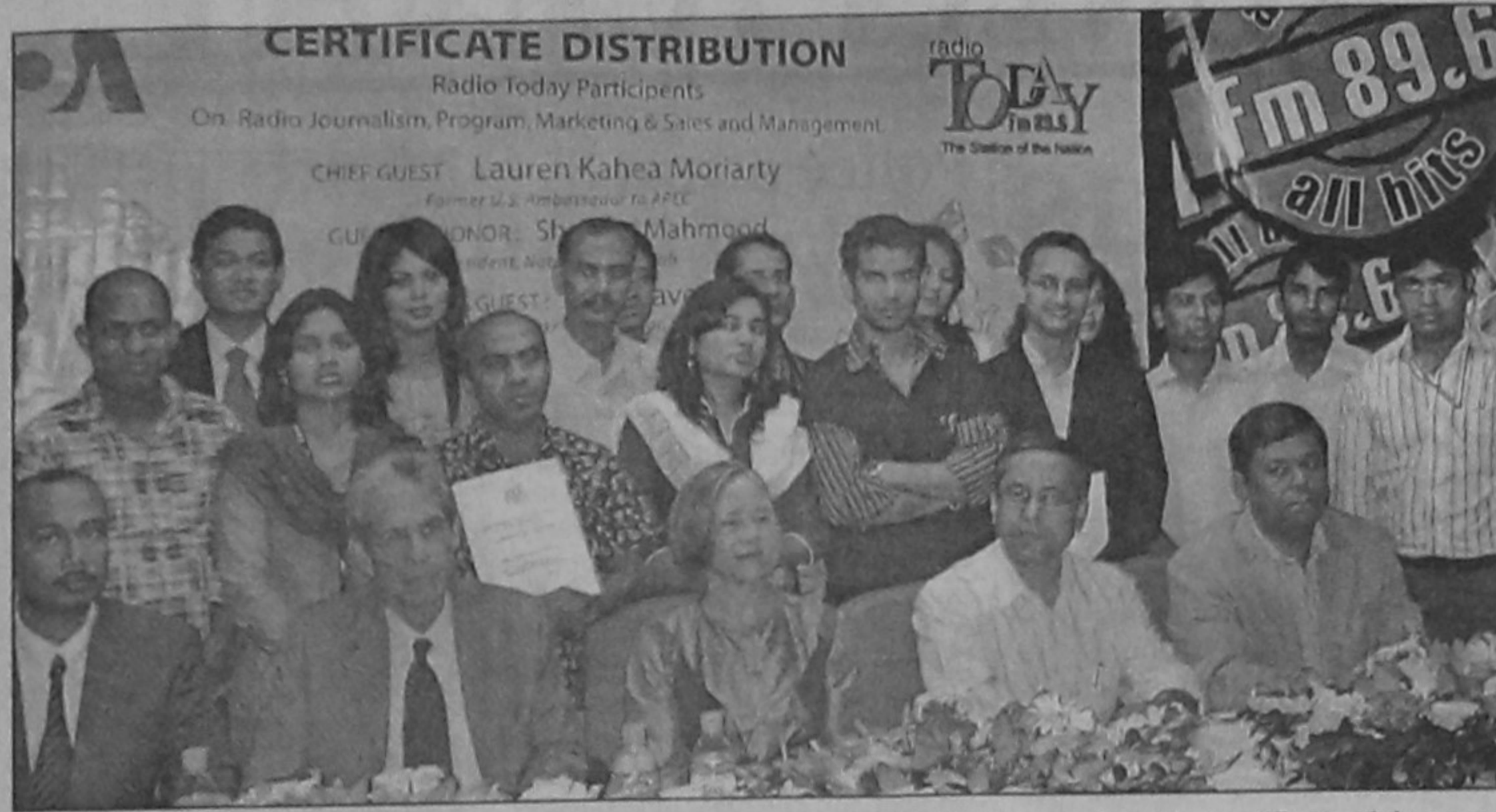
Participants of a workshop for radio journalists pose for photograph with the guests at the certificate giving ceremony at the National Press Club in the city yesterday.