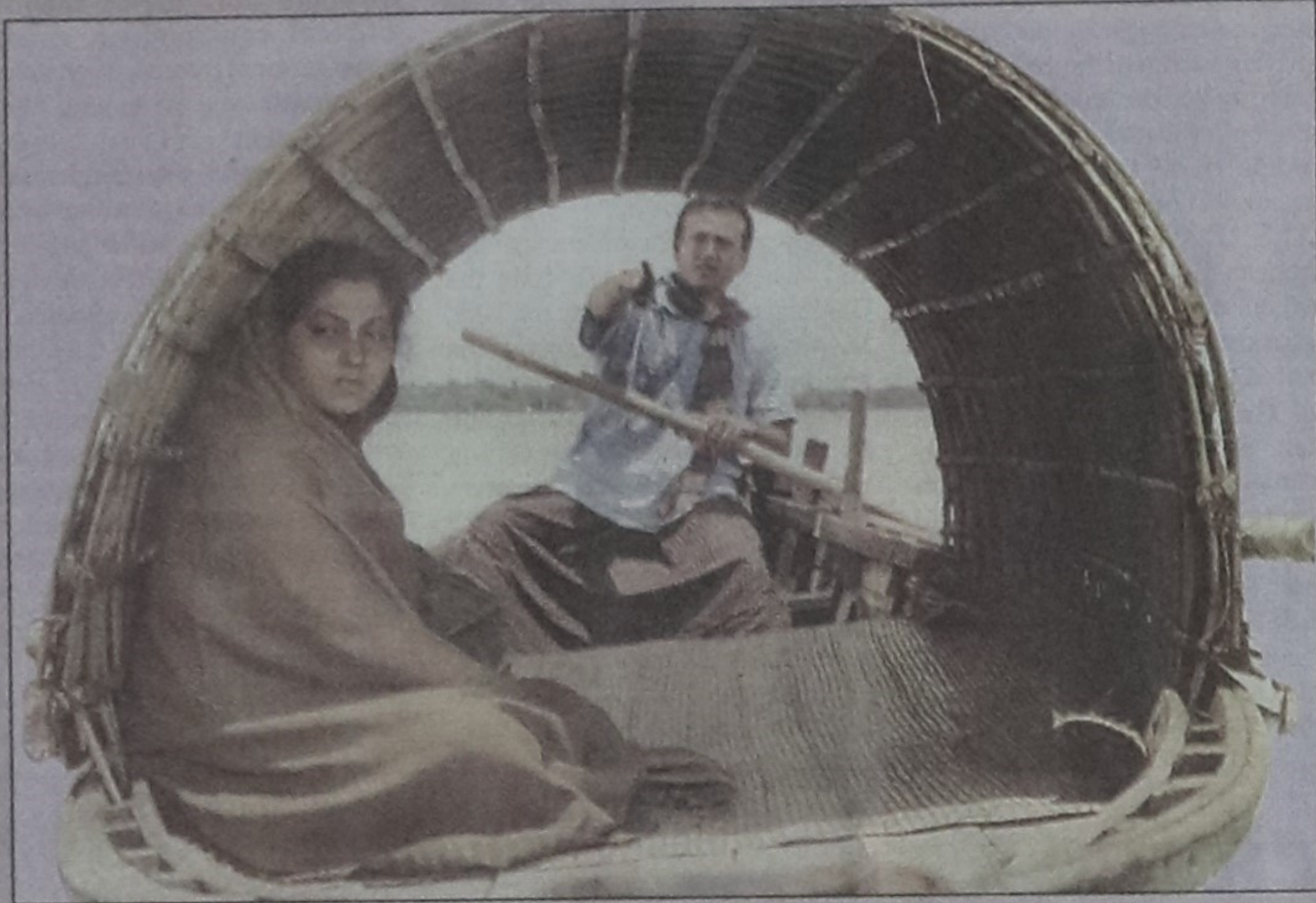
Scenes from "Hajar Bochhor Dhorey" (top) and "Ghani", two of the National Award winning films.

Eighty-nine awards in 27 categories including best film,