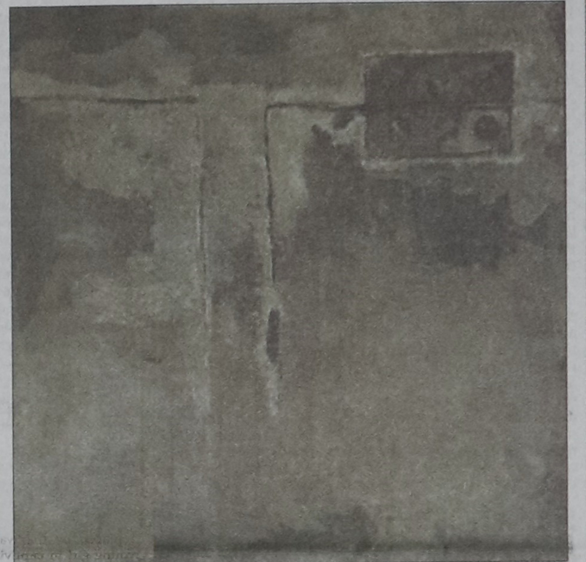
The award winning artwork.

Atiq's award-winning work is very simple and portrays the texture of a distorted building wall; the colours used in the painting give the impression of desert sand. The canvas