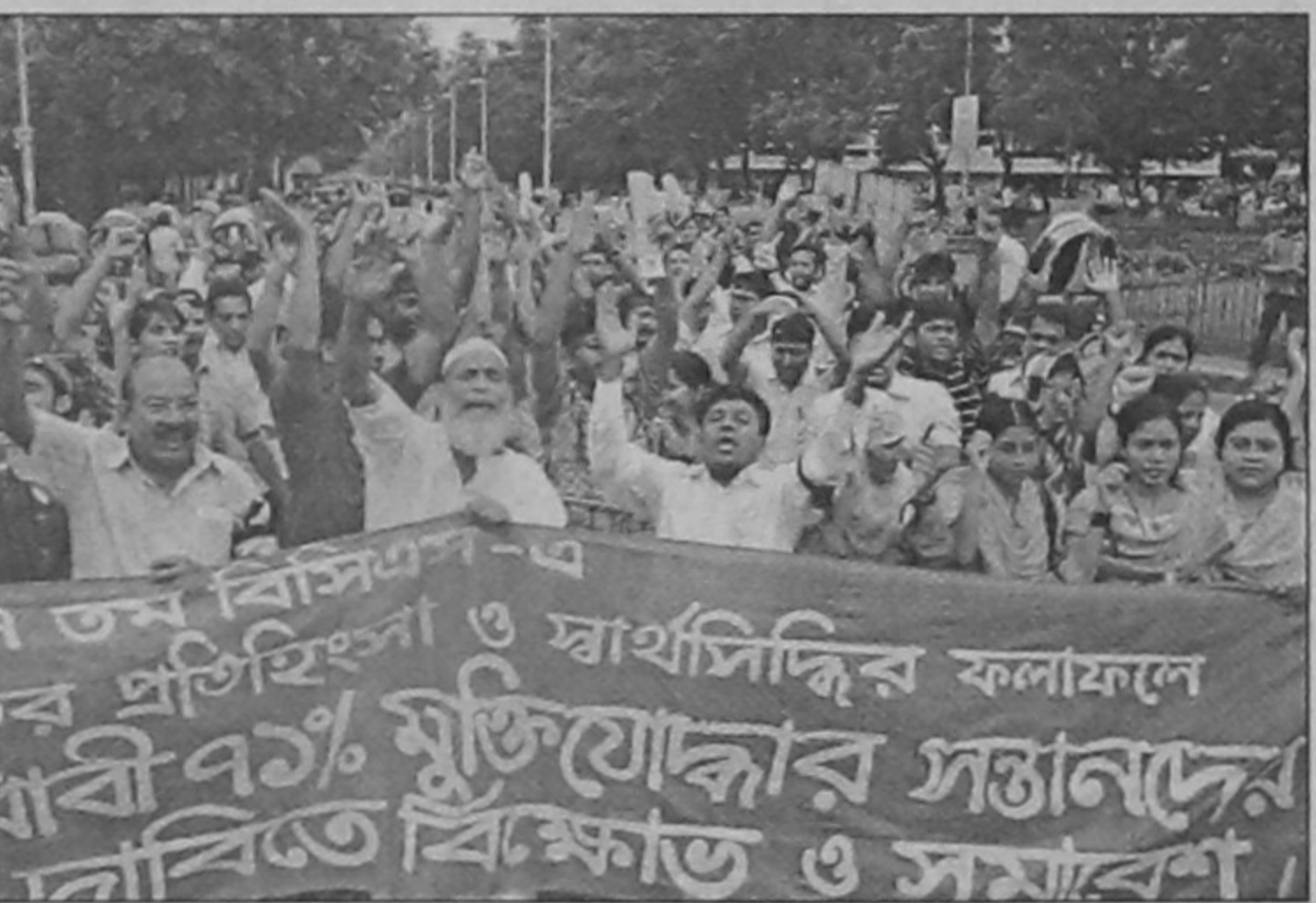
Meritorious candidates and children of freedom fighters who were dropped from the list of successful candidates selected according to the fresh results of the 27th BCS examinations demonstrate on the Dhaka University campus yesterday demanding their appointment.

He was the founder of Khila College, former vice-principal of Bangabasi College and ex-secretary general of Bangladesh-UK Friendship Society. Religious programmes will be held at his village home at Barabari in Paharpur, Madan.