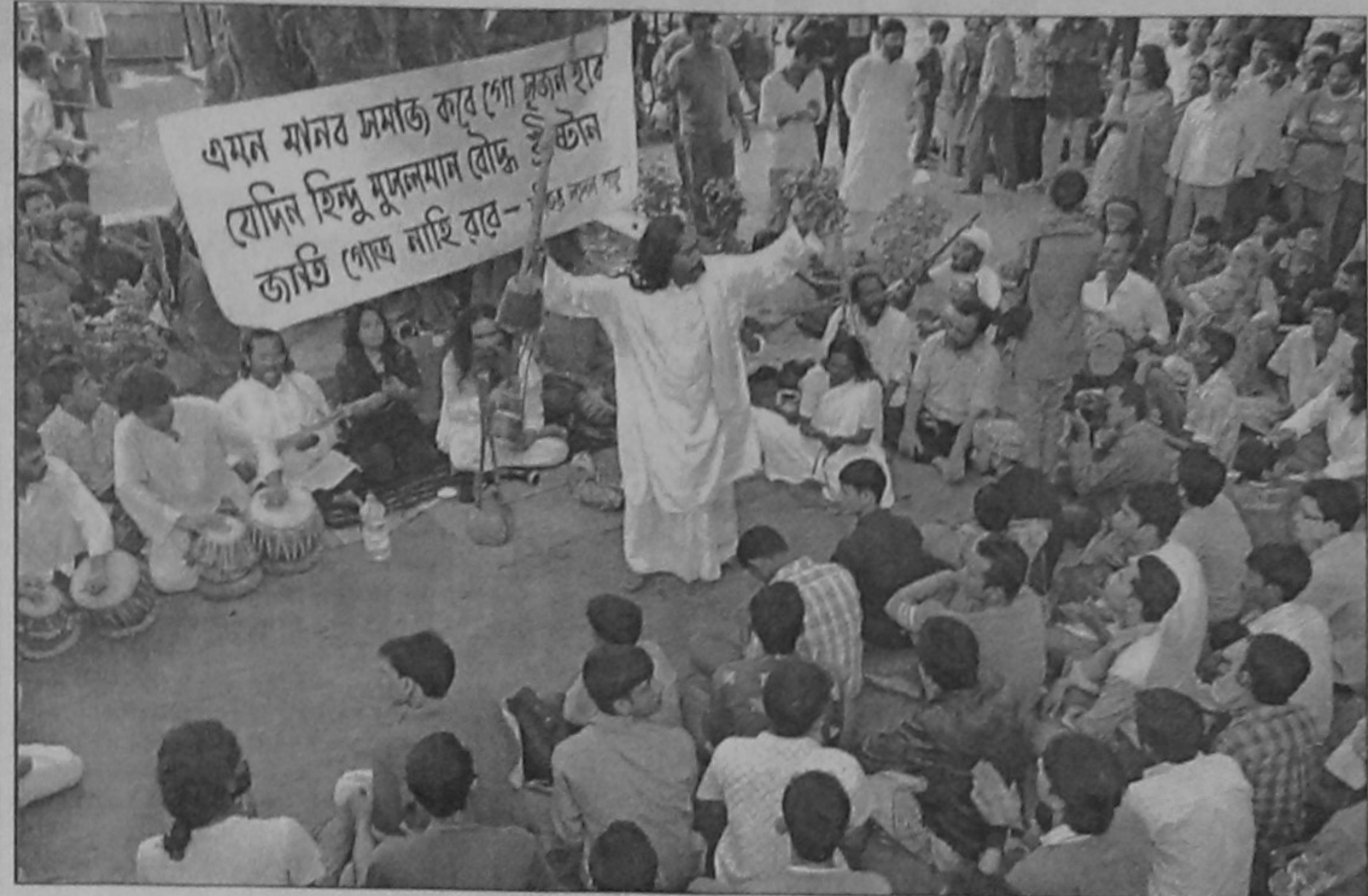
A Baul sings during a demonstration organised by the students of Institute of Fine Art at Suhrawardy Udyan in the city yesterday. They protested the removal of Baul sculptures from the roundabout in front of Zia International Airport.