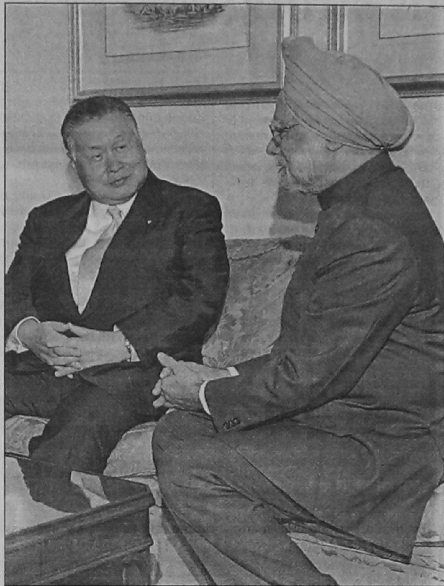
Visiting Indian Prime Minister Manmohan Singh (R) talks with former Japanese prime minister Yoshiro Mori (L) at their breakfast meeting in Tokyo yesterday. Manmohan Singh is now here on a three-day visit.

"We look to the wise counsel and leadership of Japan" to meet the challenges facing the globe, he said.