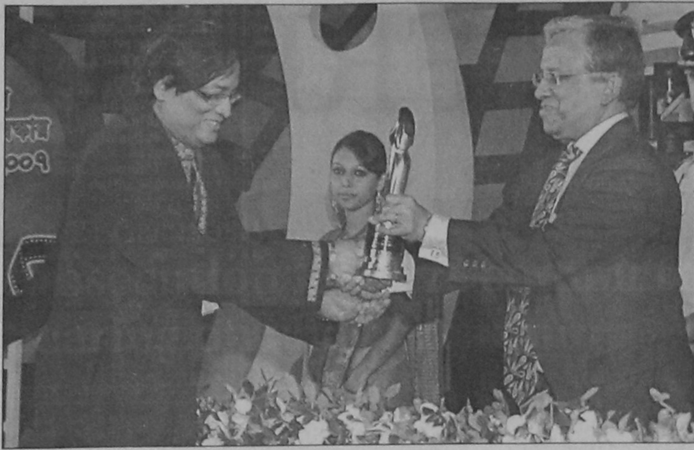
Chief Adviser Fakhruddin Ahmed gives away a prize to a film artist at the National Film Award giving ceremony at Bangladesh-China Friendship Conference Centre in the city yesterday.