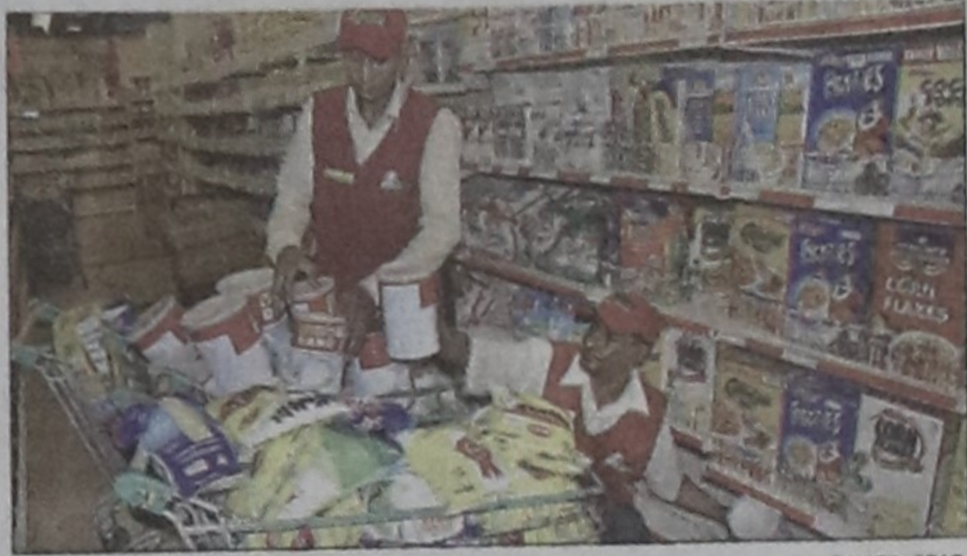
Employees of Agora department store remove eight brands of powdered milk from their shelves yesterday following a High Court order.

Besides, it wanted to know why they should not be directed to take precautions enough to safeguard