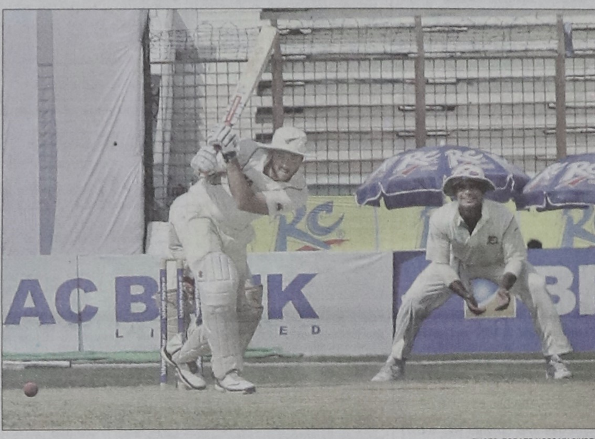
CAPTAIN COURAGEOUS: New Zealand skipper Daniel Vettori works the ball on the inside during his match-winning knock of 76 on the fifth and final day of the first Test against Bangladesh at the Chittagong Divisional Stadium yesterday.