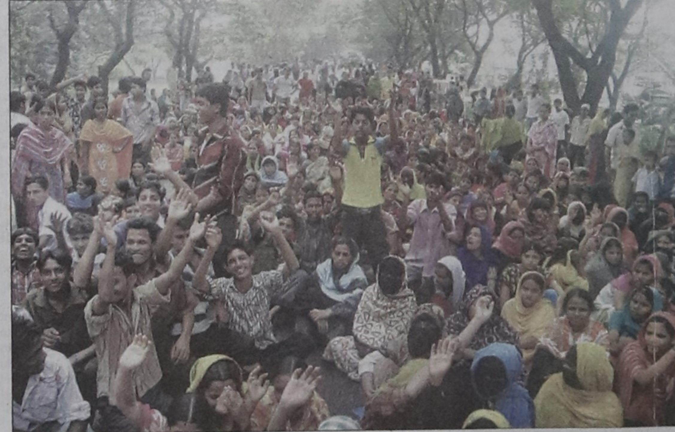
Workers of Ming Knitwear Ltd barricaded the Dhaka-Narayanganj Link Road yesterday, demanding payment of arrears wages.