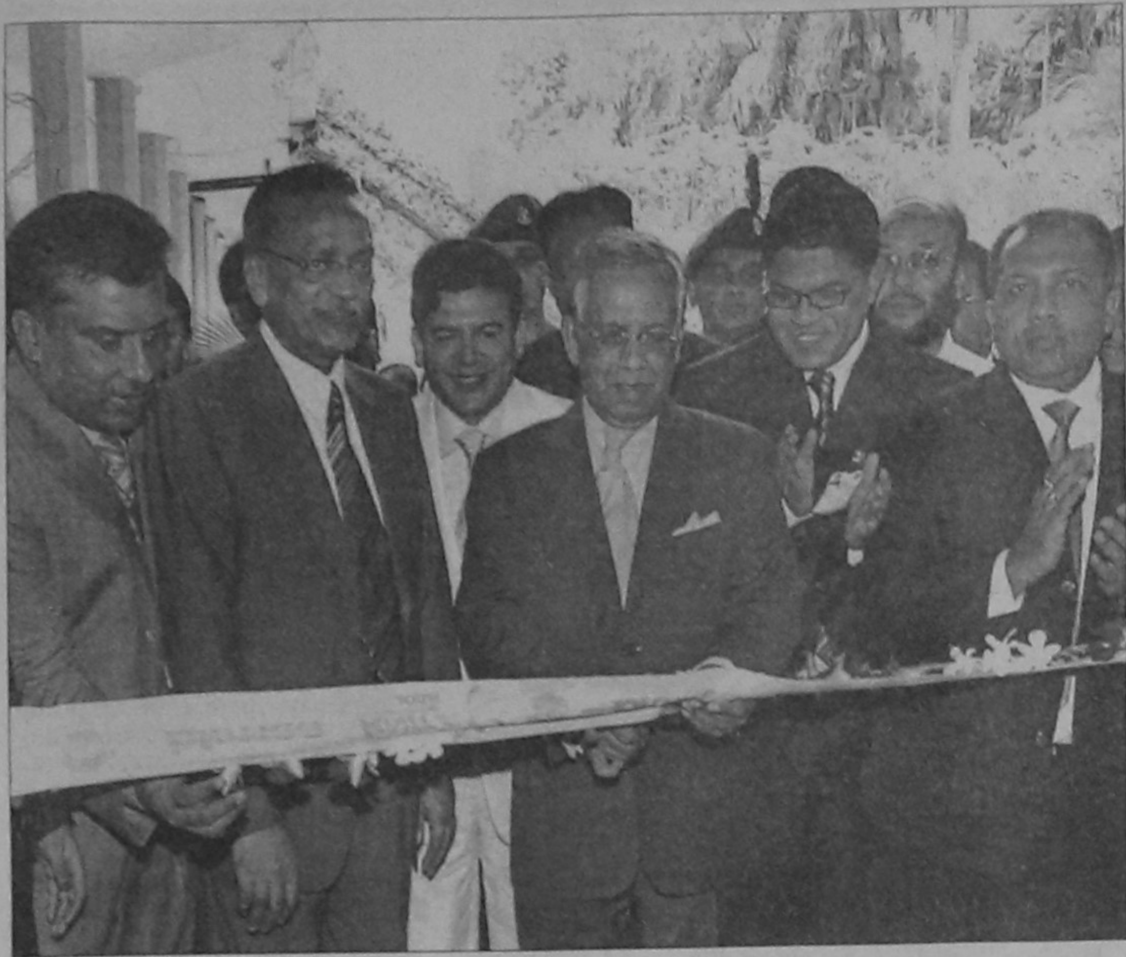
Chief Adviser Fakhruddin Ahmed inaugurates Bangladesh Knitwear Exhibition 2008, organised by Bangladesh Knitwear Manufacturers and Exporters Association, at Dhaka Sheraton Hotel yesterday. (Story on B1)