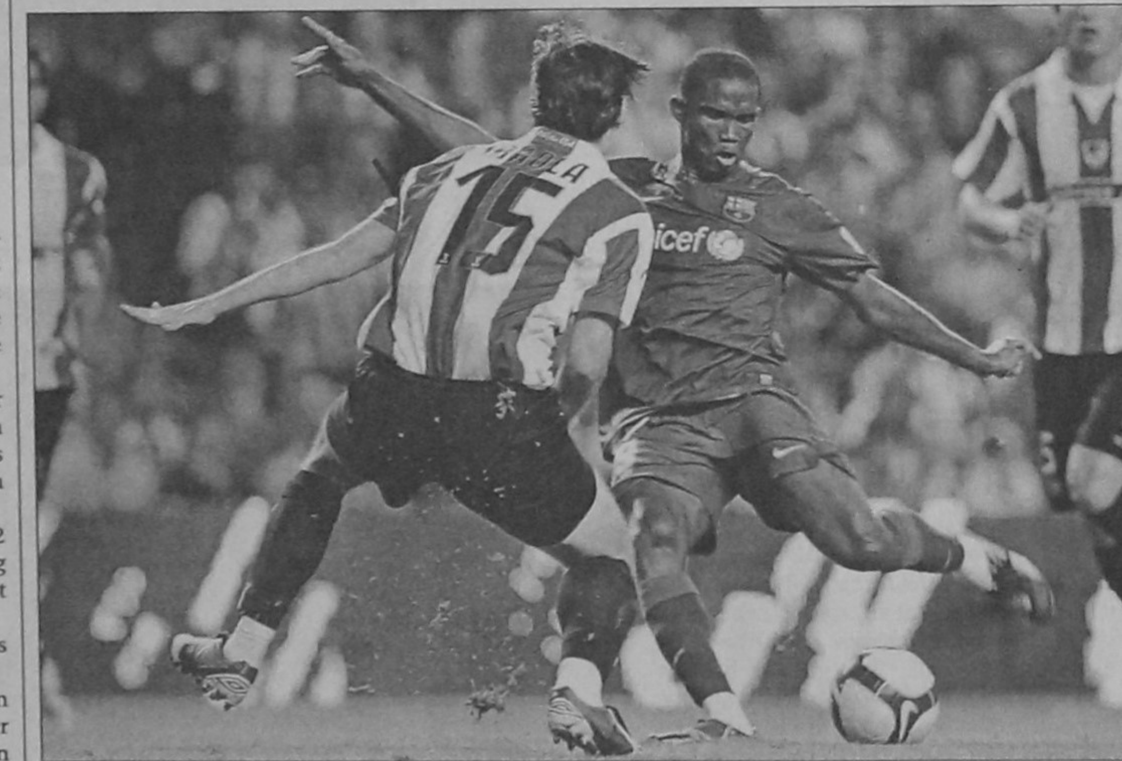
Barcelona striker Samuel Eto'o (R) takes a shot during their Primera Liga match against Athletic Bilbao at the San Mames Stadium in Bilbao on Sunday.