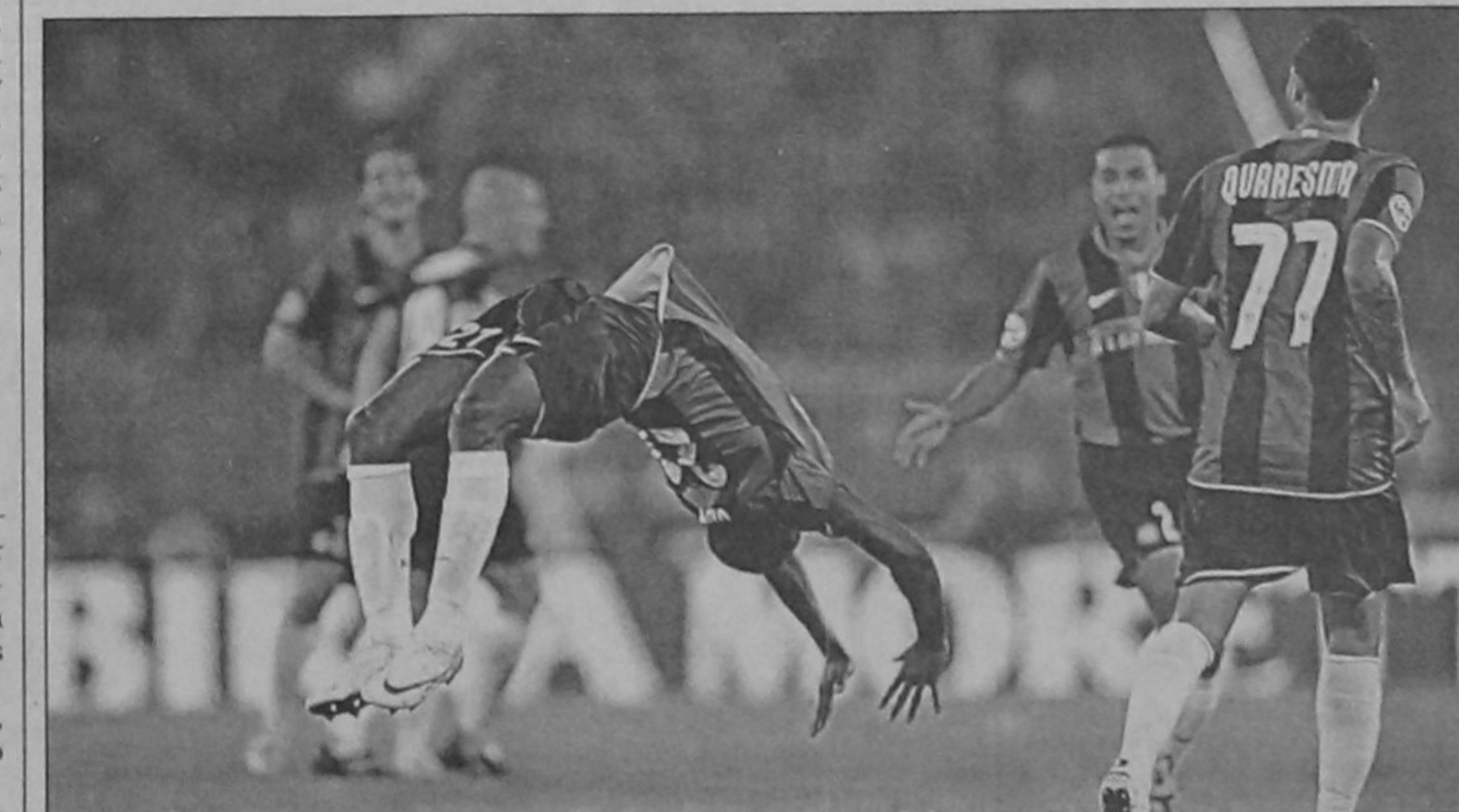
Inter Milan's Victor Obinna (C) does a somersault to celebrate his goal against AS Roma during their Serie A encounter at the Olympic Stadium in Rome on Sunday.

At the bottom Cagliari won for the first time this season as Robert Acquafredda's late goal secured a 1-0 win at Torino.