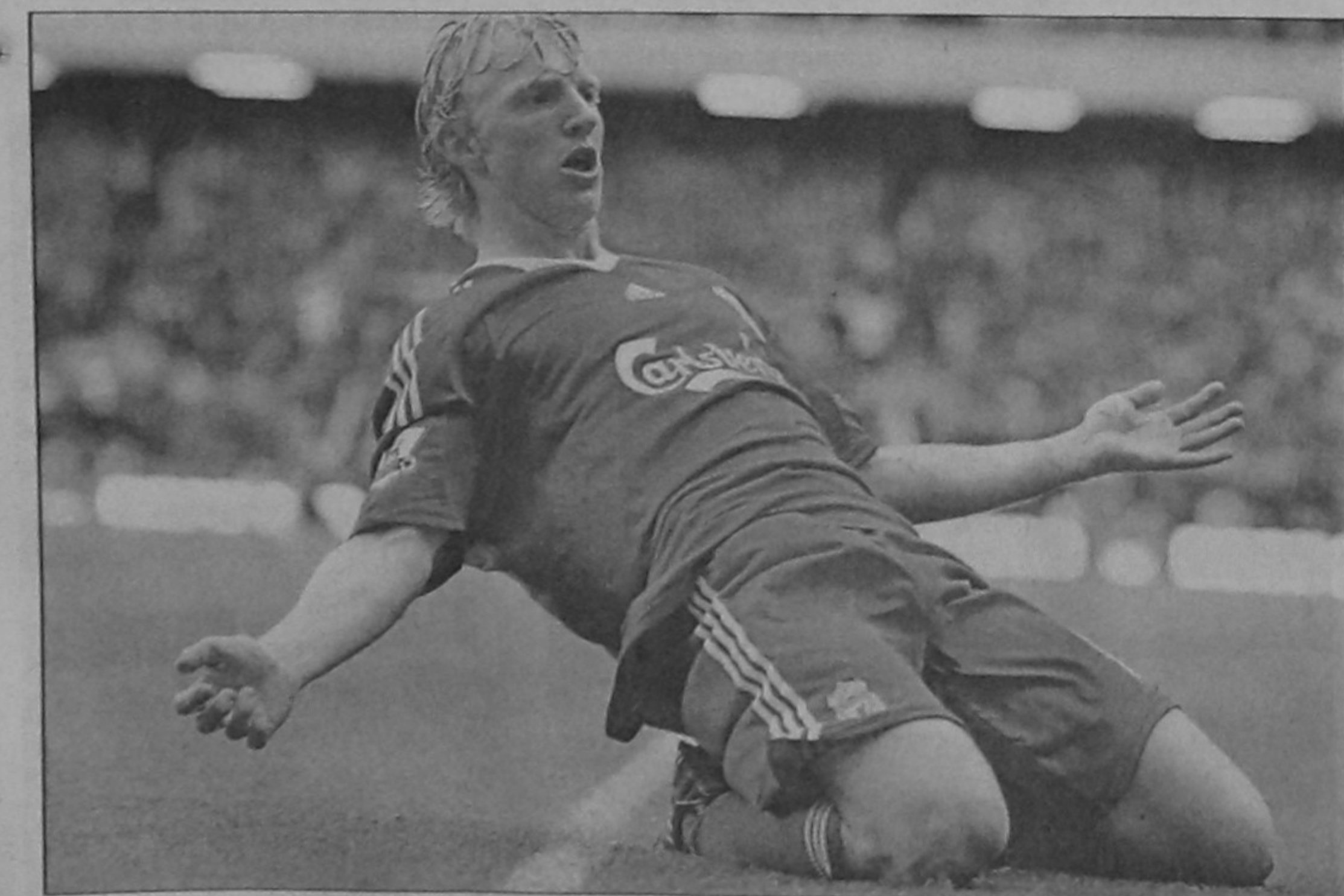
Liverpool forward Dirk Kuyt slides in to celebrate his late winner against Premier League rivals Wigan at Anfield on Saturday.

"I don't know if it's true Madrid want him. It could be, but I am not worried about that. I think we will be okay. I don't have any worries about him going."