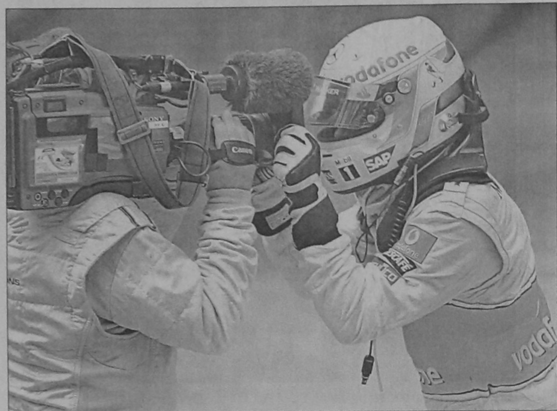
McLaren-Mercedes driver Lewis Hamilton is understandably delighted as he jokes around with a cameraman after victory in the Chinese GP at the Shanghai International Circuit on Sunday.

Hamilton remained unchallenged at the front with a 13-second lead and it was left to the Ferrari team to swap places after 49 laps when Raikkonen slowed enough to let Massa pass him on the back straight.