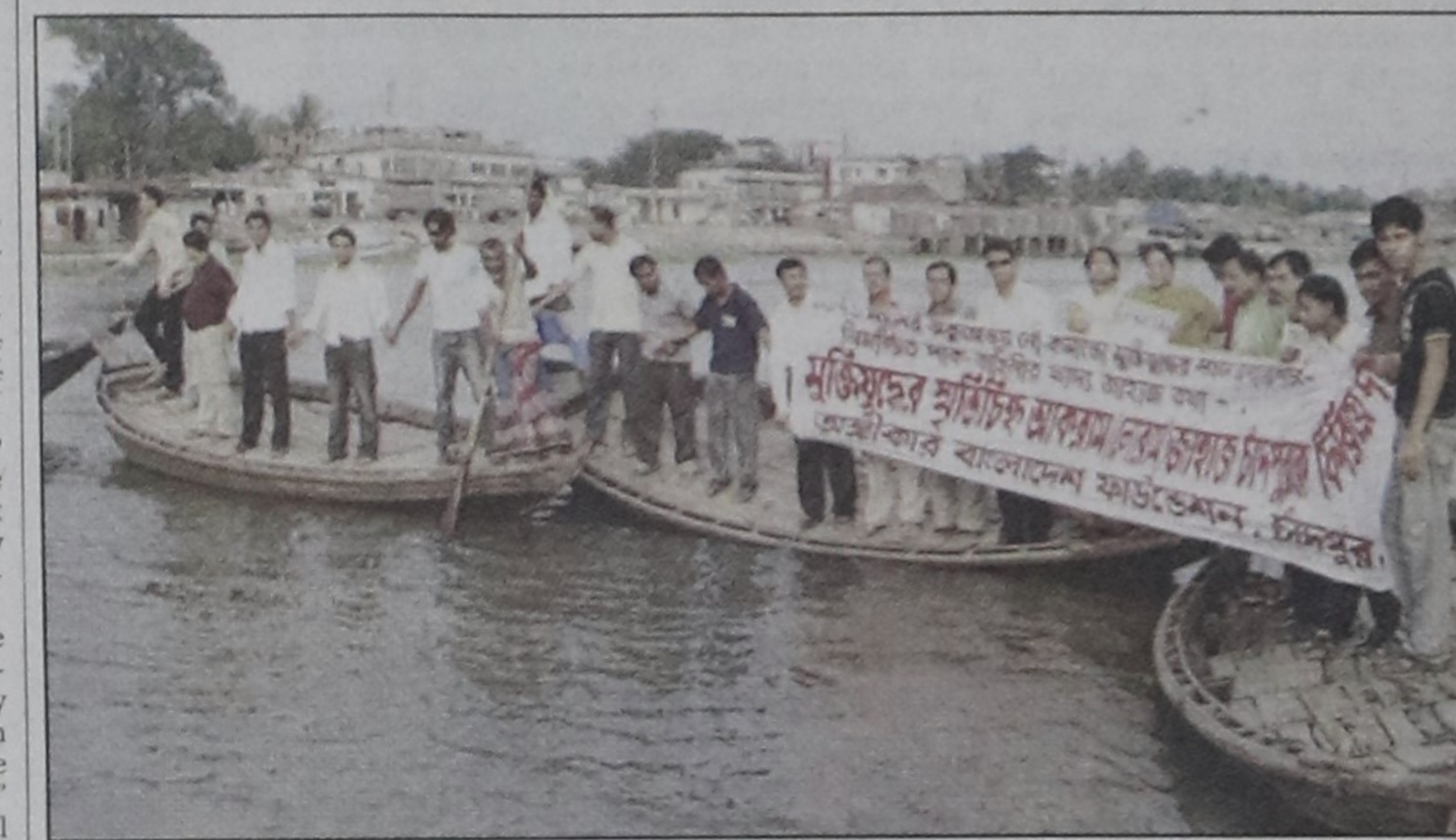
Angiker Bangladesh forms a human chain on boats near Chandpur riverport yesterday demanding preservation of MV Akram, a ship sunk by freedom fighters during the Liberation War.

"We shall serve you with a fresh list later," he added.