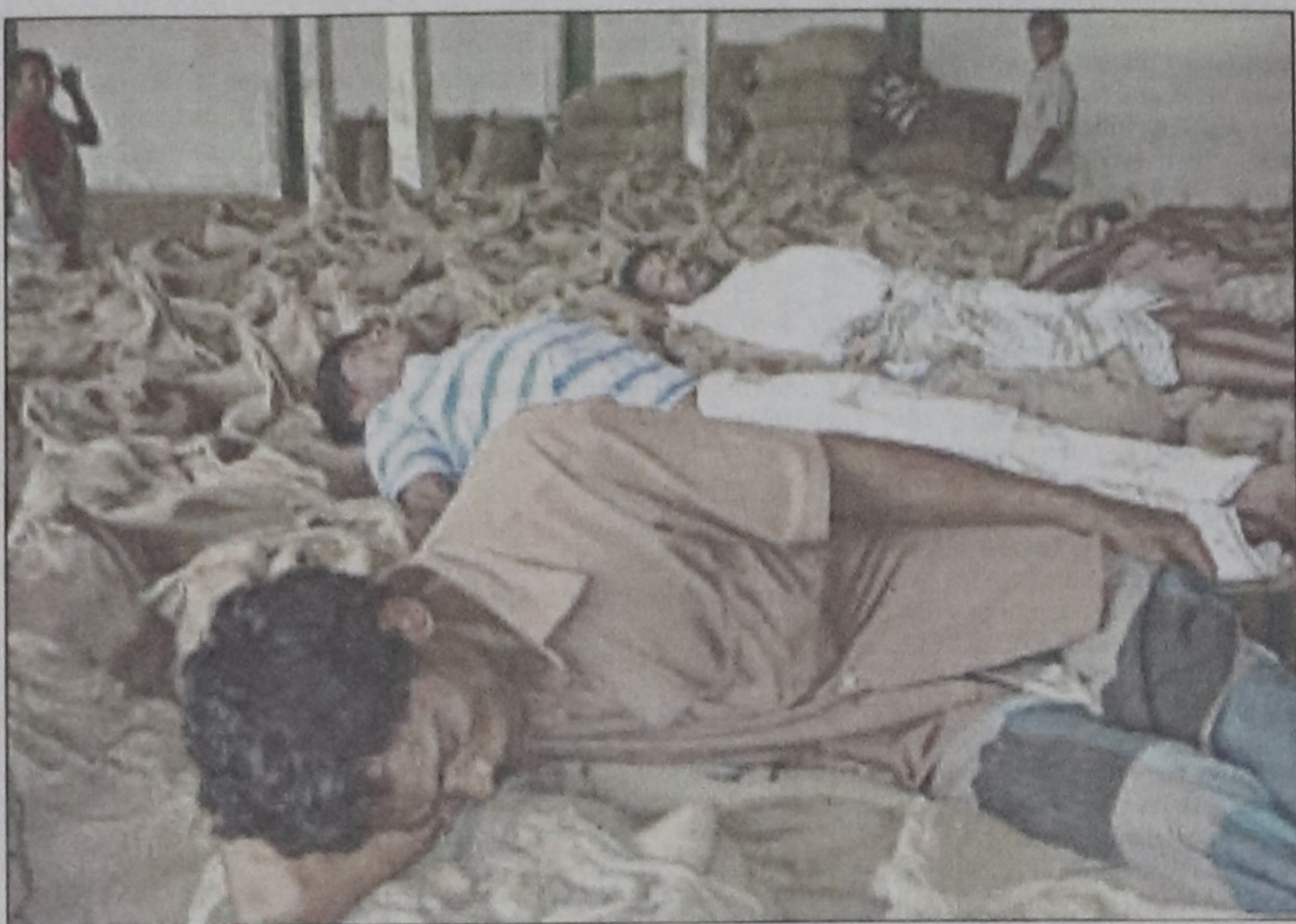
Workers at Shaon Himagar in Nilphamari resting on potato sacks as they have very little work due to decreasing demand for the stored vegetable.

During a recent visit to different cold storages, this correspondent found that a sack of 84 kg of granula variety of potato is selling at between Tk 800 to 850, diamond