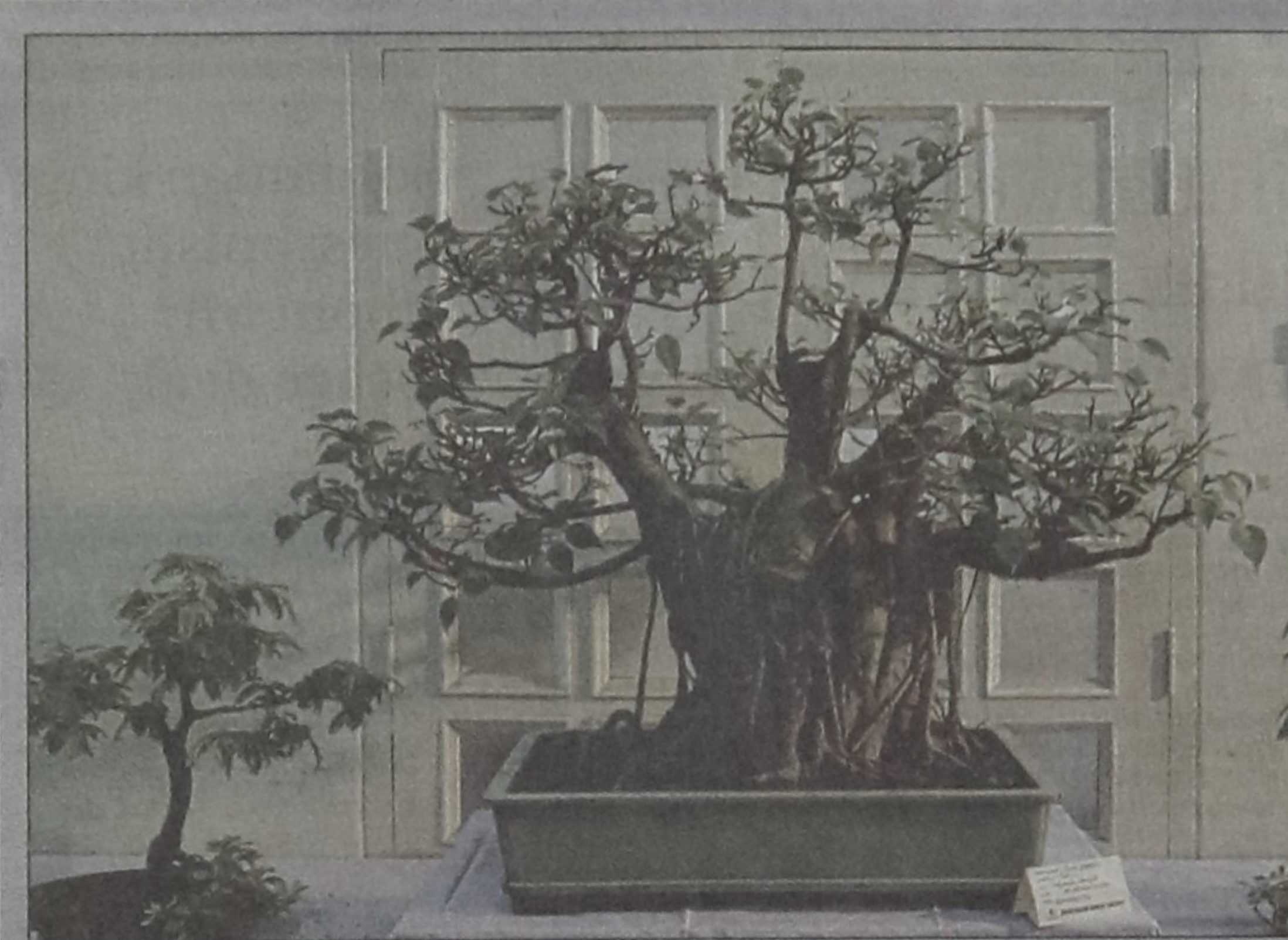
Bonsai versions of local trees were the highlight of the show.