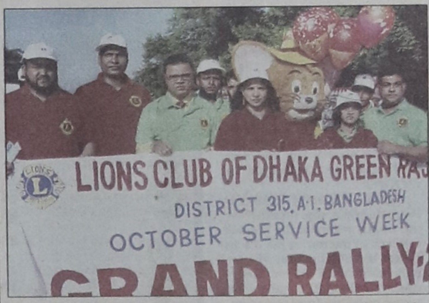
Lions Club of Dhaka Green Rajdhani joins a colourful procession marking the World Lions Service Day in the city on Friday. Lions District 315, A-1, Bangladesh organised the event.