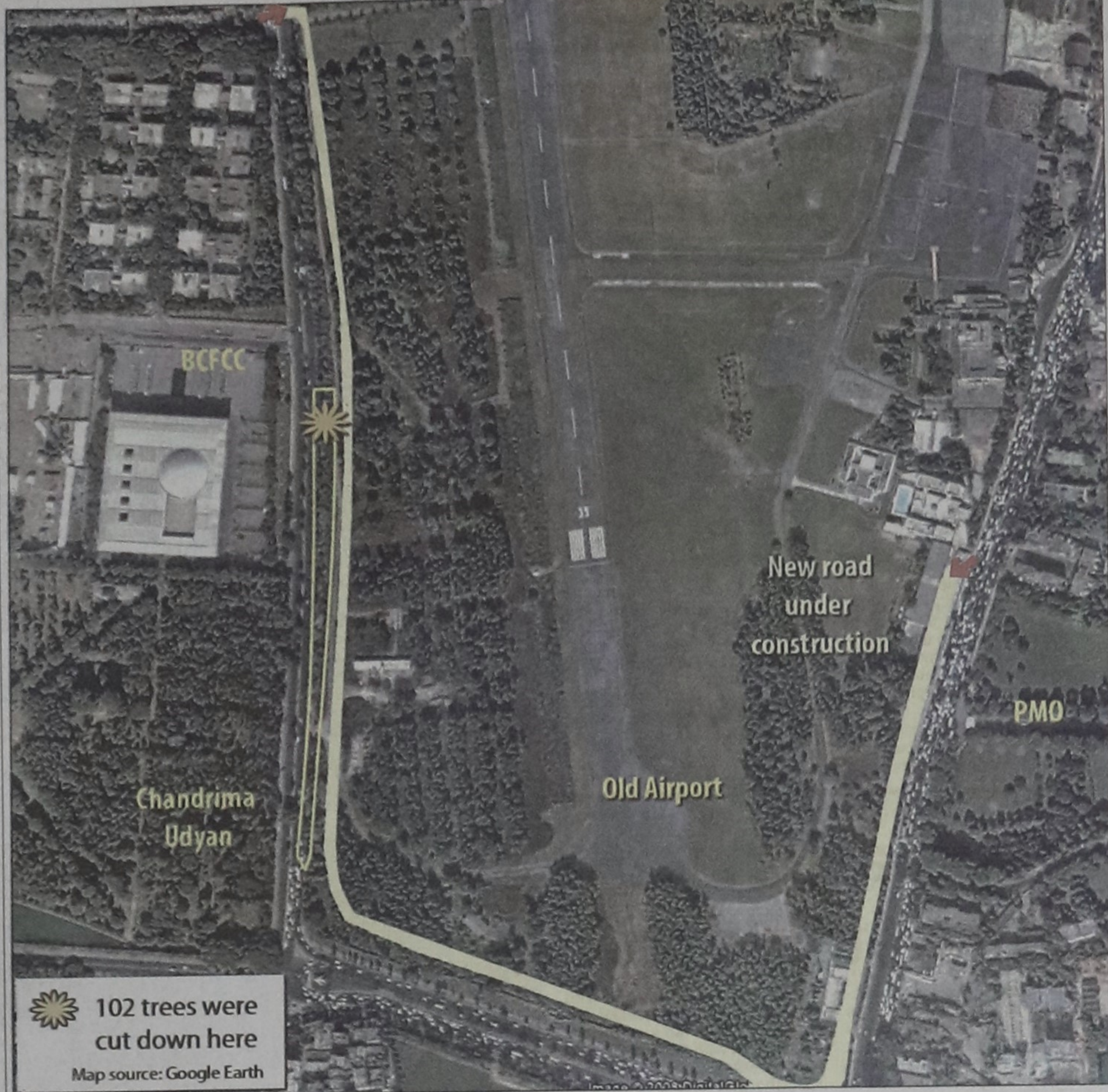
102 trees were cut down here