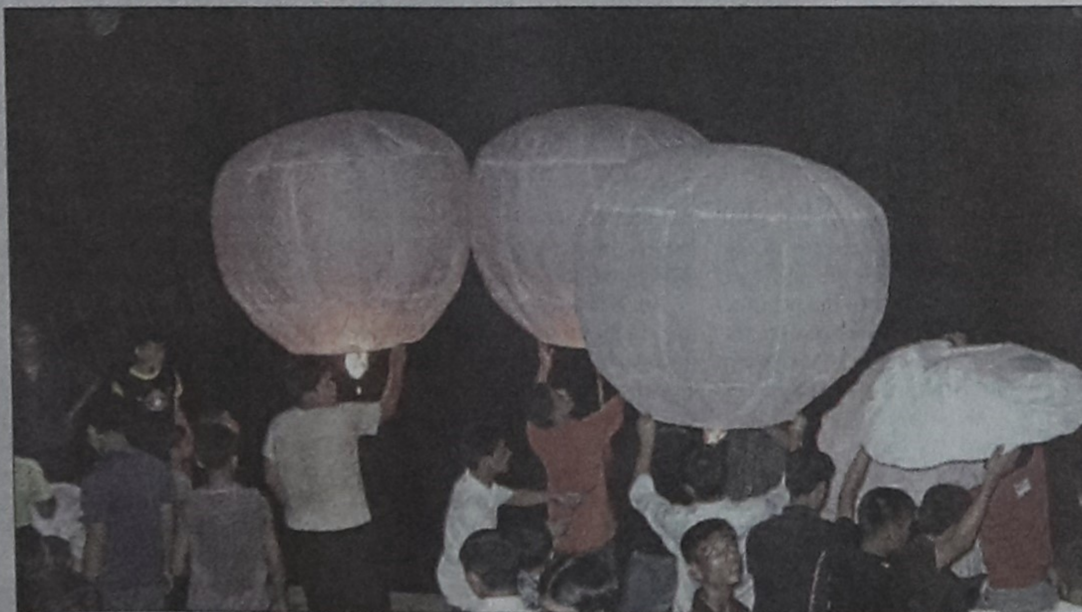
Fanush of different sizes were release in the air by devotees.

Inside the fanush is a candle. Once again the candle