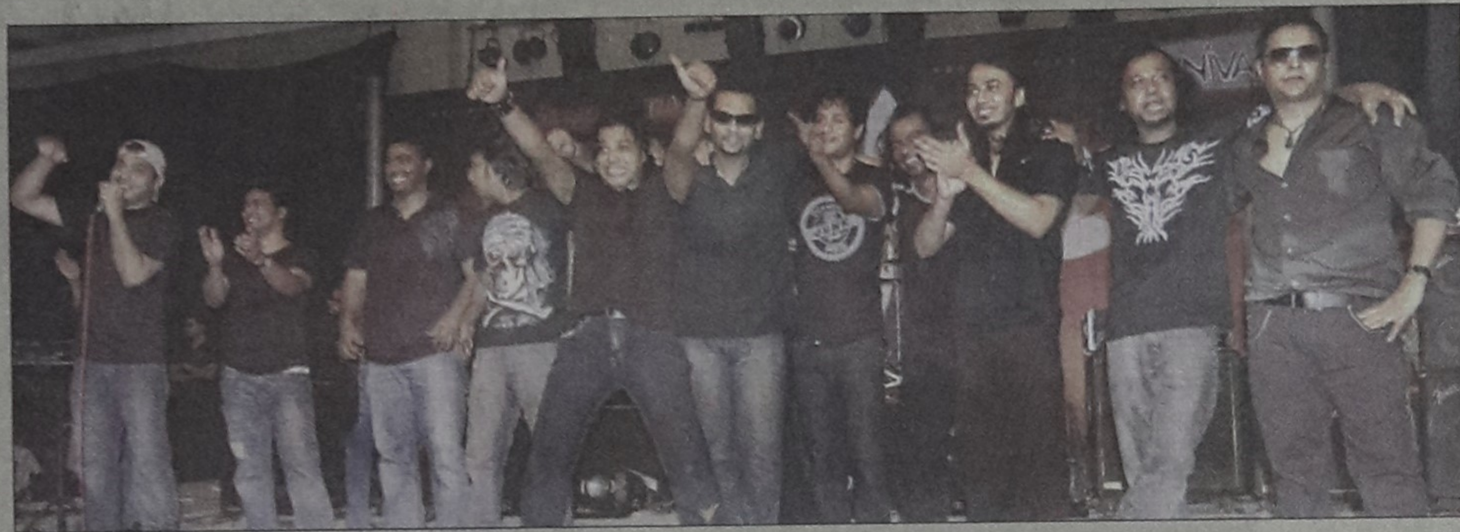
Performances by former members of Warfaze were major attractions at the concert.