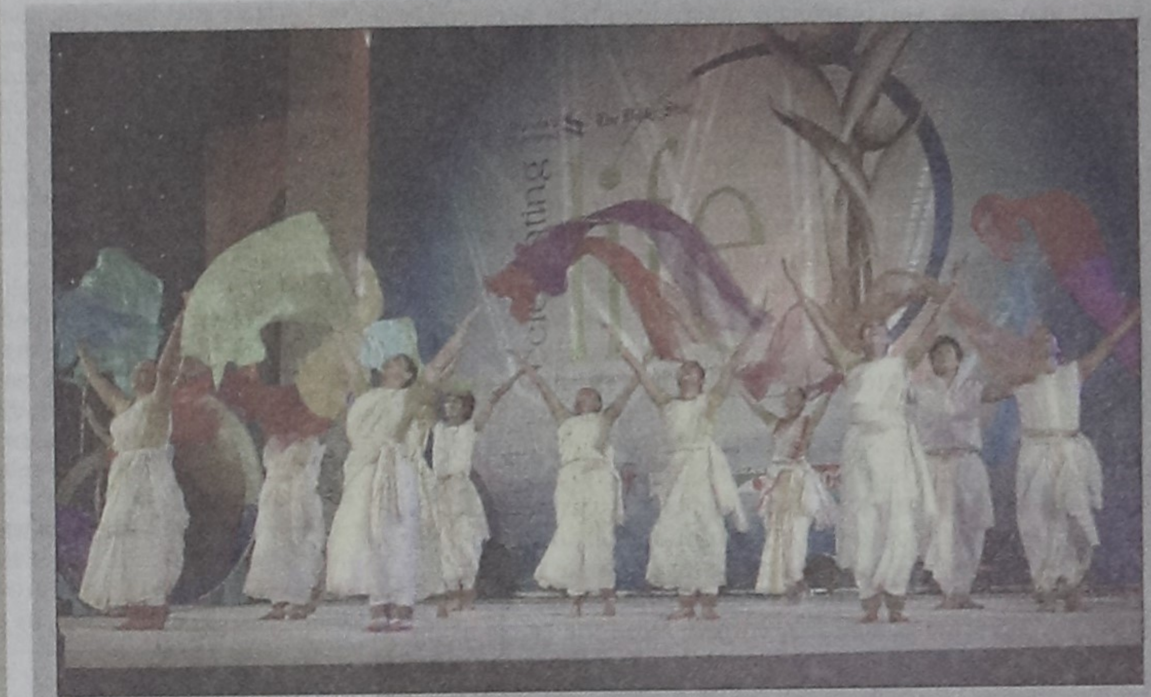
The group dance performance at the "Celebrating Life '08" grand finale.