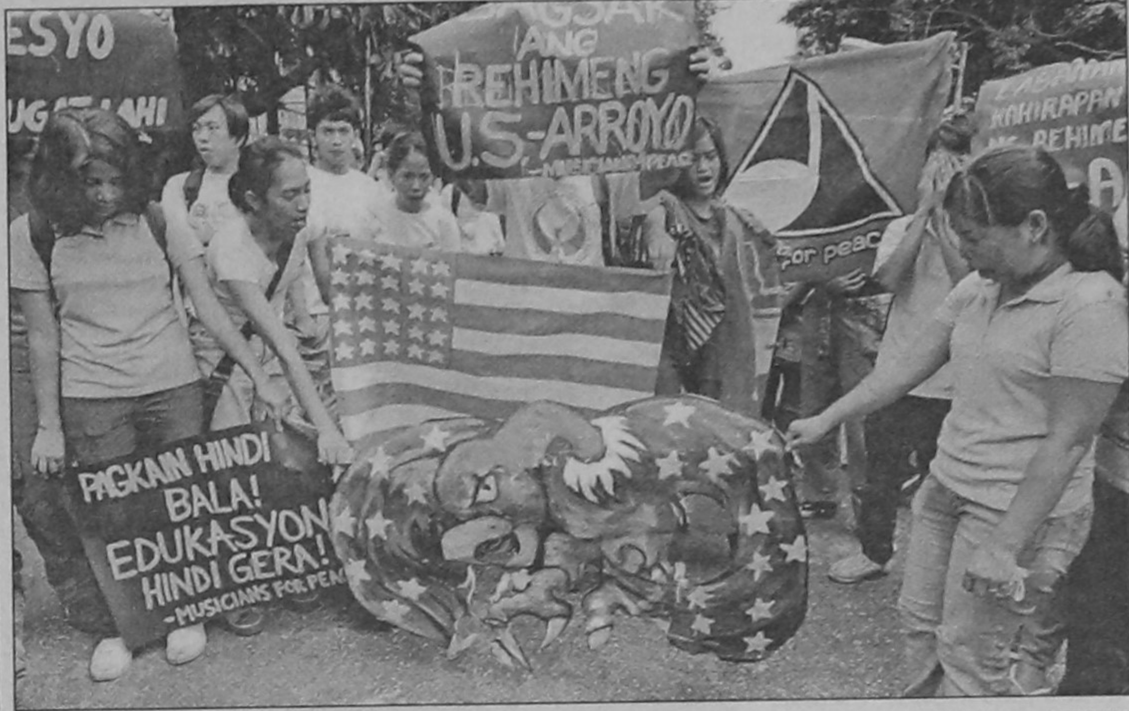
Protesters prepare to burn a caricature of an American eagle and mock US flag during a protest near the US Embassy in Manila yesterday. The activists blamed Washington for its supposedly neoliberal policies, which cause global hunger and poverty.

building better asylum policy, with refugees increasingly obliged to apply for asylum status from outside the EU. Some 220,000 people made applications last year. Immigration will be based on criteria like "Europe's reception capacity in terms of its labour market," with the emphasis on controlling would-be immigrants rather than encouraging people to come. The pact also insists that nations take the "interests" of their neighbours into account when formulating immigration, integration and asylum policies -- shorthand for avoiding the mass handout of residency permits. Italy and Spain have angered some of their partners by giving papers to some 700,000 people in recent years.