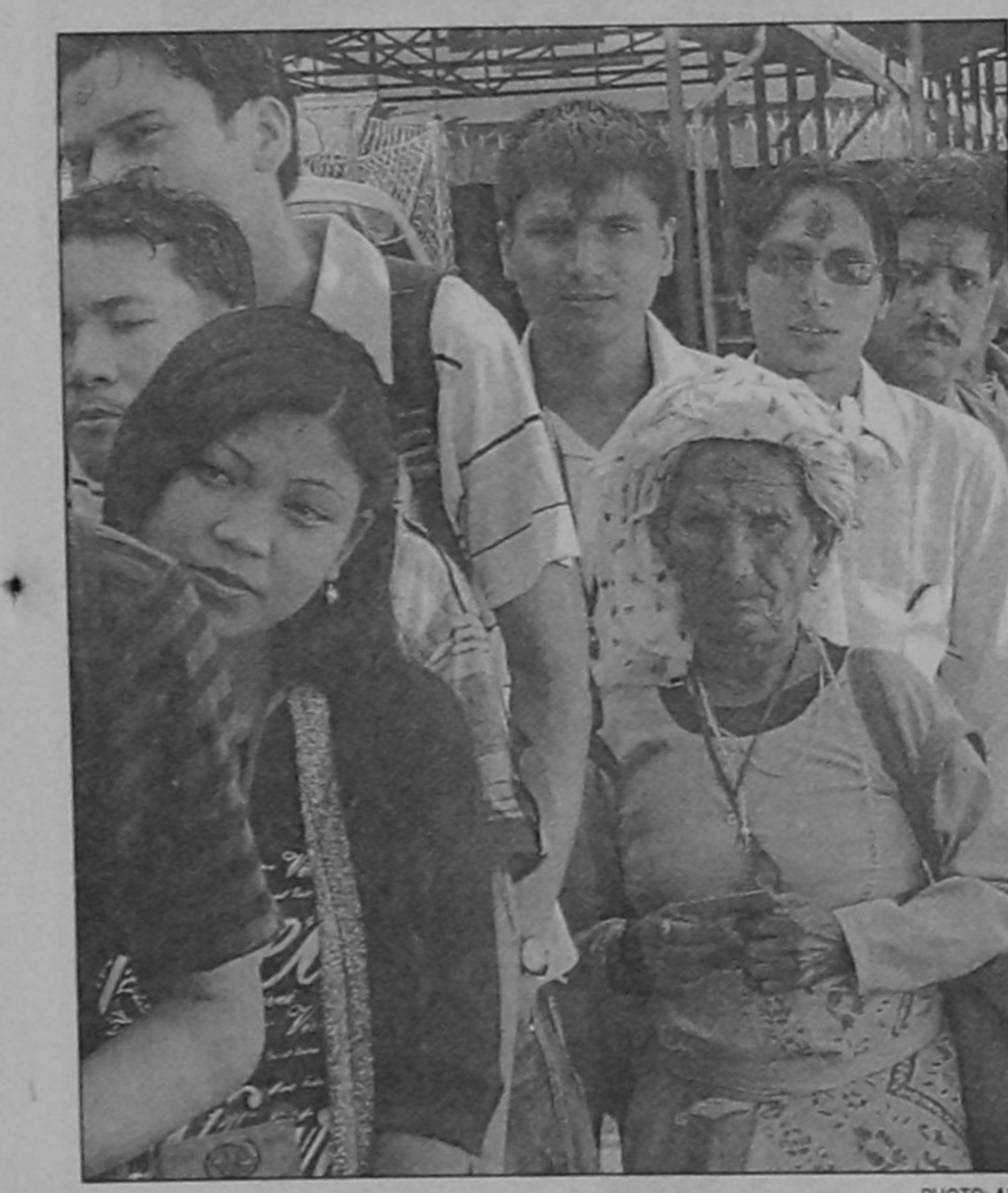
Bhutanese refugees line up at the office of International Office for Migration (IOM) in Damak, southeast of Kathmandu on September 12, 2008 as they prepare to leave the refugee camps in a "third country resettlement" programme. The US and six other countries have agreed to take at least 60,000 Bhutanese refugees, and after 16 rounds of fruitless negotiations between Nepal and Bhutan, Nepal has agreed to allow the refugees to resettle.