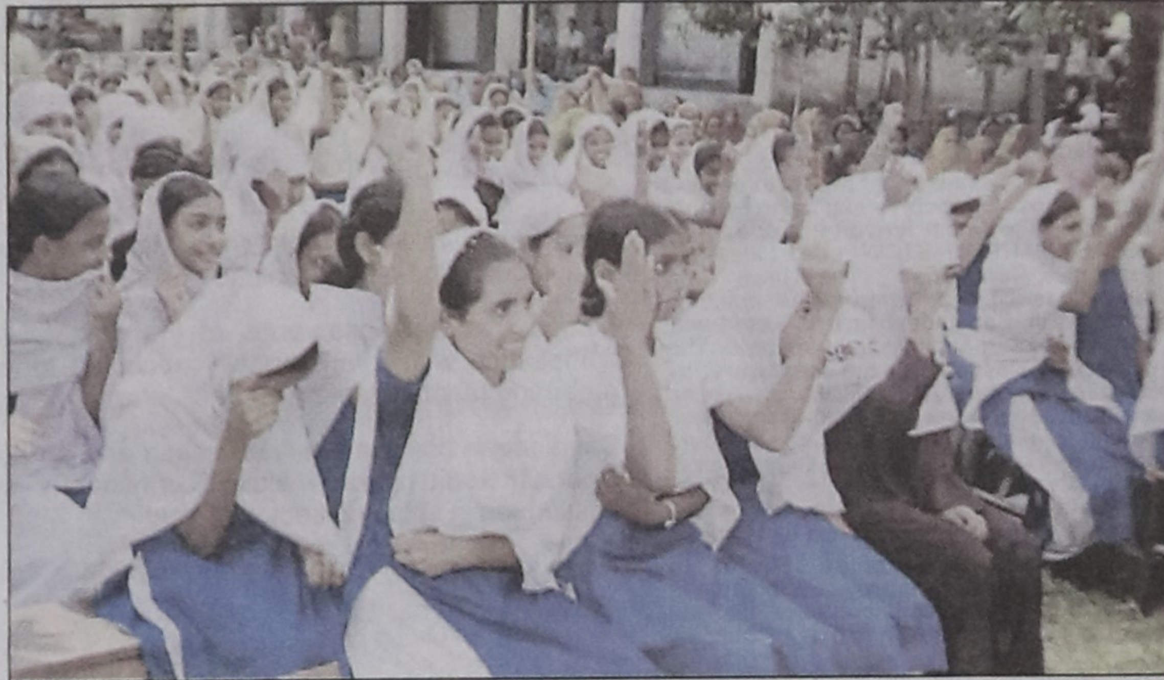
Students of Baliadanga Islamia Girls High School in Chapainawganj Sadar upazila taking oath against dowry, acid violence and early marriage yesterday.