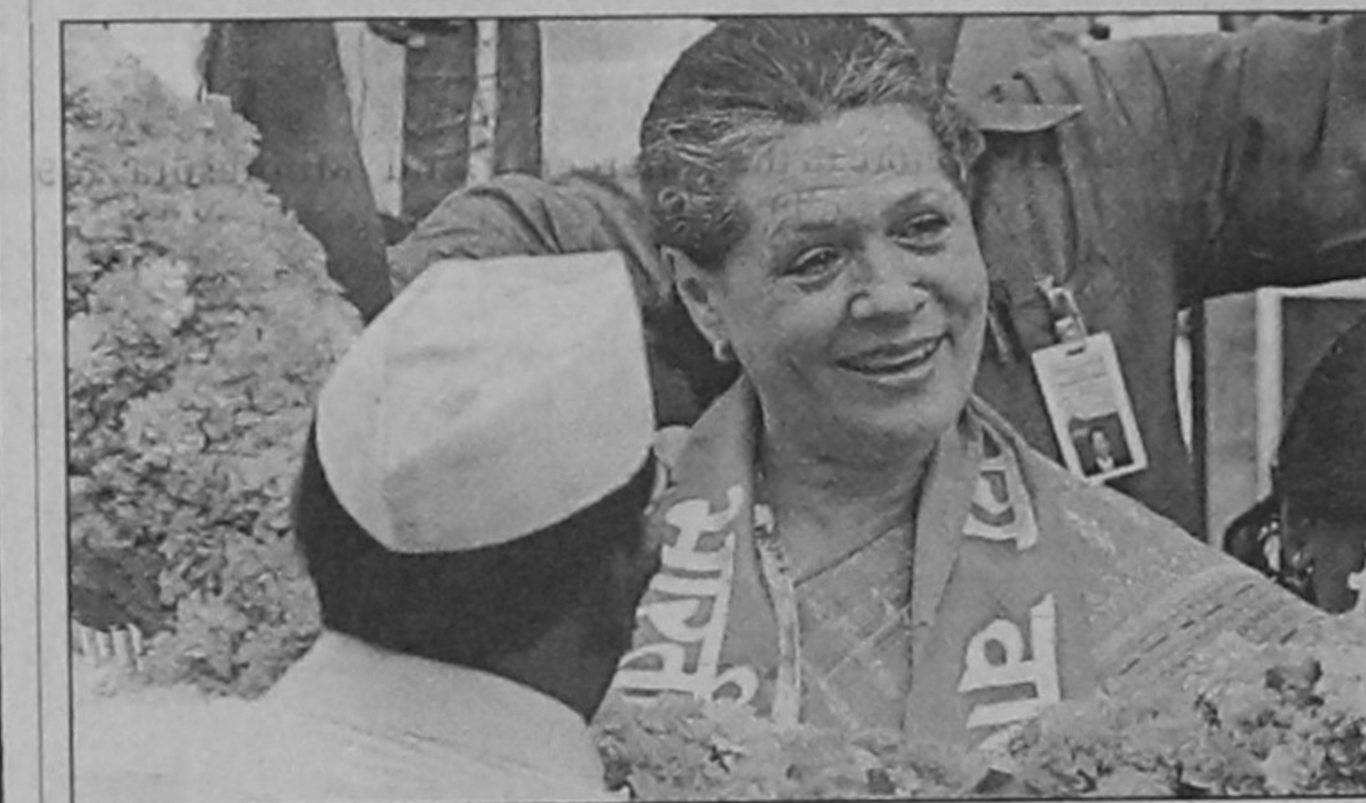
Chairperson of UPA government and Congress Party president Sonia Gandhi (C) smiles as she is garlanded on the occasion of the Hindu festival of Maharishi Valmiki Jayanti at her residence in New Delhi yesterday.

"You know the matter is now before the court and I will not make any comments", she said when asked about the cancellation of the land allotment by the Mayawati government.