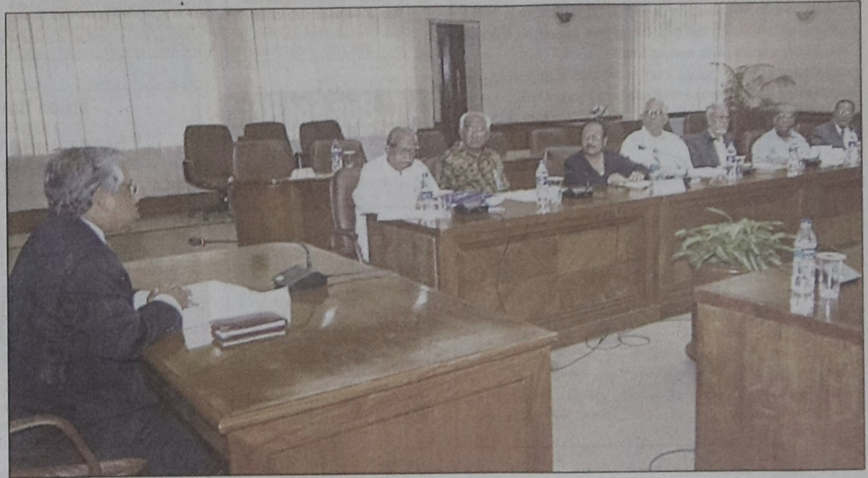
Chief Adviser Fakhruddin Ahmed exchanges views with BNP leaders as part of the national dialogue at his office in the city yesterday.

Later, children presented an impressive cultural show.