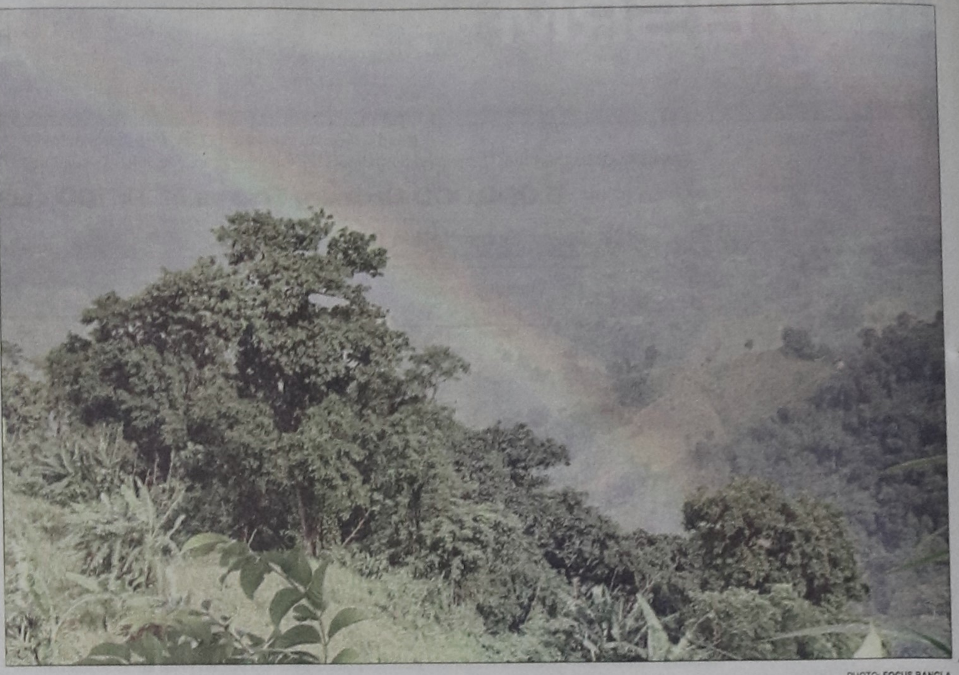
SCENIC BEAUTY OF CHT: A rainbow appearing over a picturesque landscape in Bandarban presents a captivating sight.

Former BNP lawmaker from Bhola-3 and former state minister Maj (ret'd.) MA Hafiz is accused in 2 cases.