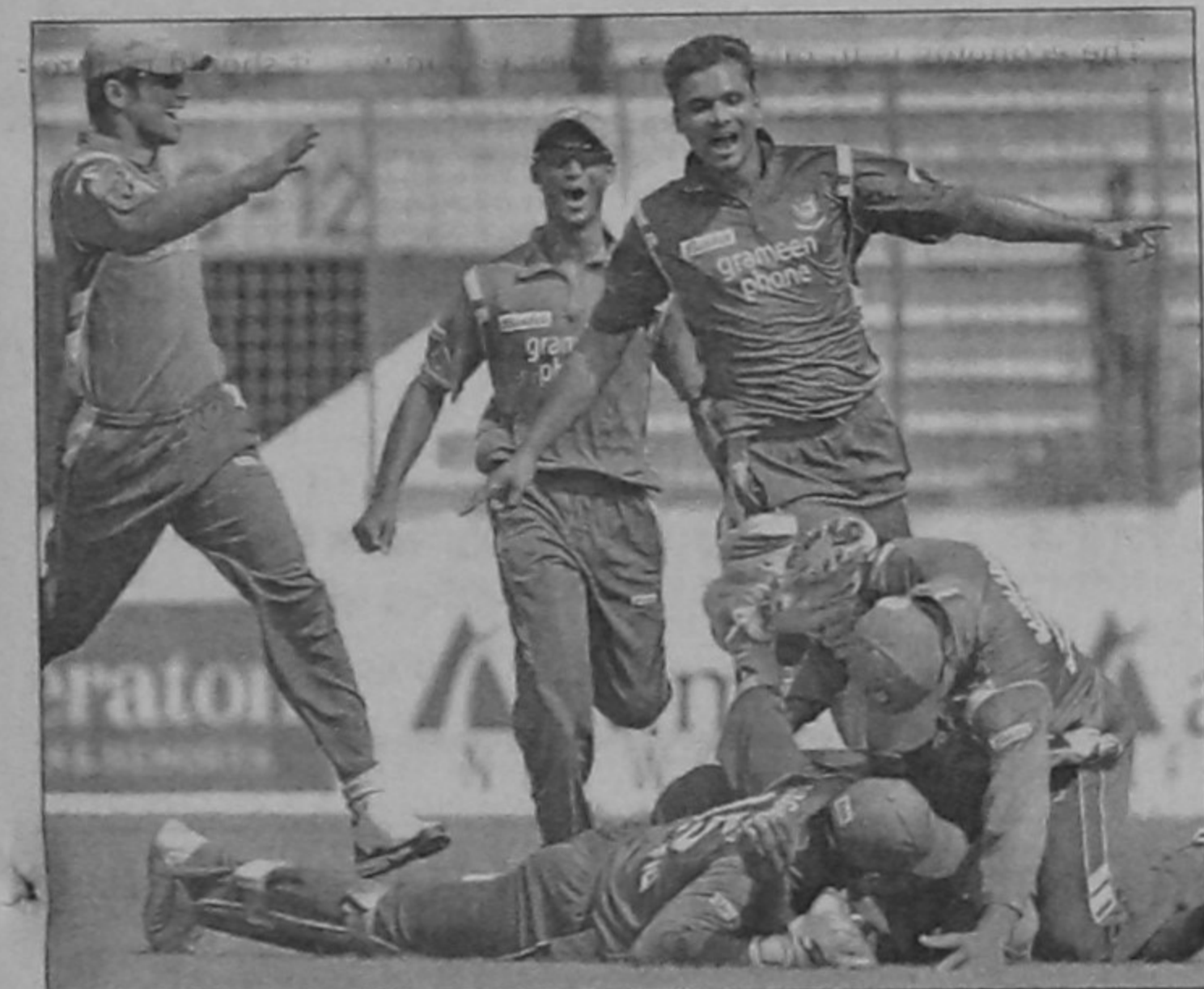
The pride of representing one's country.

Quazi Zulquarnain Islam writes sports for The Daily Star.