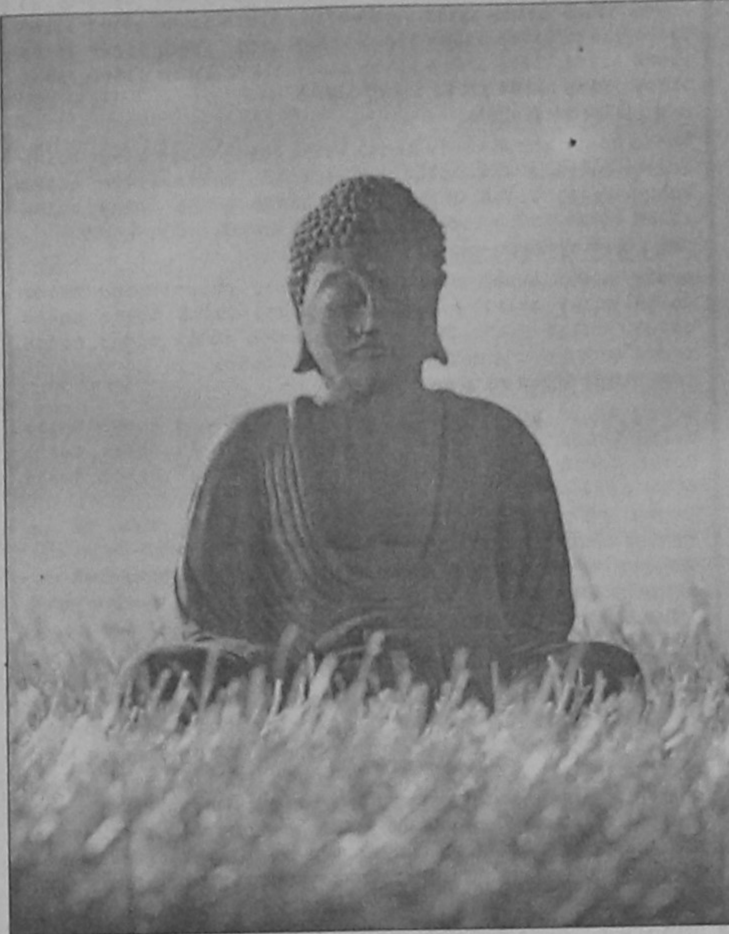
Sabbesattha Sukita hunto.

roots of all happiness of human beings. The Buddha says in the Dharmapada : "If a man does something good, let him do it again and again. Let him find joy in his good work, joyful is the accumulation of good work."