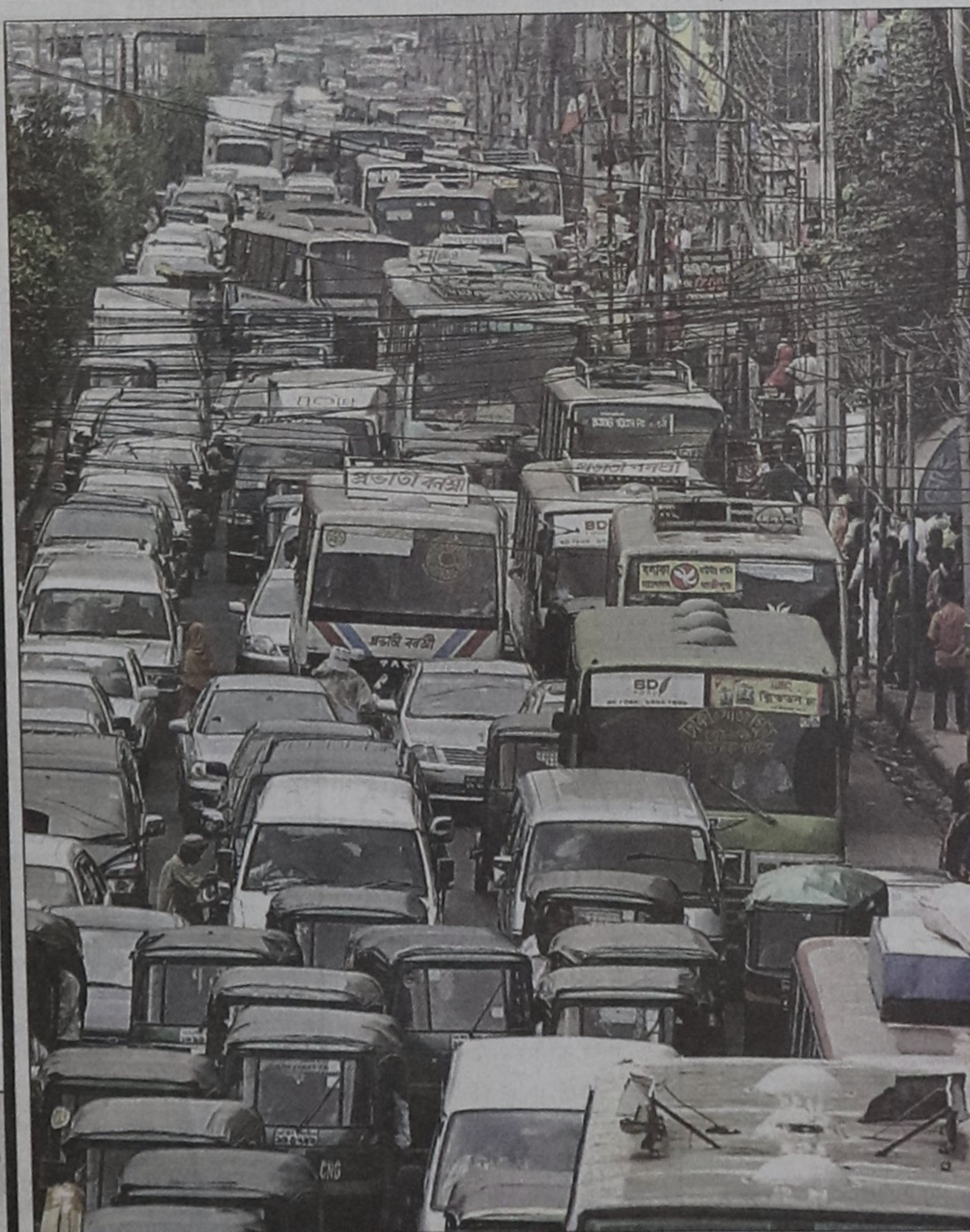
The same old traffic congestion returns to the city after the Eid and Puja holidays. The picture was taken at Maghbazar intersection in the city yesterday.