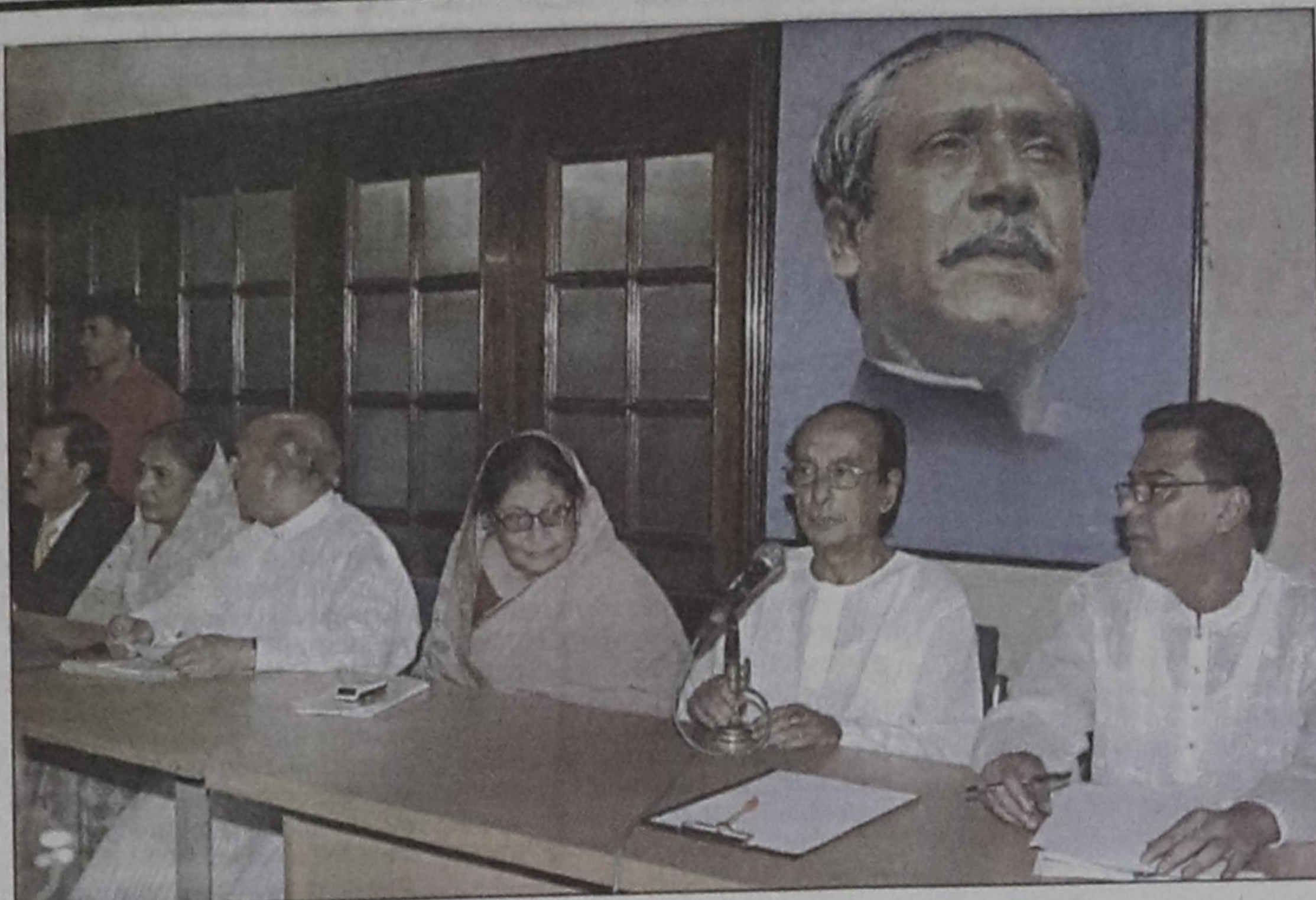
Awami League Acting President Zillur Rahman speaks at the central working committee meeting of the party at its Dhanmondi office in the city yesterday.

Bus services resumed at around 3:00pm following the fruitful meeting, said the sources.