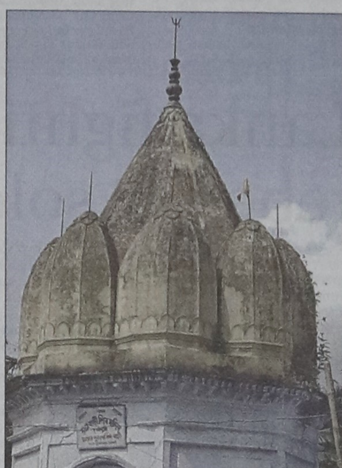
The peak of the Shiv Temple in Taherpur.