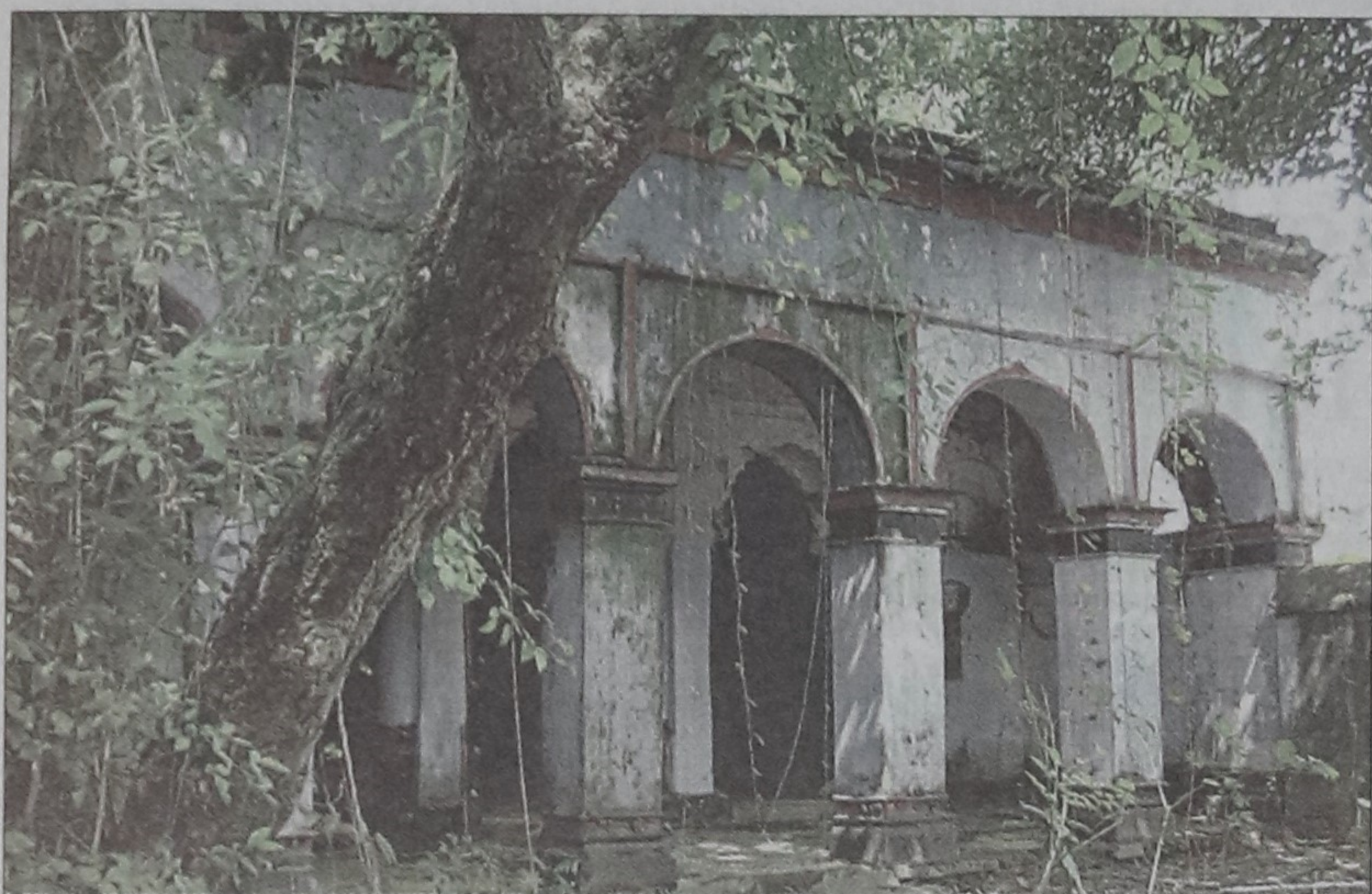
This old temple has now become a breeding ground for weeds and has been reportedly encroached by Taherpur College authorities.

The origin of mass Durga Puja celebration