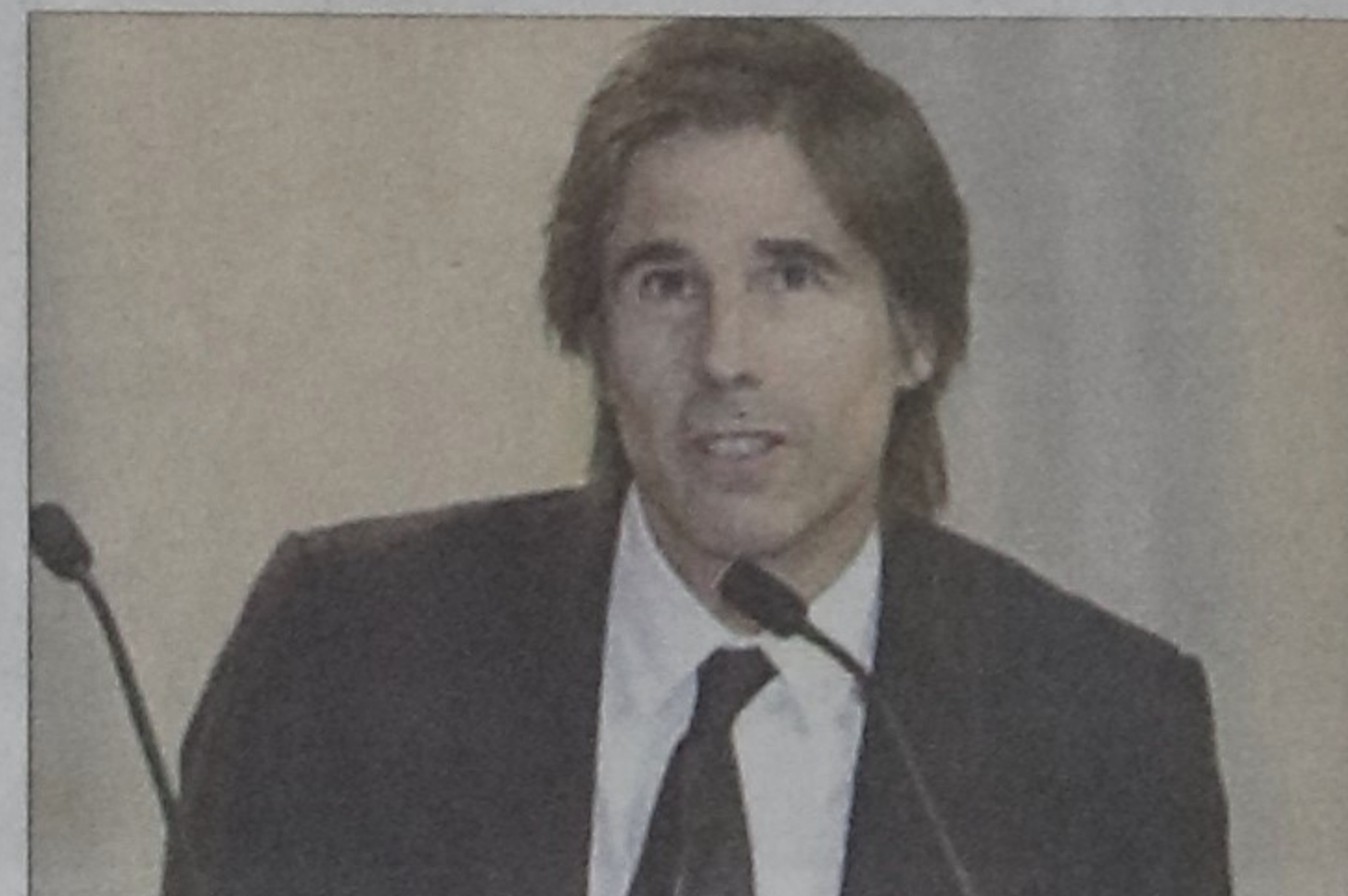
Walter Salles at the closing ceremony of the Cannes International Film Festival, 2008.

Salles is approaching "On the Road" in a thorough manner. He followed the route Kerouac took when he wrote the book and