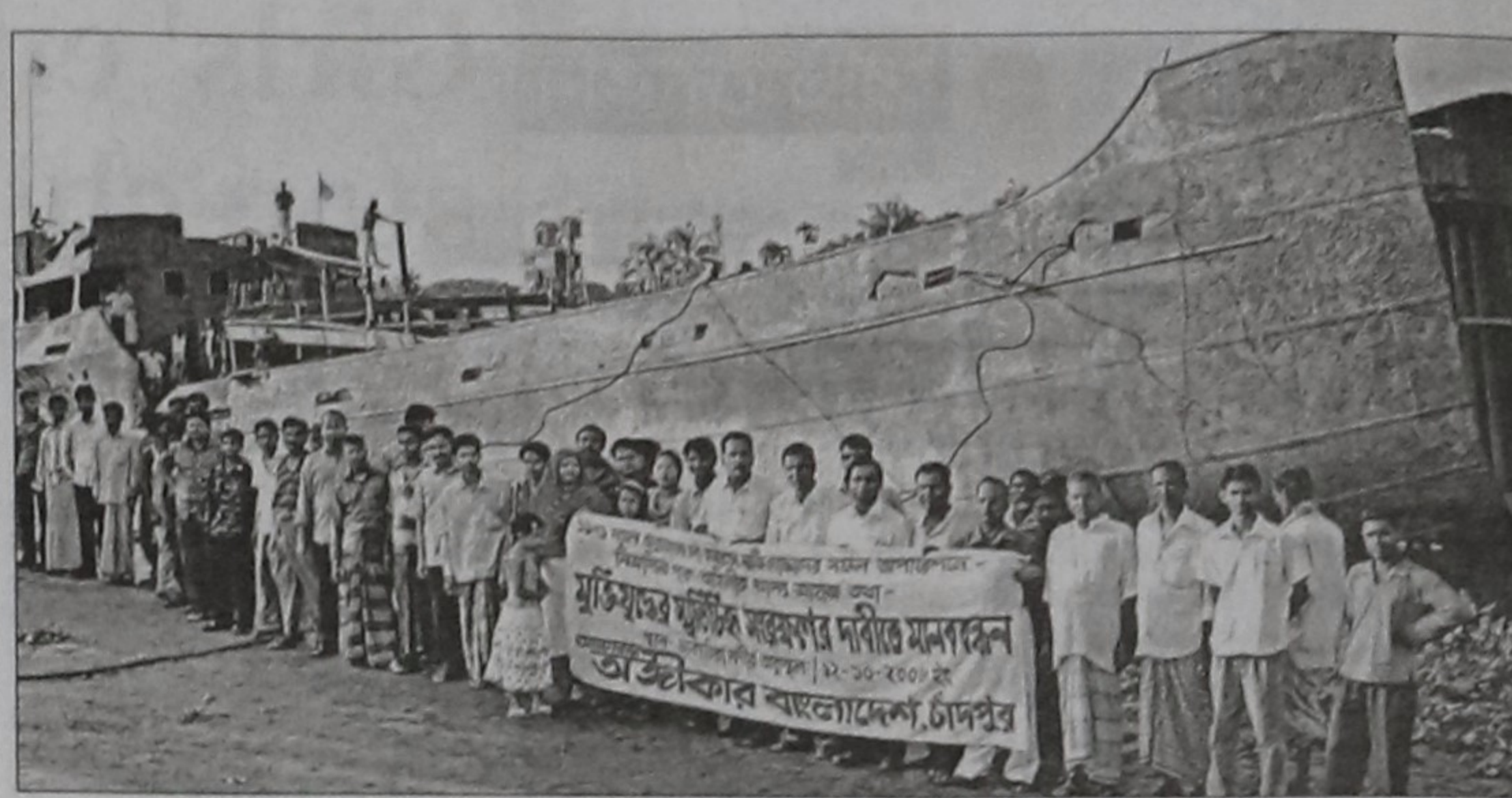
Angker Bangladesh forms a human chain on Dakatia River at Chandpur yesterday demanding preservation of recently salvaged ship MV Lorum, sunk by freedom fighters during Liberation War. It was used for carrying goods for Pakistan occupation forces.