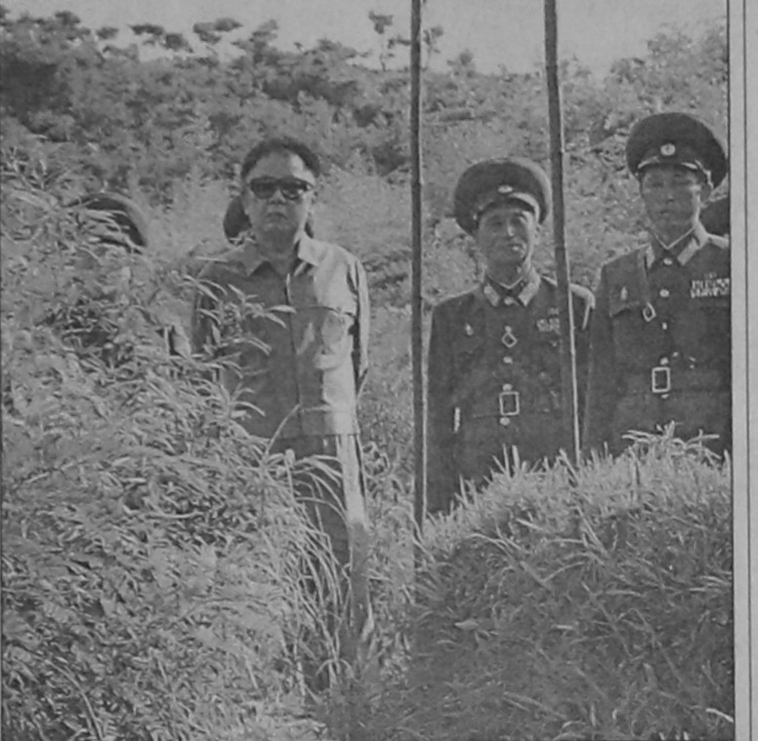
This undated picture, released from the Korean Central News Agency yesterday shows the North Korean leader Kim Jong Il inspecting a women's battery of Korean People's Army unit 821 at an undisclosed place in North Korea.

The founder of Aceh's separatist rebel movement voiced his commitment to the troubled peace process Saturday as he made an emotional homecoming after nearly 30 years in exile.