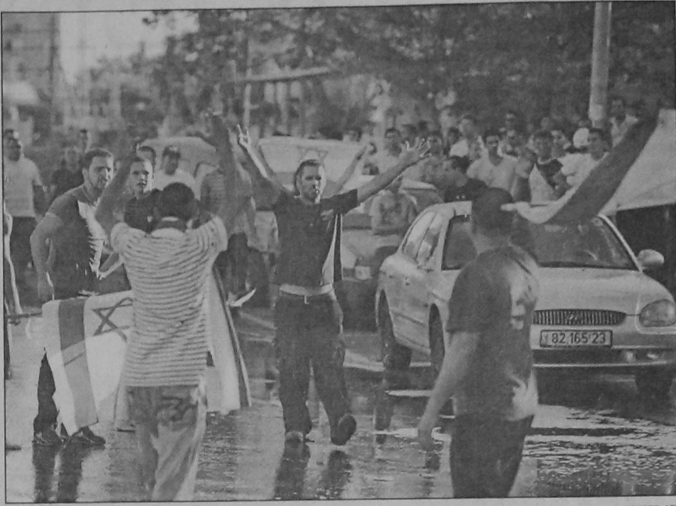
Israeli crowds shout and gesture toward riot police during clashes with Israeli security forces in Acre on Friday. Police clashed with Jewish protesters in Acre as Foreign Minister Tzipi Livni travelled to the northern Israeli city to appeal for calm after two days of clashes between Arabs and Jews.

Thailand's prime minister insisted he would not quit, but in the past few days, senior military leaders have put pressure on the premier to take a decision on his future and solve the crisis.