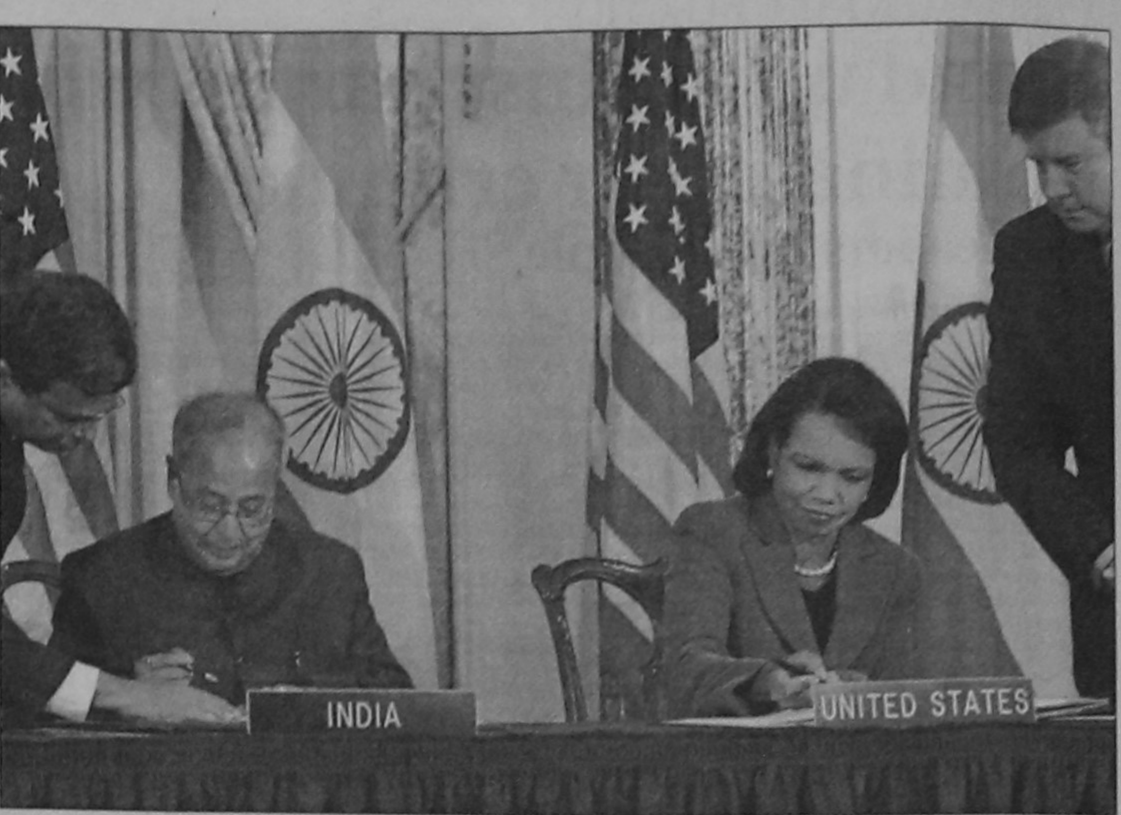
Indian Foreign Minister Pranab Mukherjee (L) signs the US-India Civil Nuclear Agreement, with US Secretary of State Condoleezza Rice (R) in the Benjamin Franklin room at the State department in Washington, DC on Friday. The agreement lifts the ban on US-Indian civilian nuclear trade.

AFP, Khar Taliban rebels decapitated four pro-government tribal elders in a Pakistan border region where the army is fighting al-Qaeda and extremist militants, officials said Saturday. It was the second killing this week in Bajaur of tribal elders, who have established an armed force to support the government's military campaign against al-Qaeda and Taliban fighters in the area. "This morning locals reported bodies of four tribal elders were lying on roadside," local administration official Mohammad Jamil told AFP, adding that the bodies showed extensive signs of torture. A security official who declined to be named said the beheadings had been done by al-Qaeda and Taliban militants to scare the local population away from supporting the army operations.