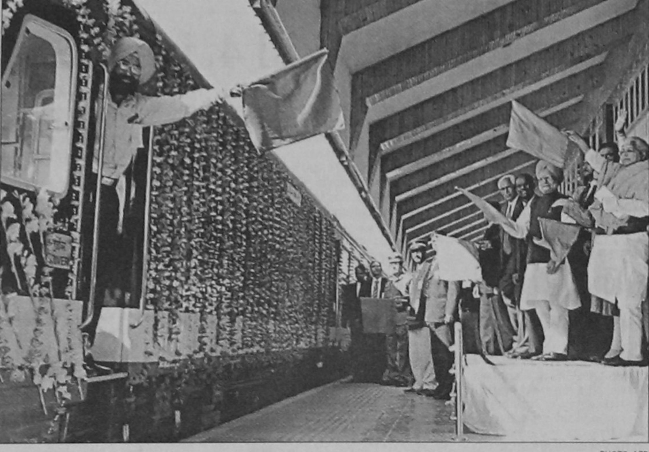
Indian Prime Minister Manmohan Singh (2R) and Indian Railways Minister Lalu Prasad Yadav (R) wave at inauguration of a train service in Srinagar yesterday. Indian Kashmir's first train service the fruit of an eight-year project, that had to overcome the twin challenges of tough terrain and separatist violence has been flagged off by Indian Prime Minister Manmohan Singh carrying a heavy weight of local expectation, built up by promises that the new line will help transform the volatile Kashmir Valley.