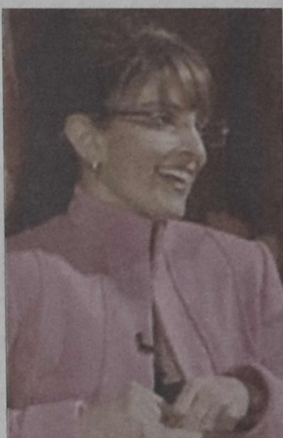
Tina Fey (left) portrays Sarah Palin during an SNL skit. (Right) Palin waves to the crowd.

During that first impersonation, Fey got laughs simply by nailing Palin's accent. She described global warming as "just God hugging