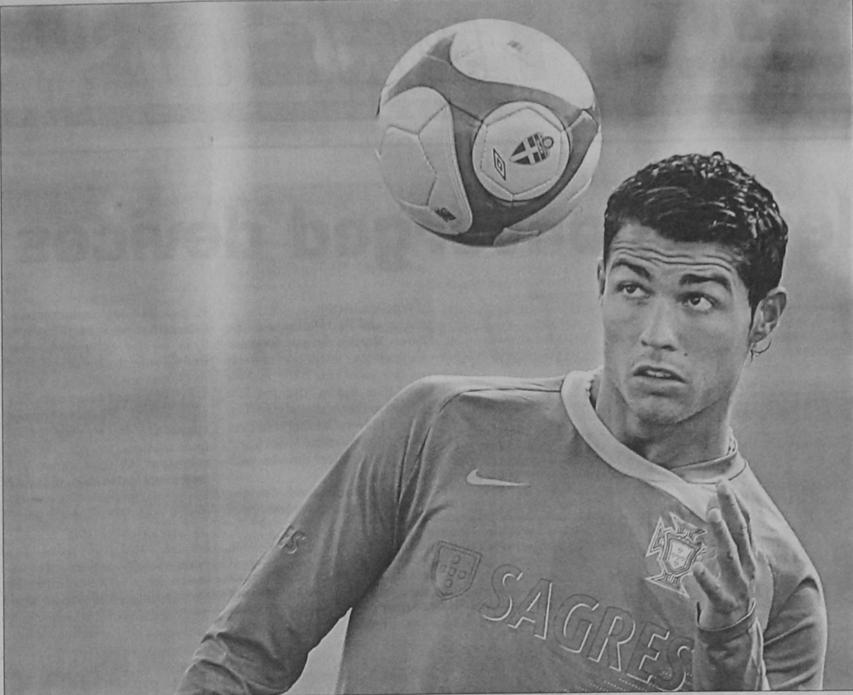
EYES FIXED ON THE BALL: Portugal star Cristiano Ronaldo heads the ball during a training session in Obidos on Wednesday ahead of their 2010 World Cup qualifier against Sweden on Saturday.

While the Football Association have yet to officially rule Terry out of the match, reports suggest the likes of Matthew Upson and Joleon Lescott are already being readied to start on Saturday, and could even be required for the match with Belarus next week.