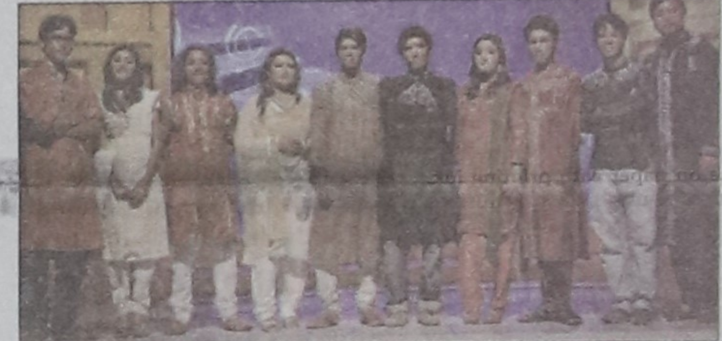
The top ten contestants of Close Up 1.

The results will be announced next Sunday (October 12). Ahmed