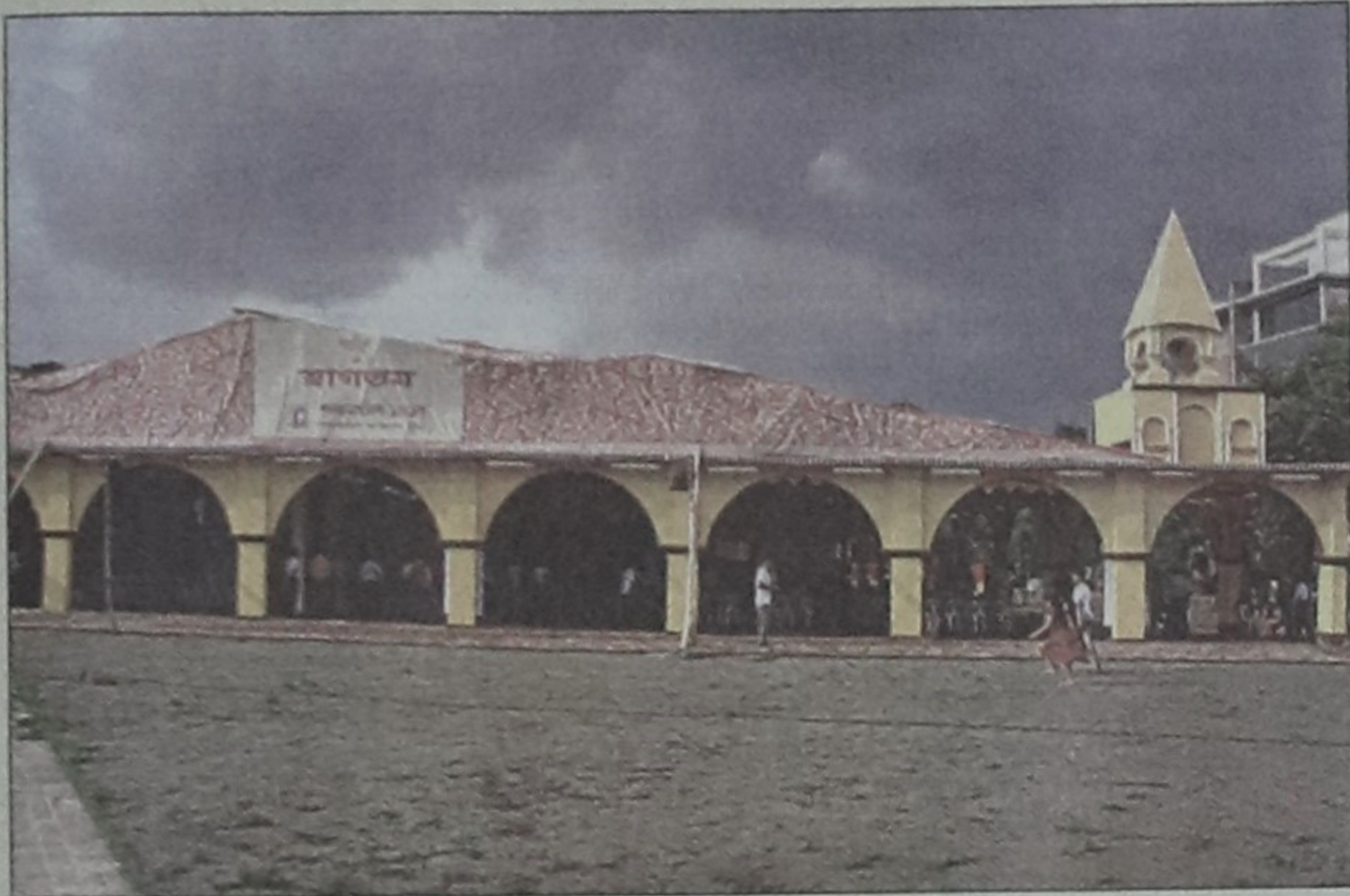
The mandap at Banani.