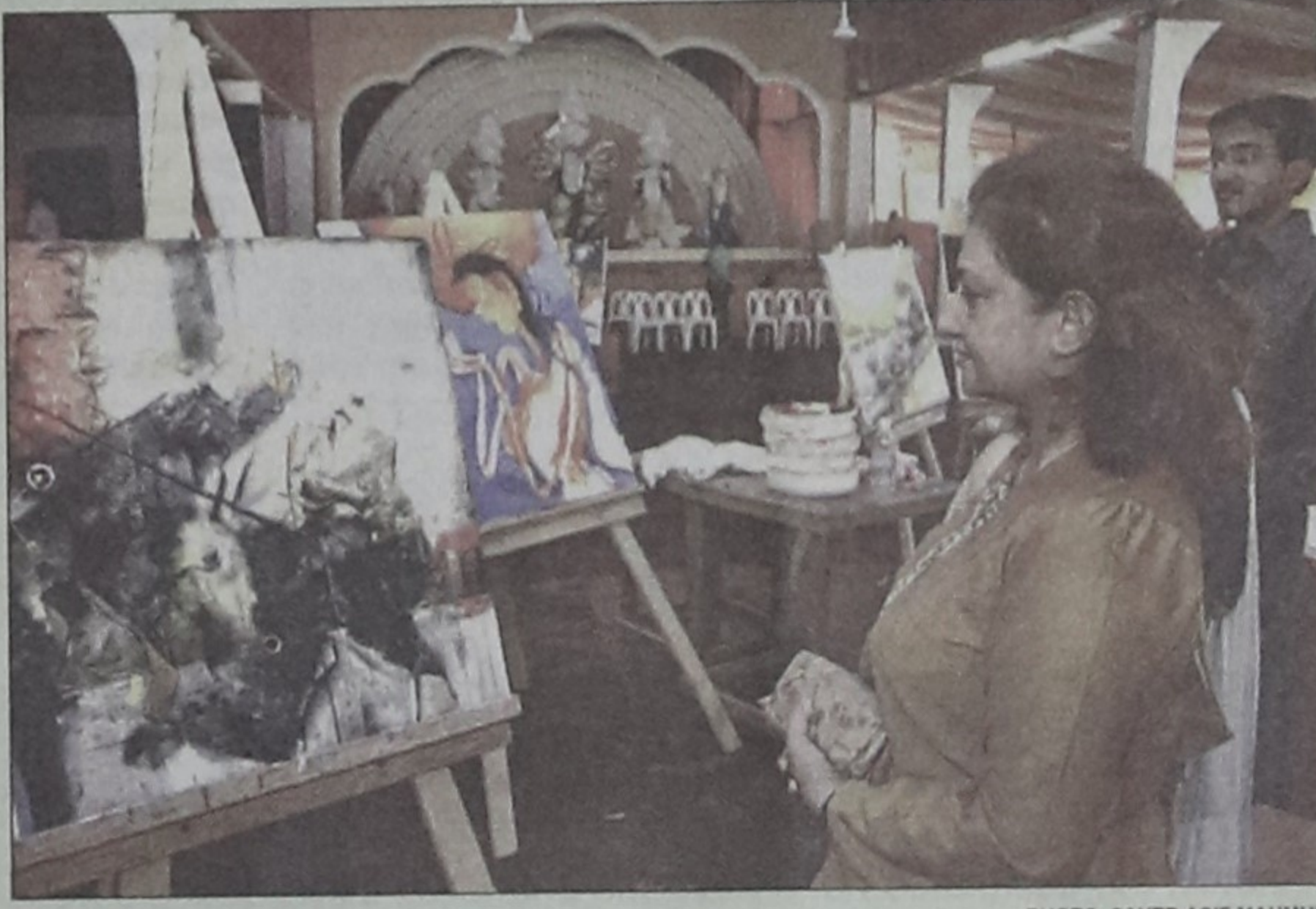
A painting exhibition at the venue added a new dimension to the celebration.

providing an apt sangat . Surprisingly, for a major public event, the sound system is unusually well managed. The crowd swaying to the song. And there she was... with Lakshmi and Ganesh to her right, and Saraswati, Kartik to her left...the celebration marks her arrival... "The Goddess with feet of clay" has arrived in New Dhaka.