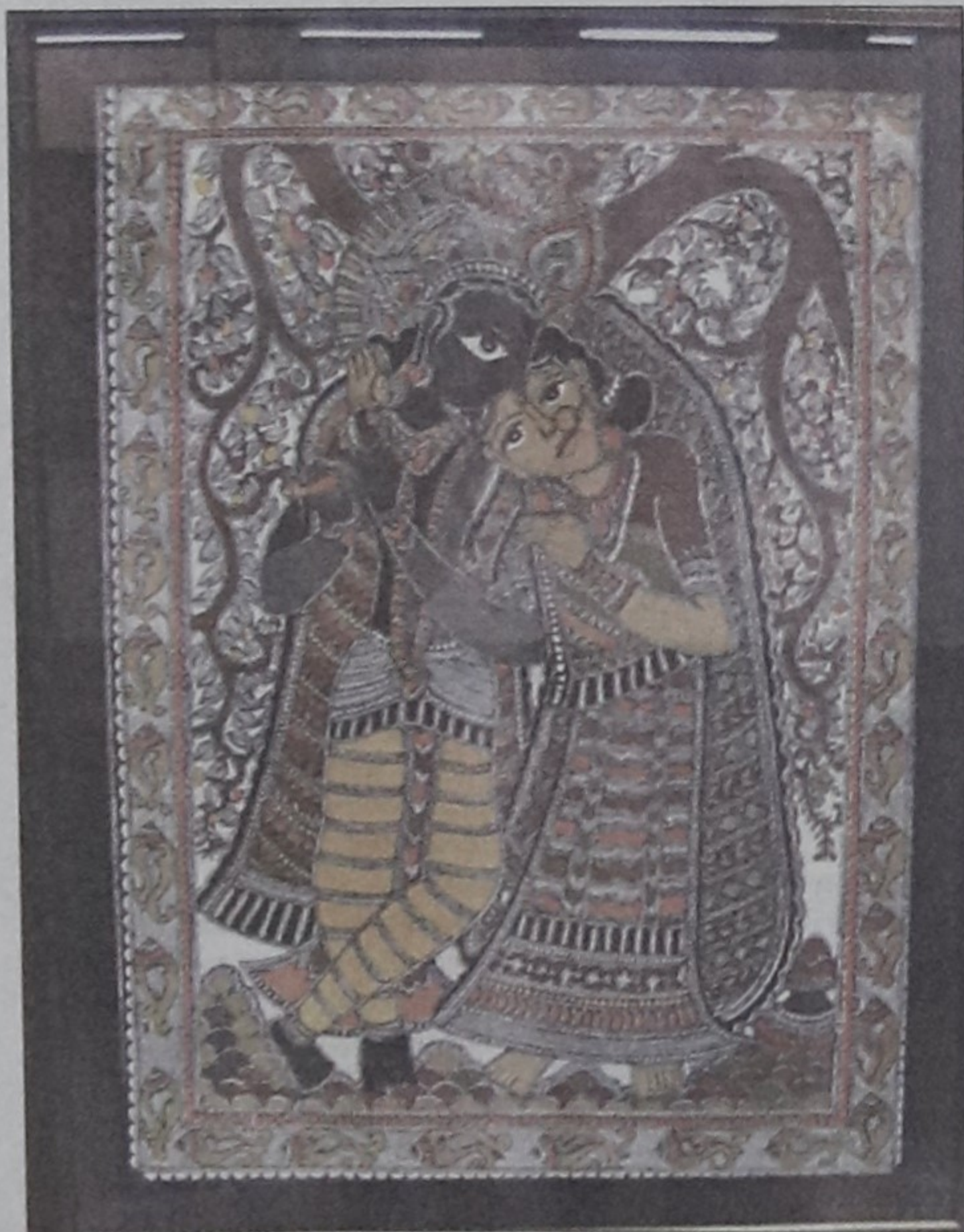
Painting at the exhibition.

The exhibition in New Delhi was sponsored by the Academy of Fine Arts & Literature, New Delhi along with the Krishnan family from Surajkund, Haryana. The venue was the Arpana Art Gallery, run by well-known artist Arpana Caur. While gallery space was provided free of cost, the organiser of the exhibition was Family Of Disabled (FOD), an NGO committed to the cause of the disabled. The exhibition was the fifth in the series. Says