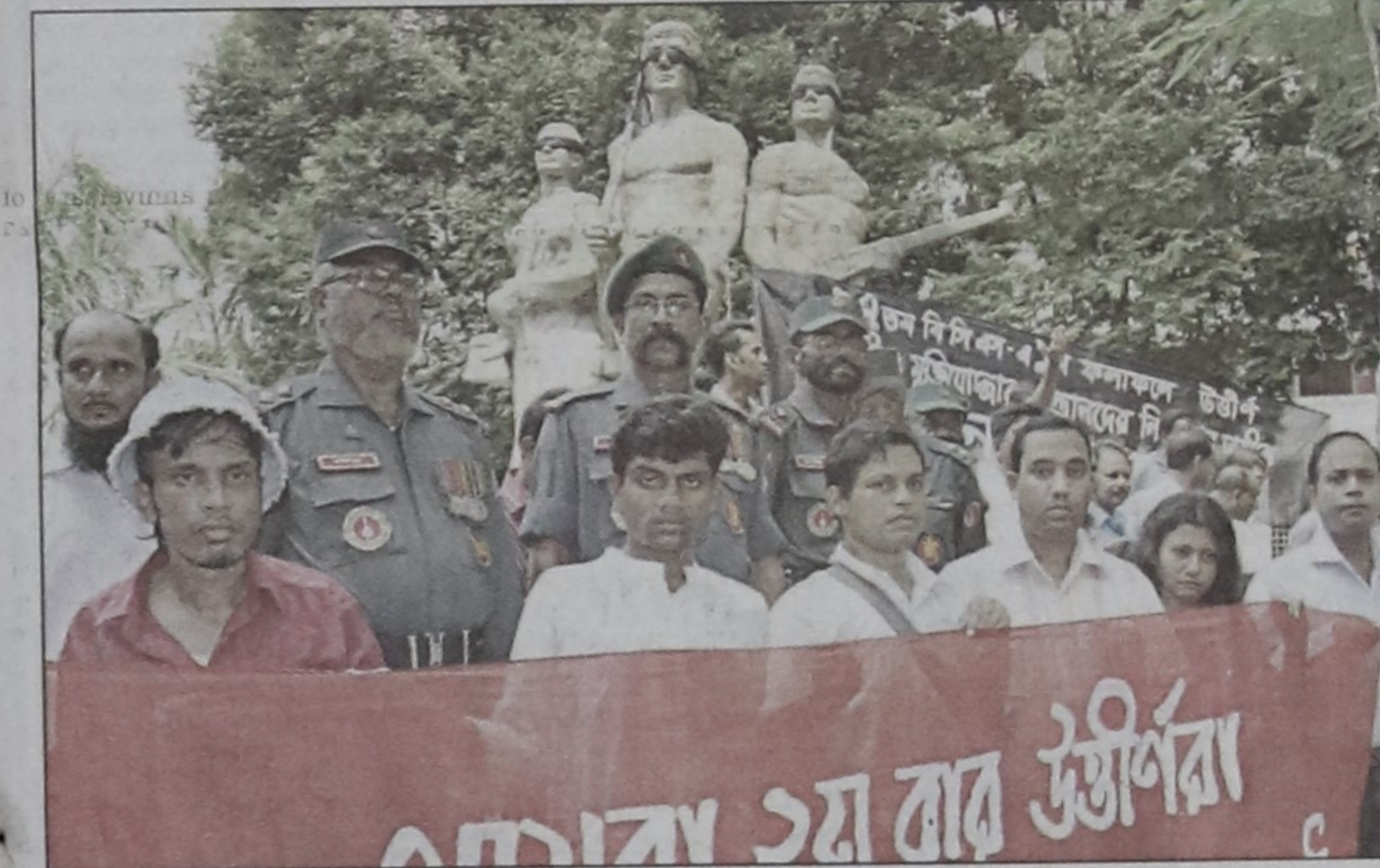
The unsuccessful candidates of the 27th BCS Examinations form a human chain at the foot of Aparajeyo Bangla at Dhaka University campus yesterday demanding immediate removal of PSC chairman and protesting publication of the second-phase results of the examination.

BKP central leaders and a number of freedom fighters also took part in the meeting.