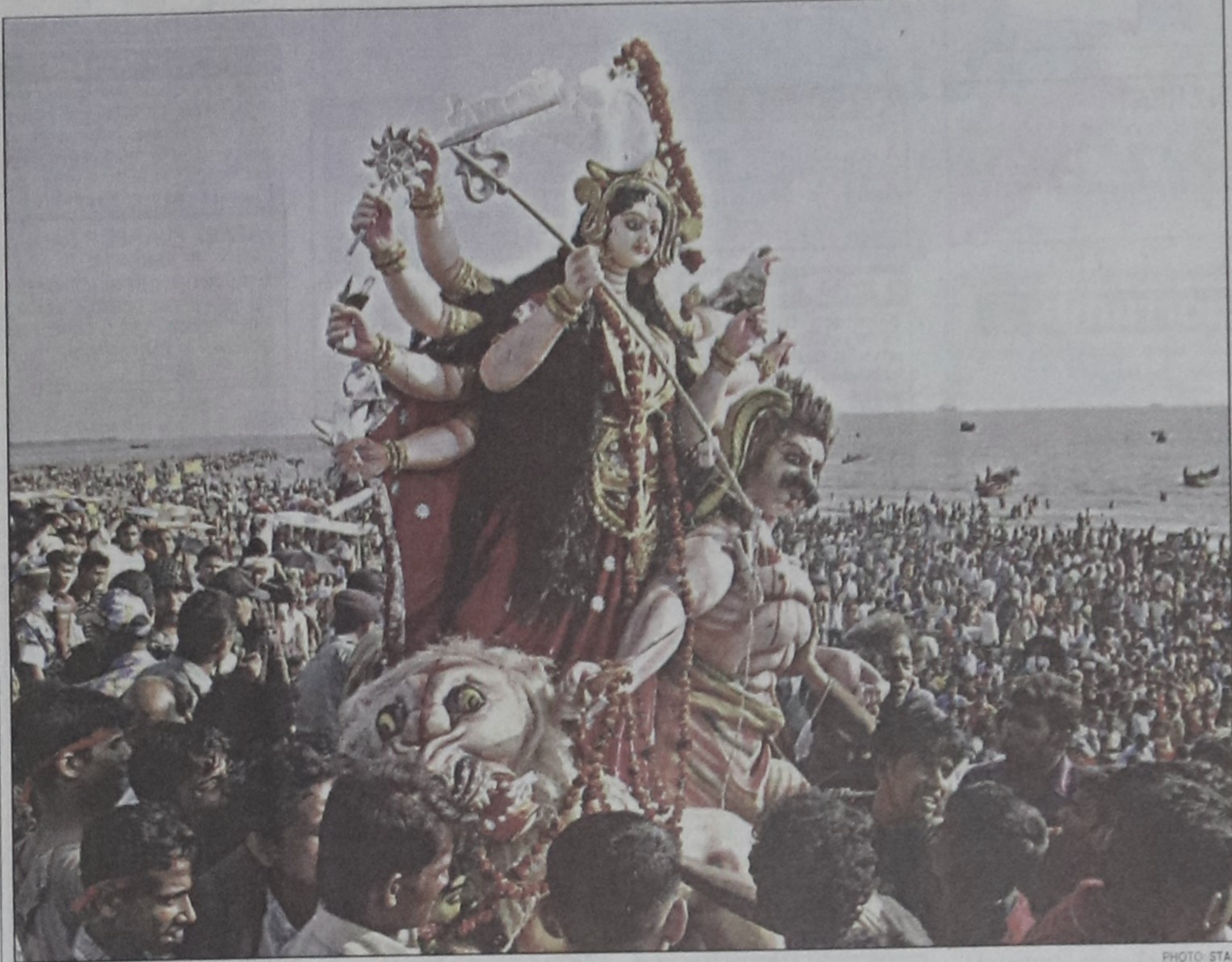
Hindu devotees gather at Patenga sea beach during the immersion of the images of goddess Durga in the Bay of Bengal on the occasion of Bijoya Dashami yesterday.