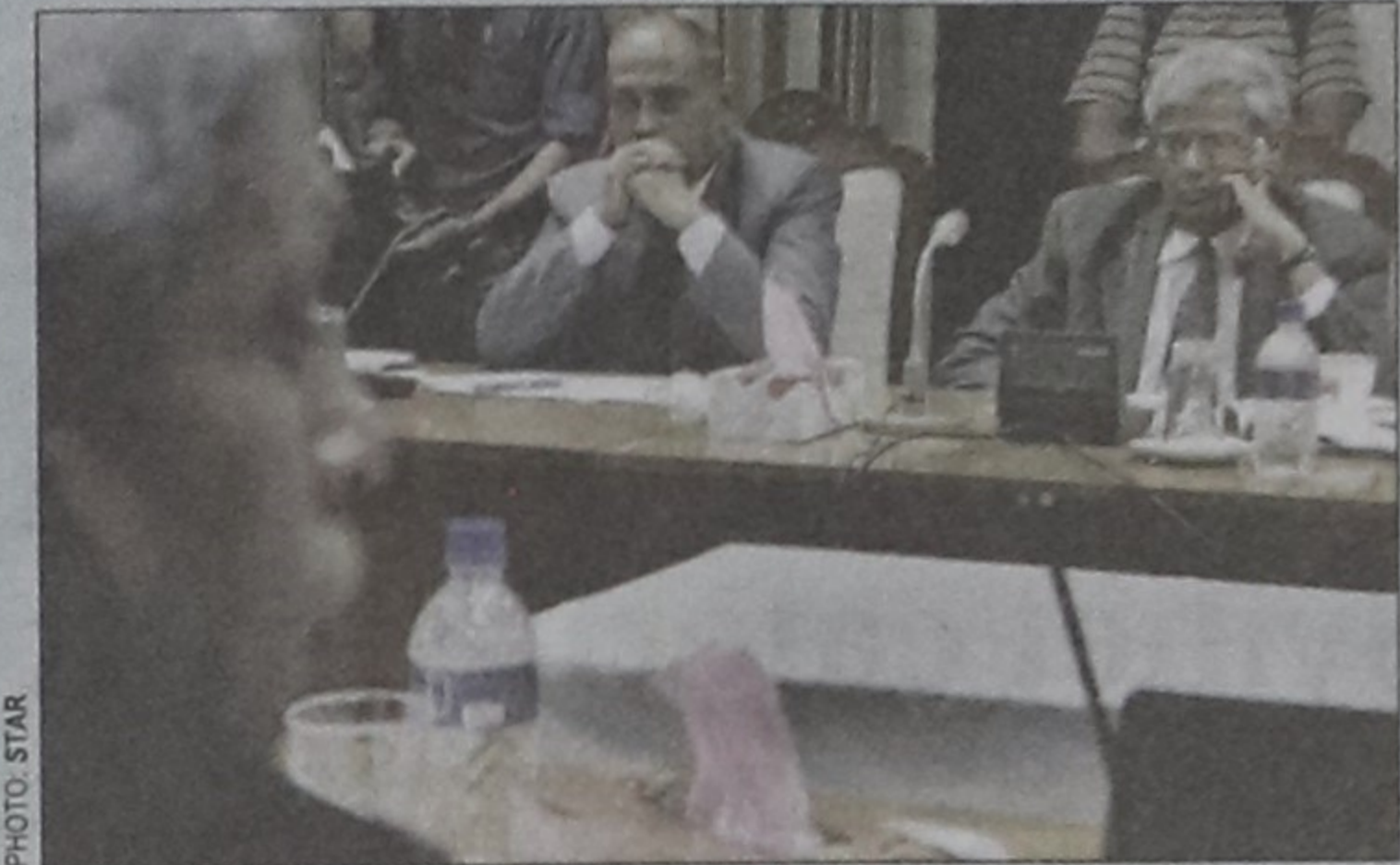
The Election Commission holds talks with the Awami League yesterday.