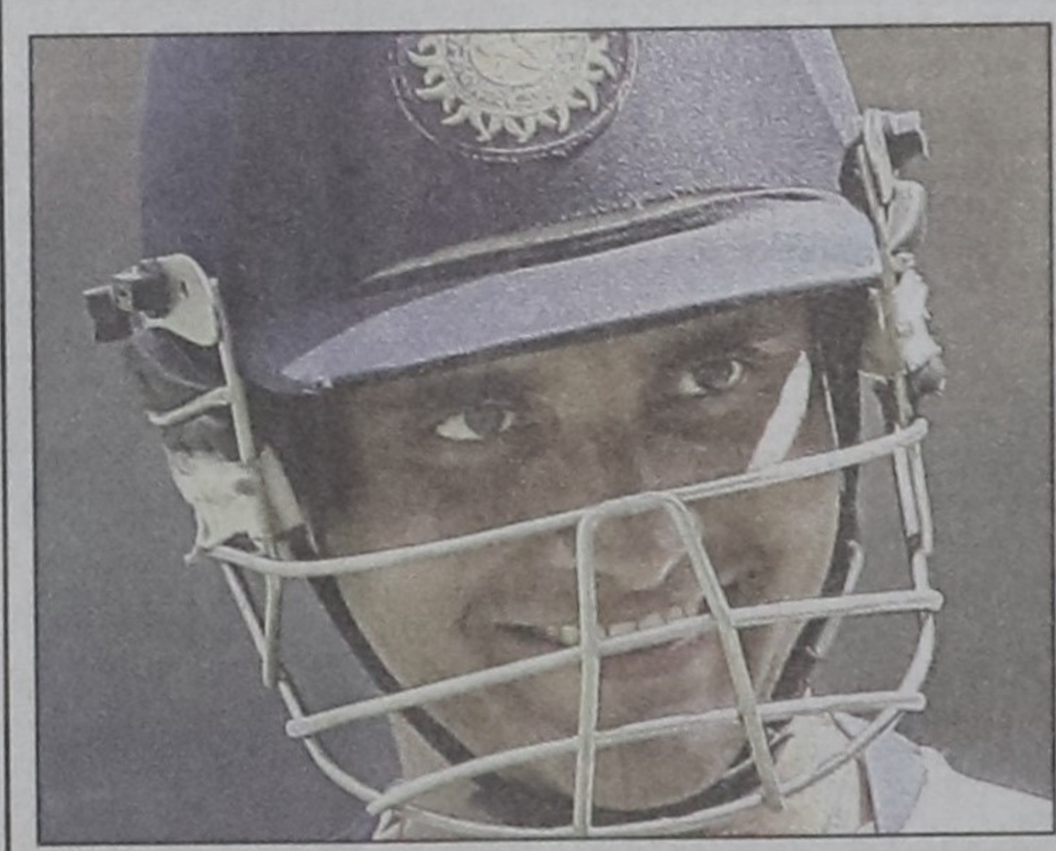
India's most successful captain Sourav Ganguly smiles as he talks with teammates during a practice session at the Chinnaswamy Stadium in Bangalore yesterday. Ganguly has announced that after the Test series against Australia he will retire from international cricket.