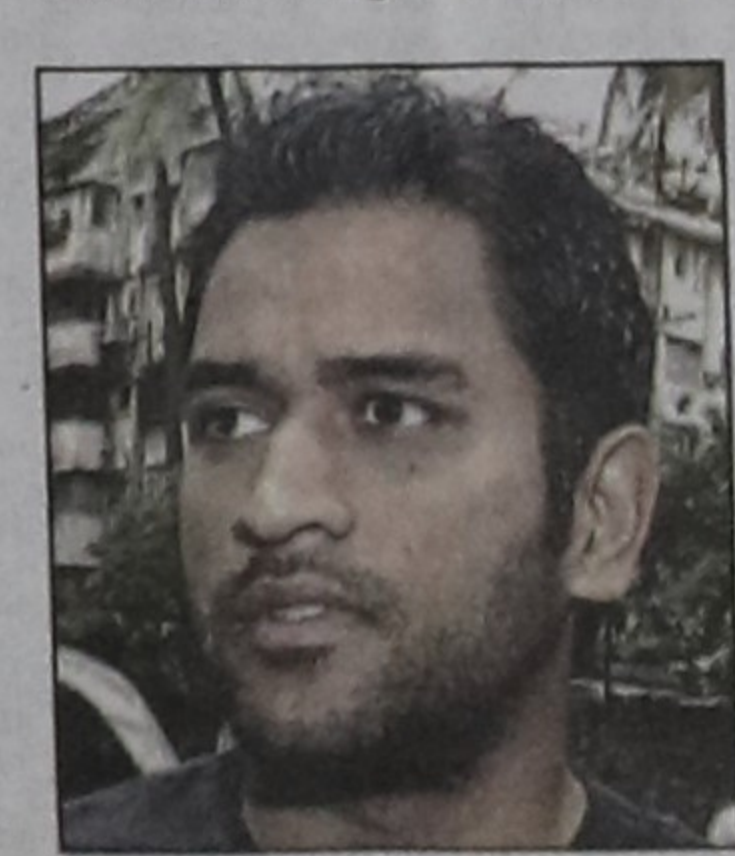
MAHENDRA SINGH DHONI

because of their own expectation level and because they have set the benchmark so high," he told NDTV.