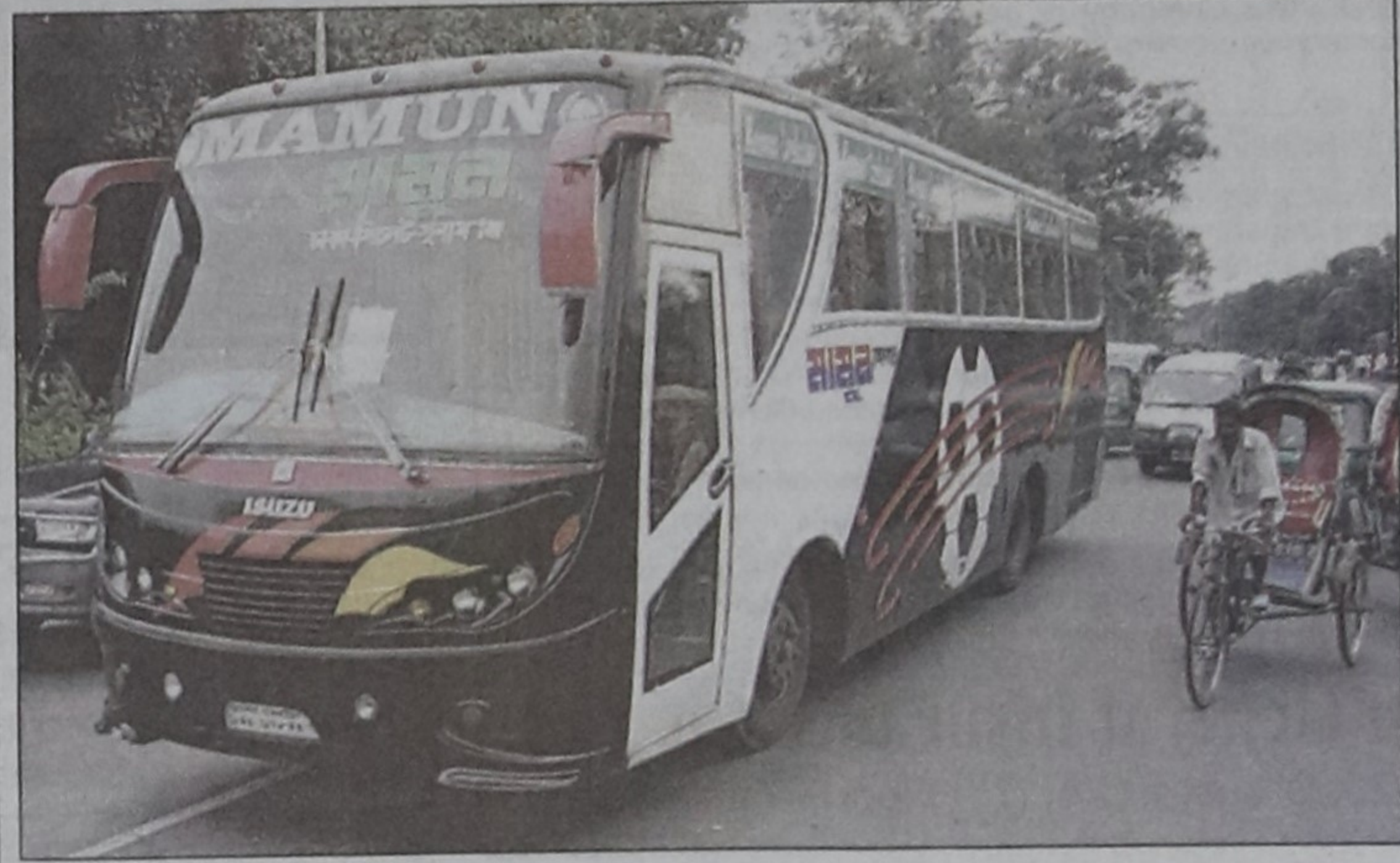
A long-haul coach makes its way past Shahbagh around 4:00pm yesterday, flouting daytime restrictions for entry to the city.

The teachers and the employees, who could not draw their salary of August and Eid bonus, will also be able to draw those within the time, an official handout