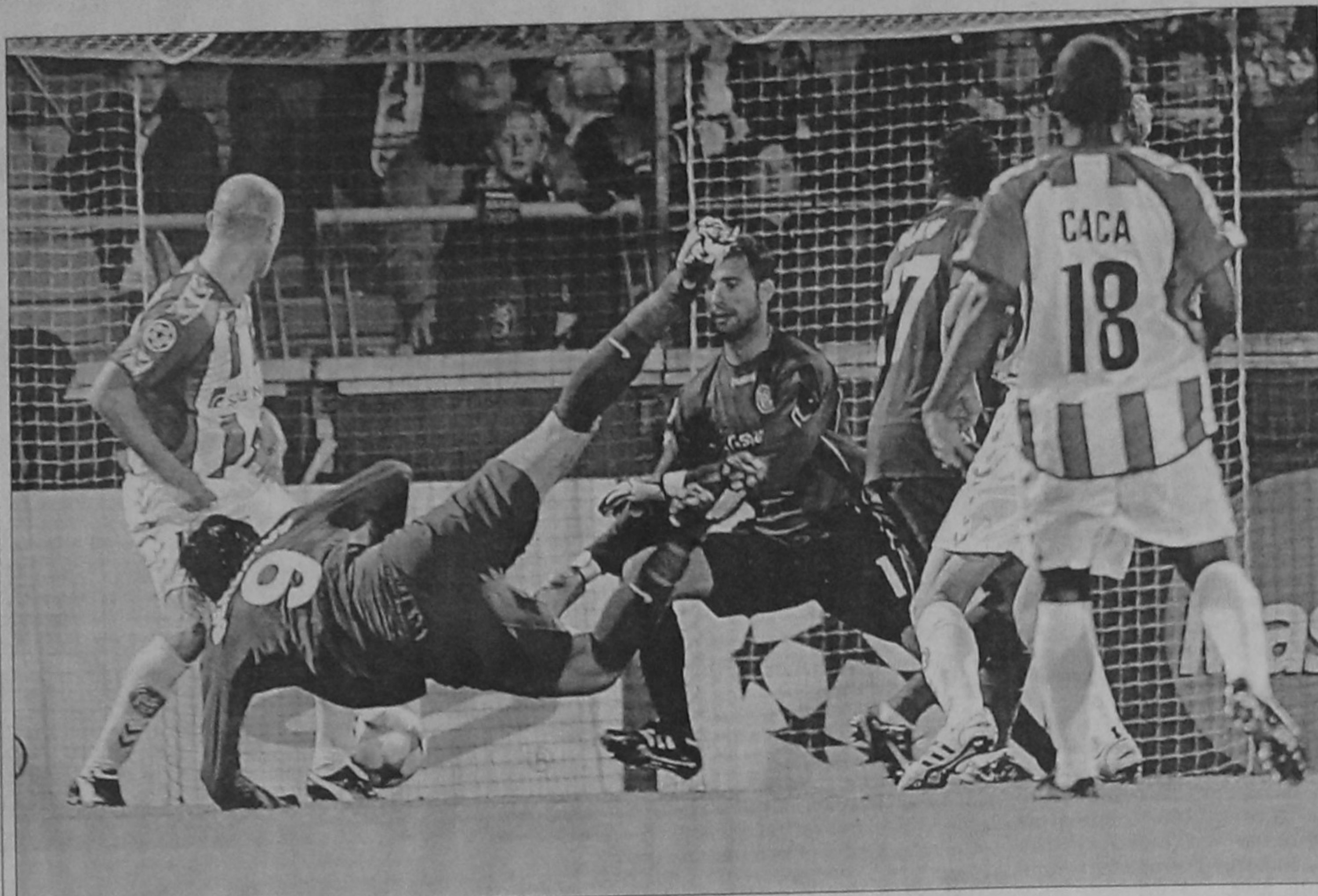
Manchester United striker Dimitar Berbatov (2nd from L) scores his second goal against Aalborg from a spectacular volley during their Champions League encounter in Aalborg on Tuesday. New signing Berbatov scored his first goals for United in the match.

Midfielders: Xabi Alonso (Liverpool/ENG), Diego Capel (Sevilla), Santiago Cazorla (Villarreal), Marcos Senna (Villarreal), Cesc Fabregas (Arsenal/ENG), Xavi Hernandez (Barcelona), Andres Iniesta (Barcelona), Andoni Iraola (Athletic Bilbao) Strikers: Fernando Torres (Liverpool/ENG), David Villa (Valencia), Daniel Guiza (Fenerbahce/TUR)