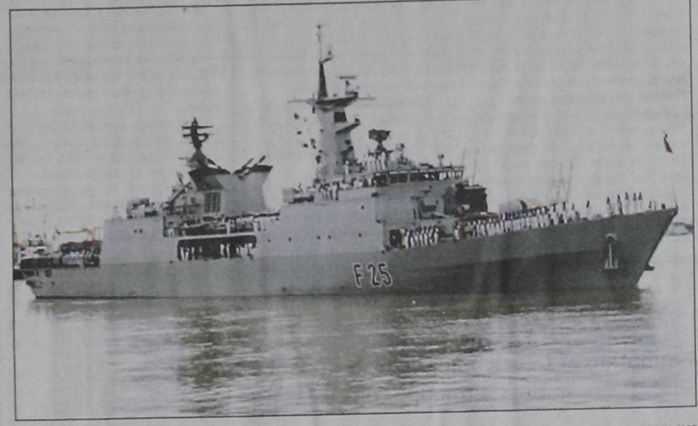
Bangladesh Navy ship Khalid Bin Walid leaves Chittagong Port on October 2 for Qatar to join an international sea exercise titled 'Exercise Ferocious Falcon'.