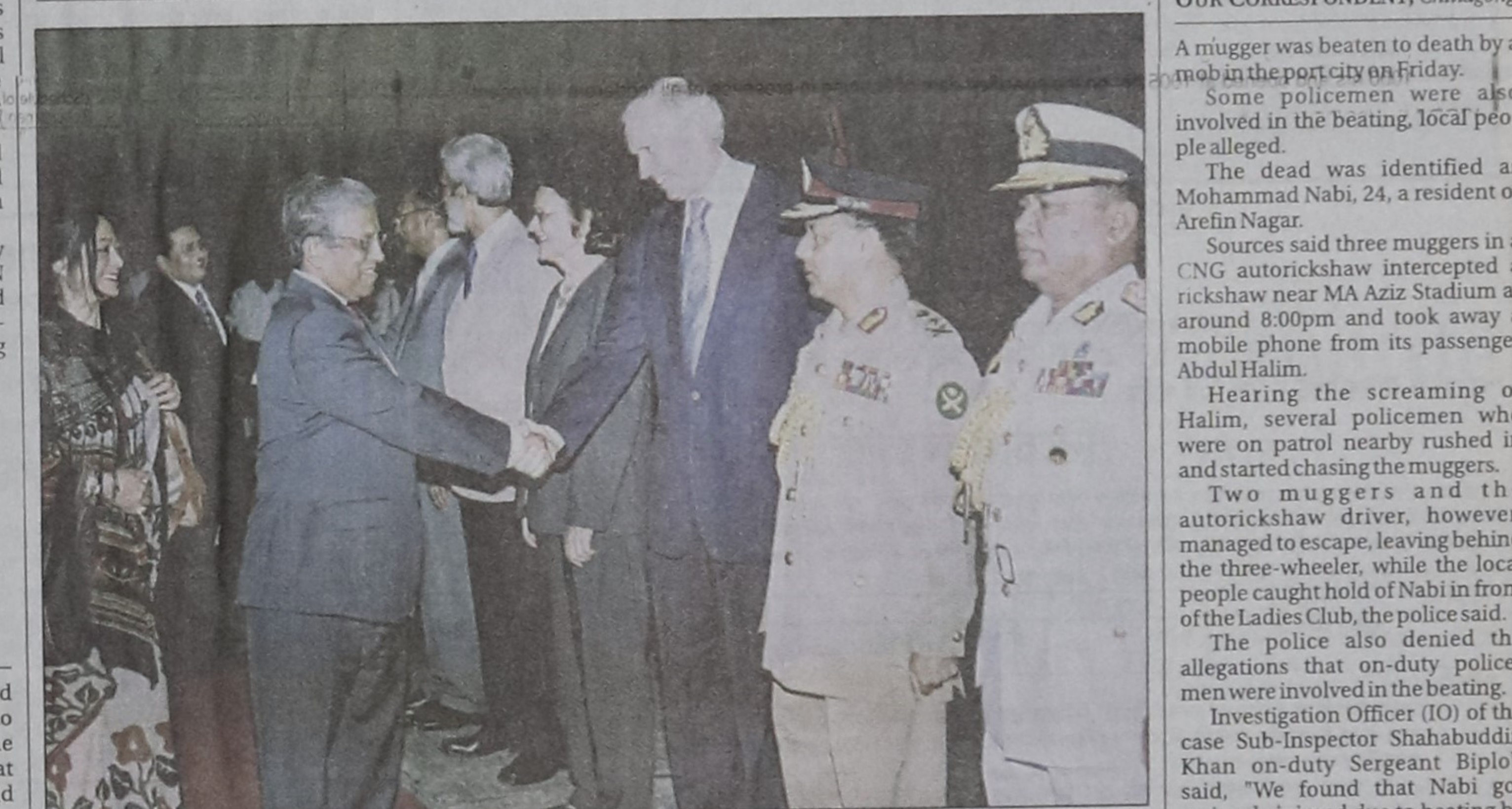
Chief Adviser Fakhruddin Ahmed was received by the members of Council of Advisers, chiefs of three services, dean of diplomatic corps and US ambassador on his arrival at Zia International Airport on September 30 after attending the 63rd session of UN General Assembly.

strong resolve and Sonia Gandhi's firm backing of him clinched the issue and the ruling alliance accepted the nuclear deal. The pact has boosted Singh's image as someone who can take tough calls and set his own agenda, analysts said. Congress has given enough indications that the party is set to use the nuclear deal as a major plank playing up the theme of energy security in the coming parliamentary elections due by May next year, they added. Even before the US Senate approved the nuclear deal with India, Manmohan Singh flew to France where the two countries signed an accord for civil nuclear cooperation, marking the moment when New Delhi shed the tag of a nuclear pariah. That India has entered the global nuclear commerce without signing the NPT and CTBT is in itself a major diplomatic victory, the analysts added.