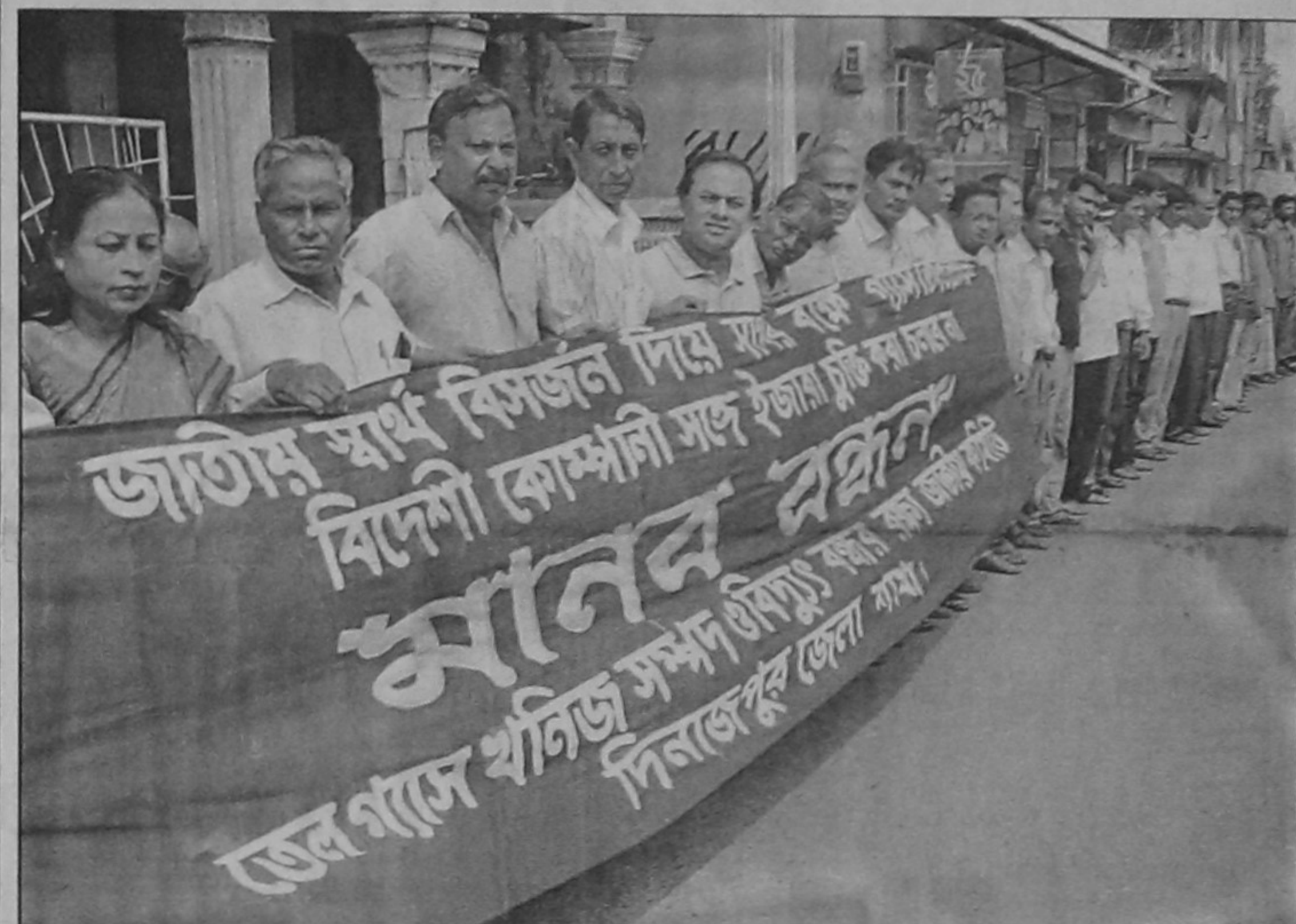
National Oil, Gas Protection Committee forms a human chain in front of Dinajpur Press Club yesterday demanding cancellation of a proposal to lease offshore blocks to multinational companies for drilling.