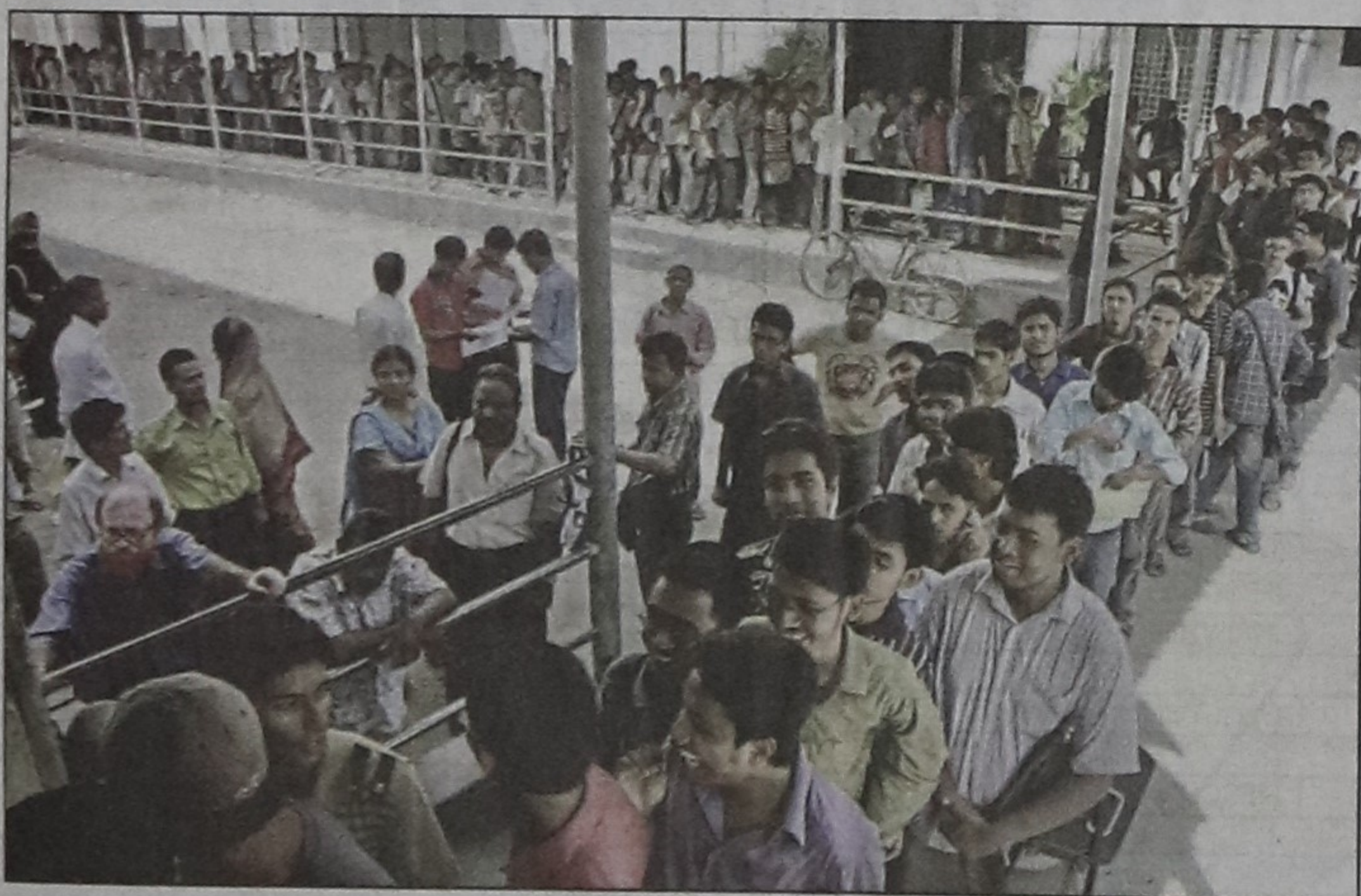
Admission seekers wait in a long queue to collect MBBS admission forms on Dhaka Medical College campus yesterday.