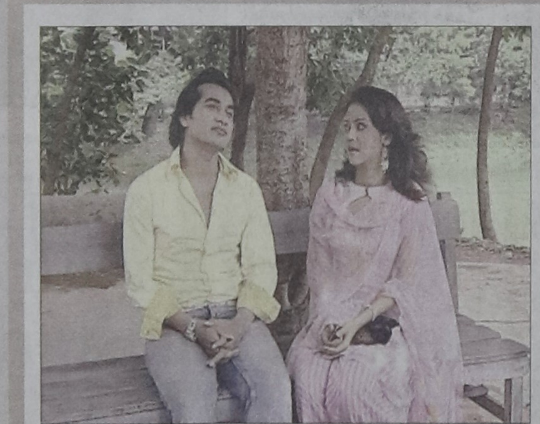
Shopno Mongol On ATN Bangla at 8:00 pm Drama Serial Cast: Shojol, Shagota