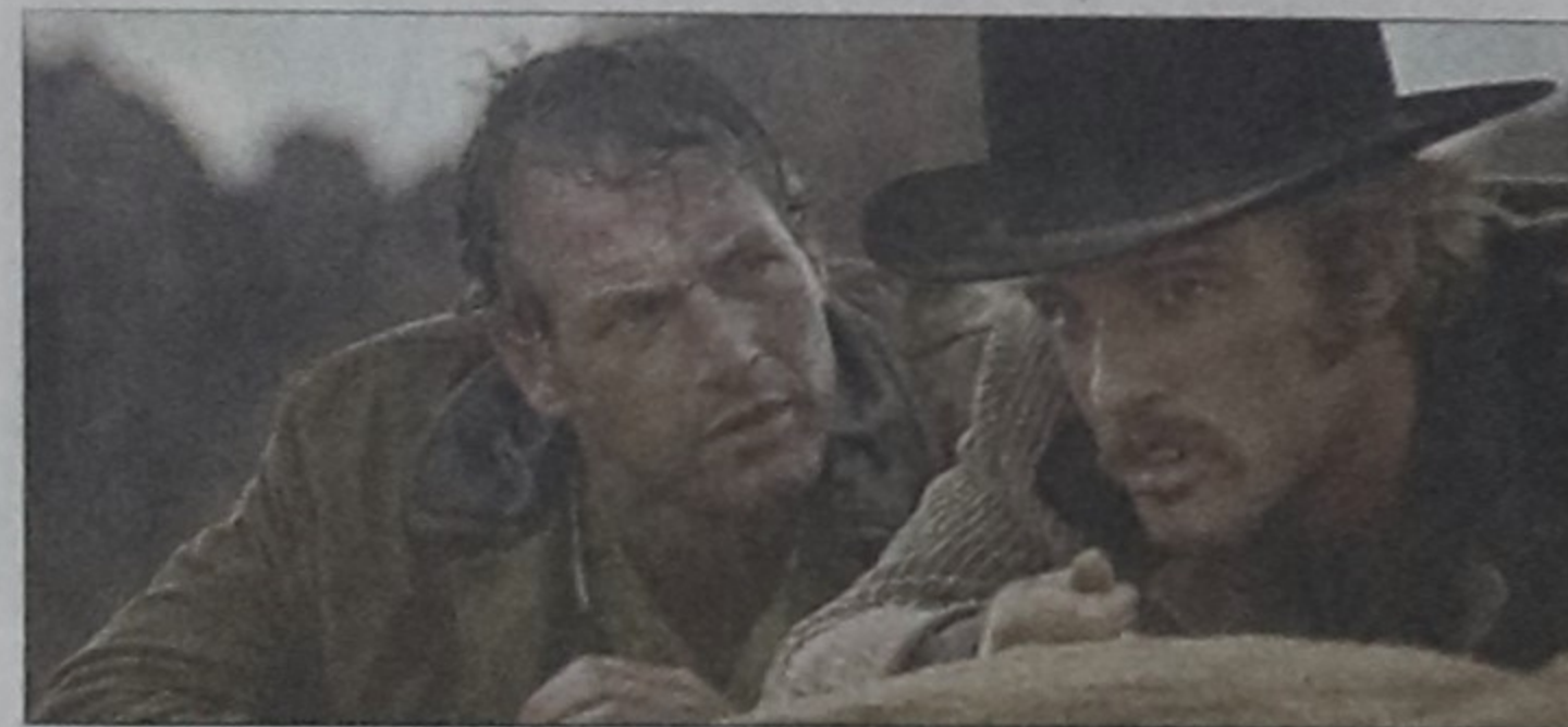
Paul Newman (L) and Robert Redford in the Oscar-winning film "Butch Cassidy and the Sundance Kid".

Newman, who died on Friday aged 83, first starred alongside Redford in the 1969 "Butch Cassidy", the much-