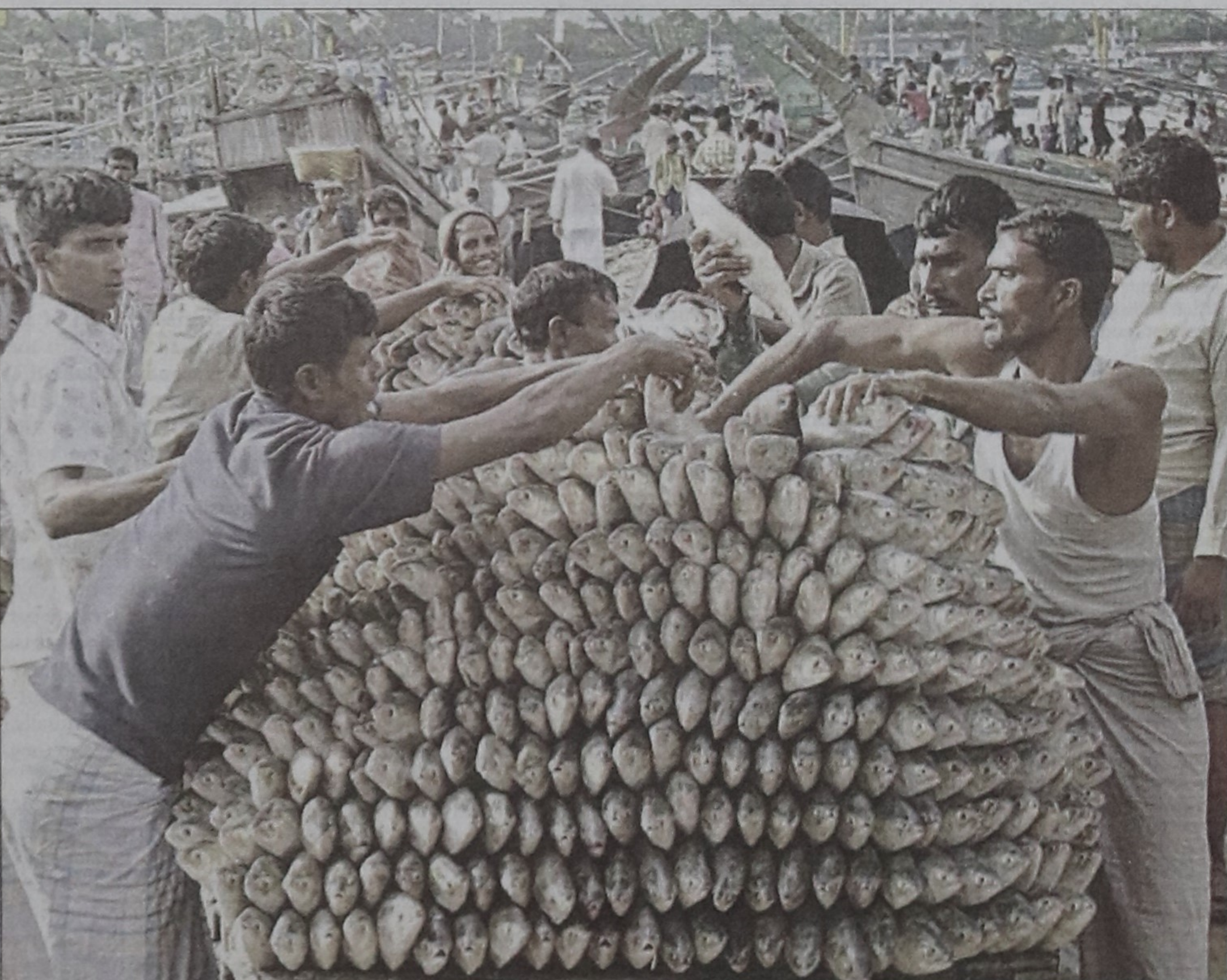
Fishermen piling up hilsa at Fisheryghat in Chittagong as large catches of the delicious fish are available in the Bay.