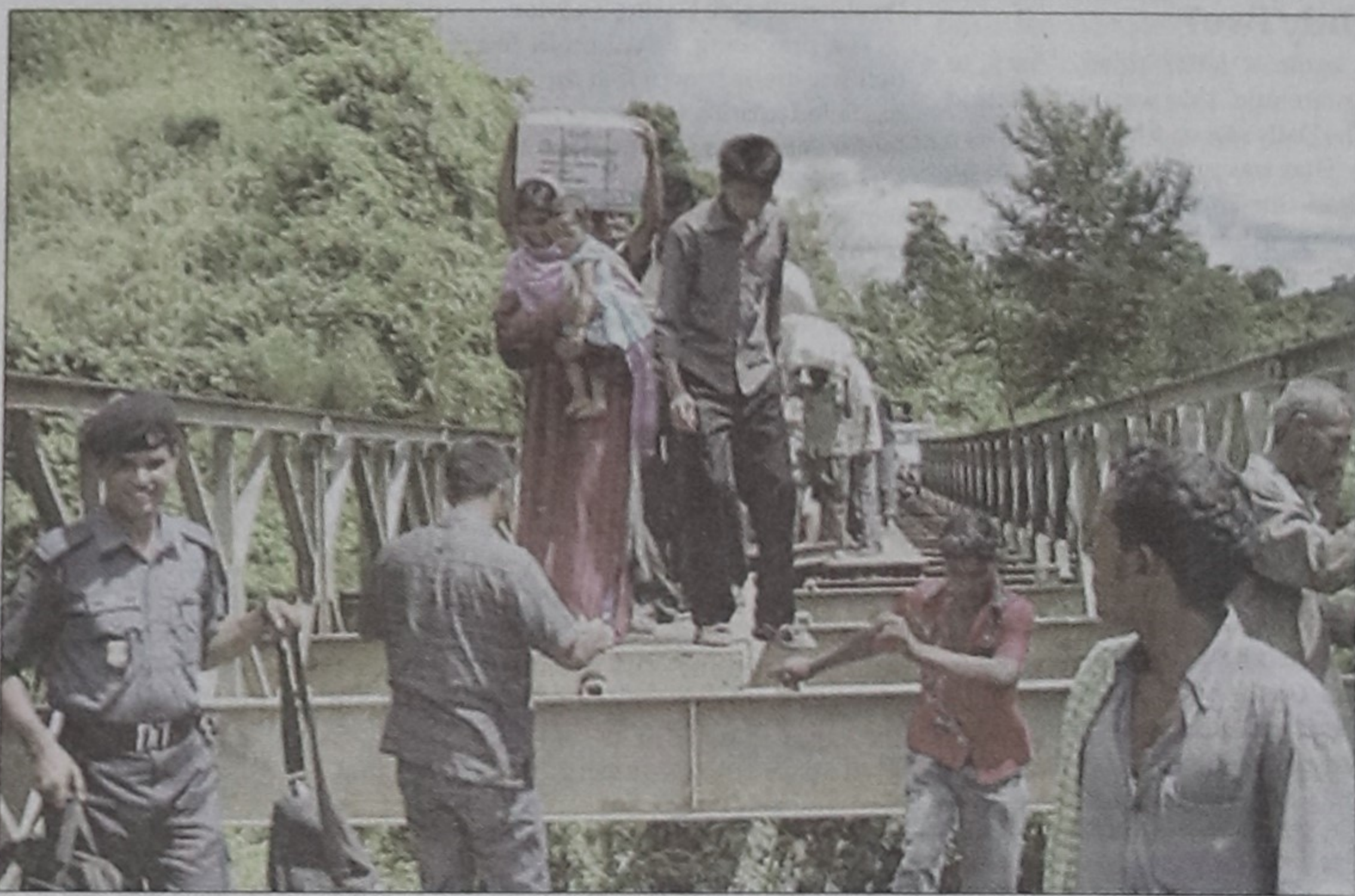
People taking the risky walk to cross Bagmara bridge on Khagrachhari-Dhaka road as the deck remains without plates for days.

"I am working for the betterment of the party chairperson," he said.