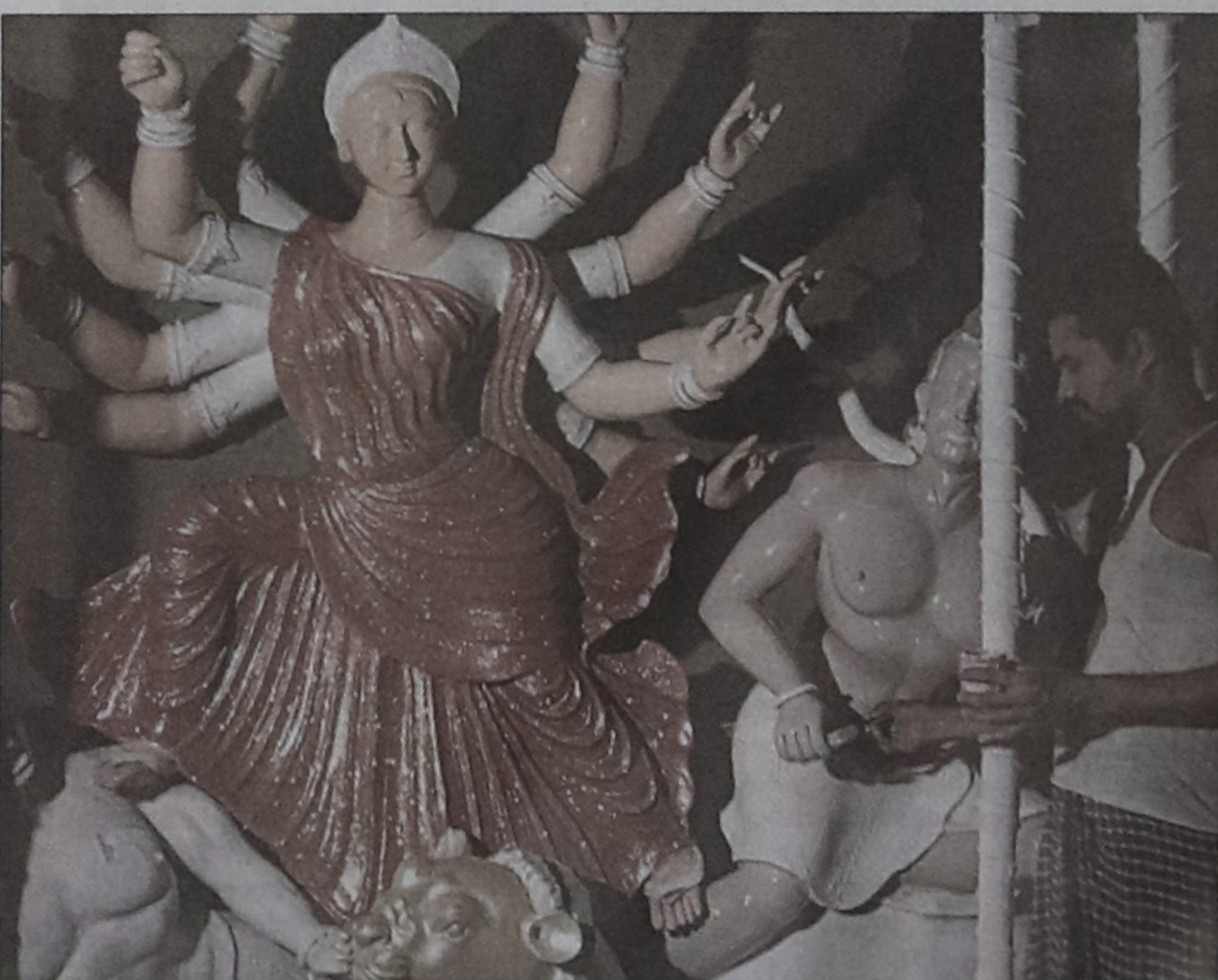
A sculptor giving the final touch to an effigy of goddess Durga at Kalibari puja mandap at Narail as Durga Puja, the biggest festival of the Bangali Hindus, is only a few days ahead.

Local weather office recorded 26.04 millimetre rainfall in the city in nine hours from 6:00 am to 3:00 pm yesterday. Light to moderate rain accompanied by gusty wind was recorded in the city till filing of the report.