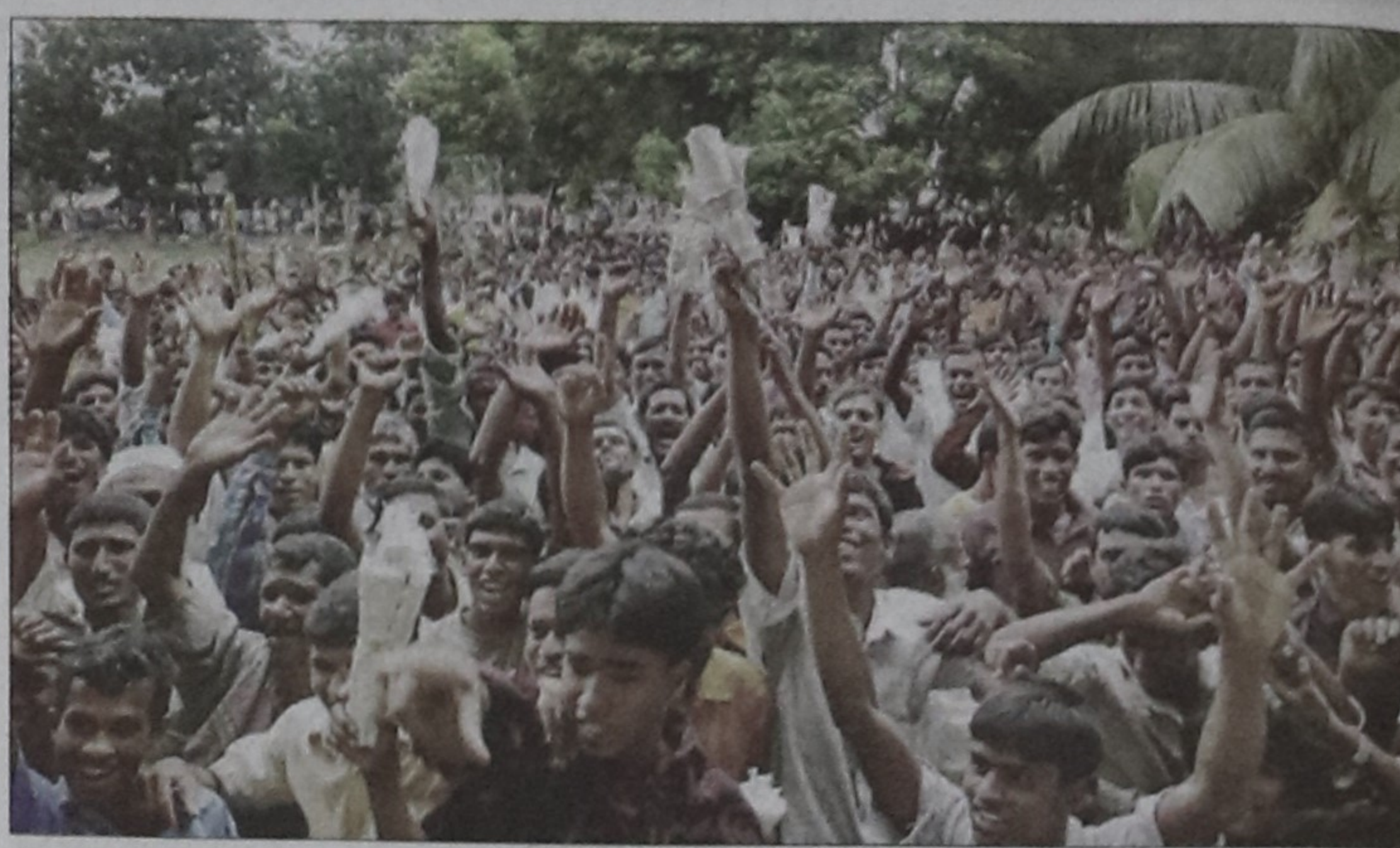
Hundreds of farmers block road and demonstrate on the adjoining Majipara College field in Narail Sadar upazila yesterday demanding adequate supply of fertilizer.

Meanwhile, workers have agreed to receive part payment of arrears wages in cash from yesterday considering assurance of payment of all other dues within next month by the managements of mills.