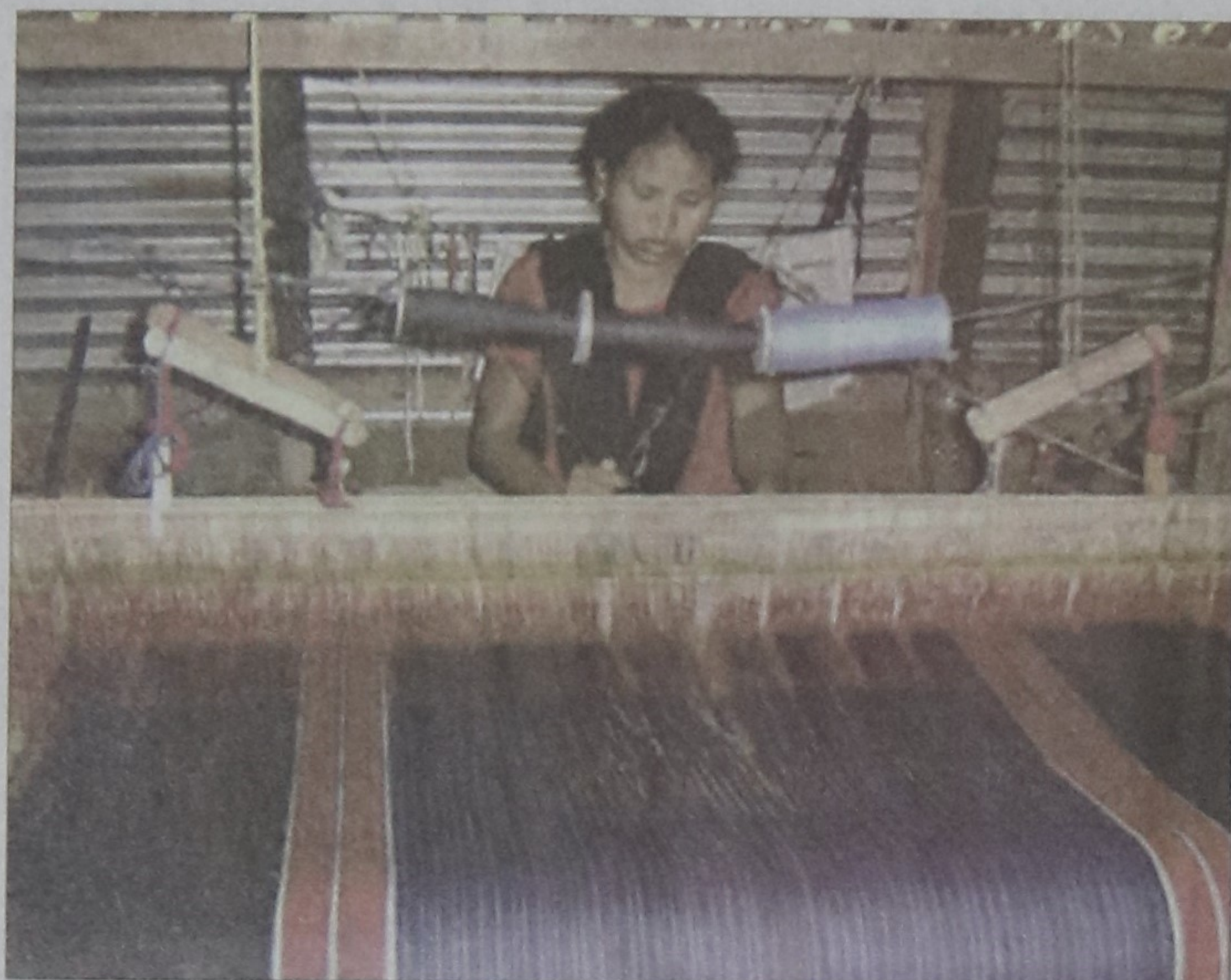
An indigenous weaver at work at Bain Textile in Rangamati.