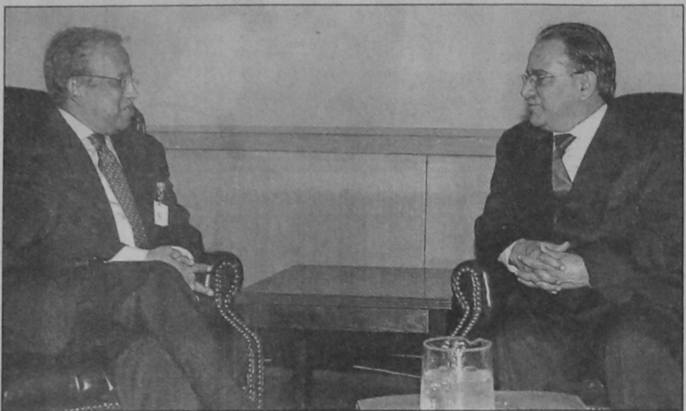
Chief Adviser Fakhruddin Ahmed and Nepalese Prime Minister Pushpa Kamal Dahal Prachanda hold a meeting on the sidelines of the 63rd session of the United Nations General Assembly at the UN headquarters on Friday.