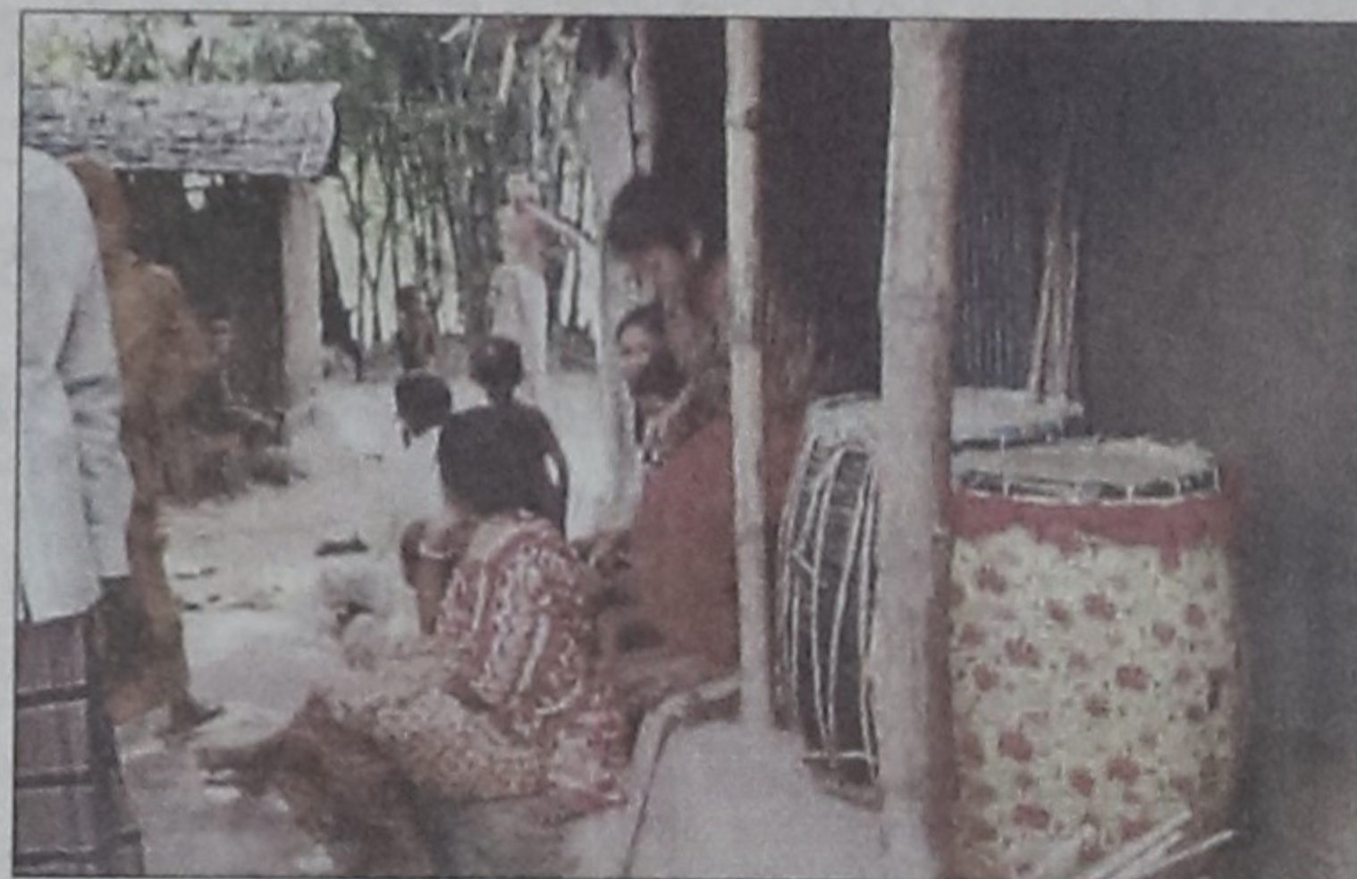
Dhols (right) gather dust as men and women of the Dhuli community are occupied in making handicrafts.