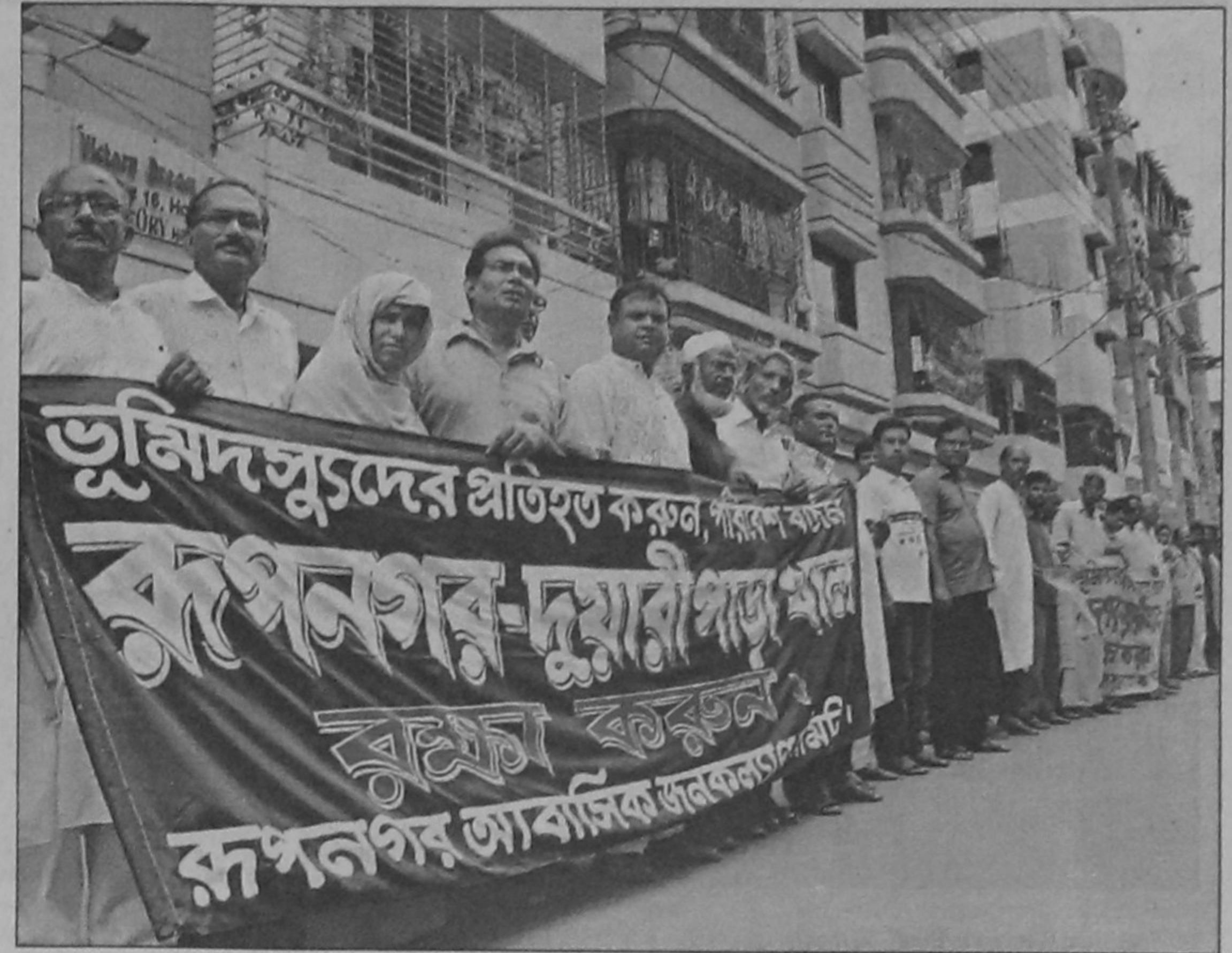
Members of the Rupnagar Abasik Janakalyan Samity form a human chain at Mirpur in the city yesterday demanding immediate steps to protect Rupnagar-Duaripara canal from the land grabbers.