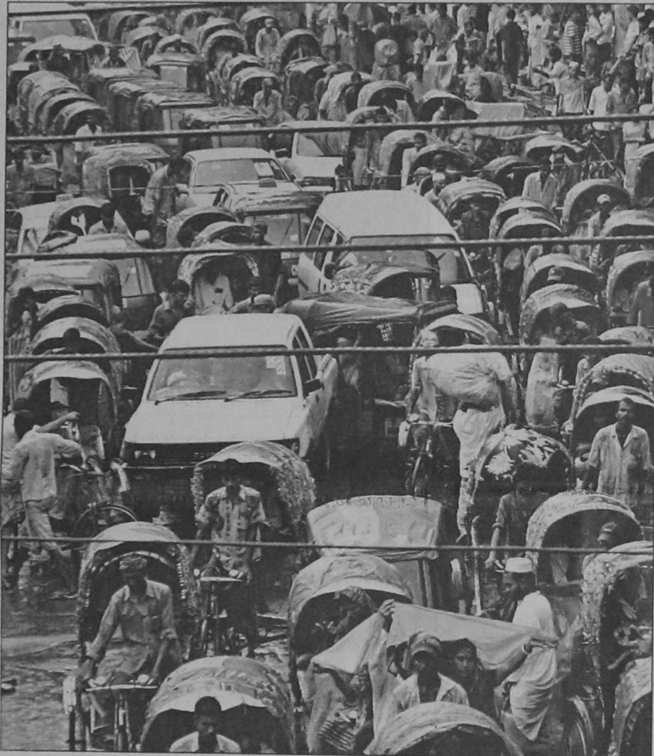
Vehicles on a road near Sadarghat launch terminal in the city get stuck in a gridlock yesterday as holidaymakers rushed to the terminal to go to their village homes to celebrate Eid with their near and dear ones.