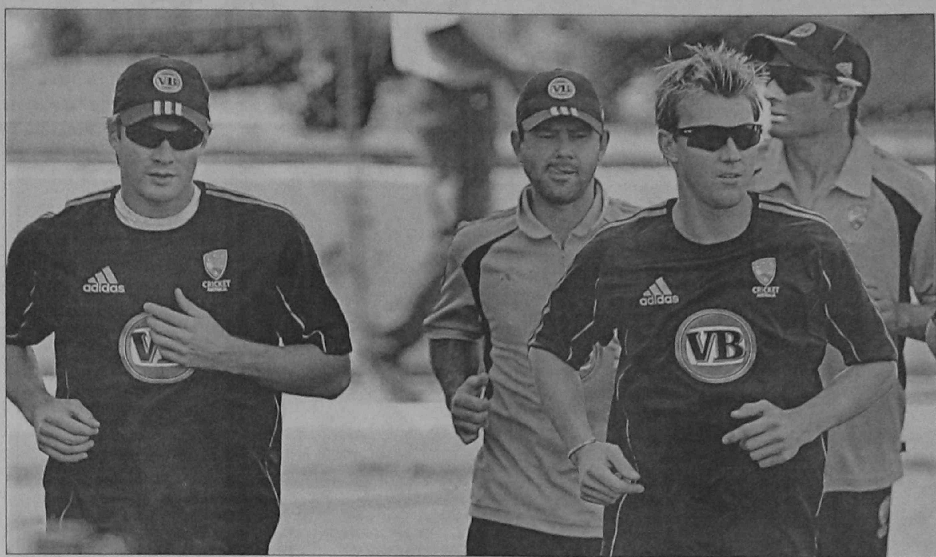
Australia fast bowler Brett Lee (2nd R) jogs along with Shane Watson (L), skipper Ricky Ponting and Michael Hussey (R) ahead of a training session in Jaipur on Wednesday.

The first edition of the IPL, devised by Board of Control for Cricket in India vice-president Lalit Modi, was a huge success and the inaugural Champions League -- backed by the Indian board -- will be held in India from December 3-10, where two teams each from India, Australia and South Africa, and Middlesex and Pakistan's Twenty20 champion will compete.