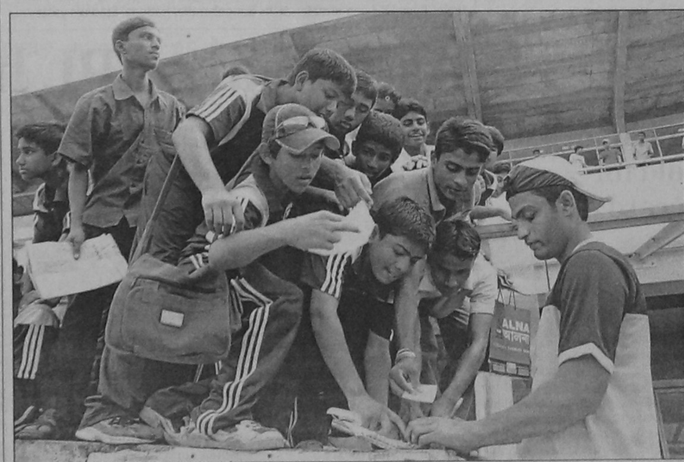
Age-group cricketers flocked to the Sher-e-Bangla National Stadium yesterday for their medical clearance before the season starts. They crowded near the Bangladesh dressing room for a glimpse of their heroes. Opener Tamim Iqbal signs a few autographs for them.