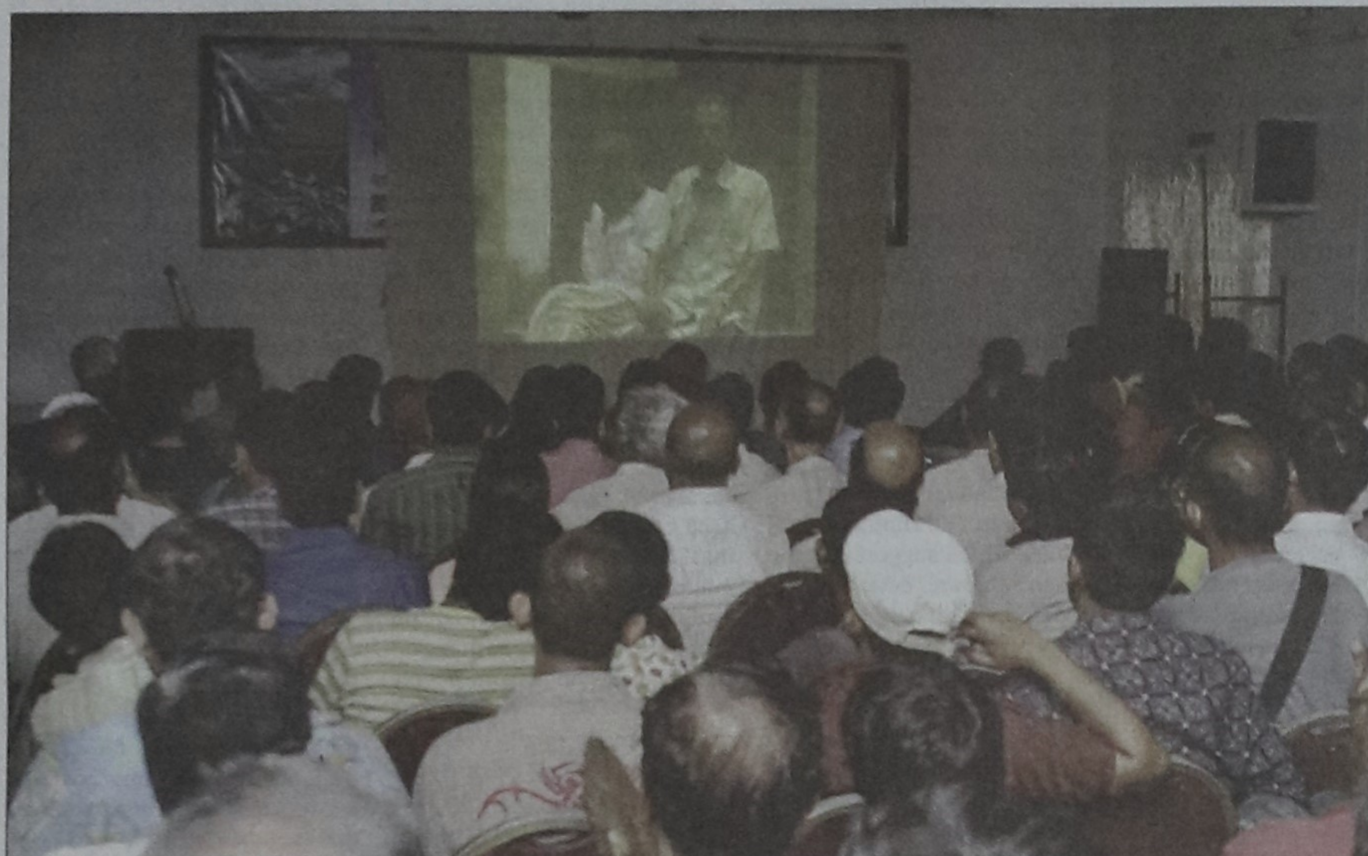
Audience at the documentary screening.