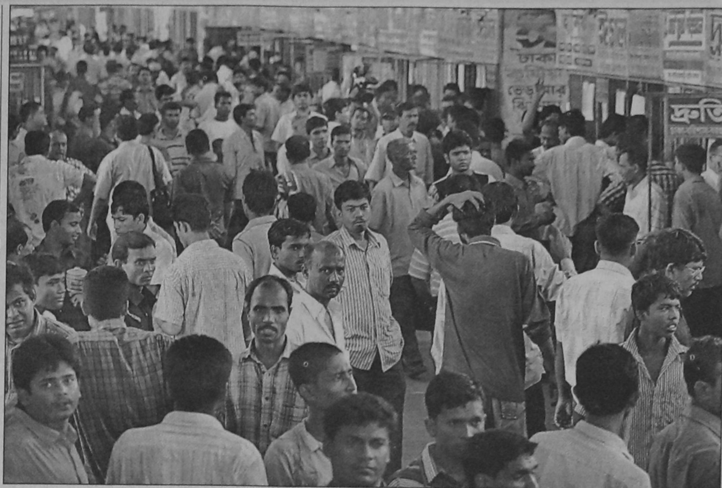
Hundreds of home-bound people crowd the counters for bus tickets everyday to celebrate Eid with their near and dear ones. The picture was taken from the Gabtoli Bus Stand yesterday.

Commuters experienced acute sufferings when a huge number of vehicles got stranded on both sides of the narrow but busy road due to the blockade.