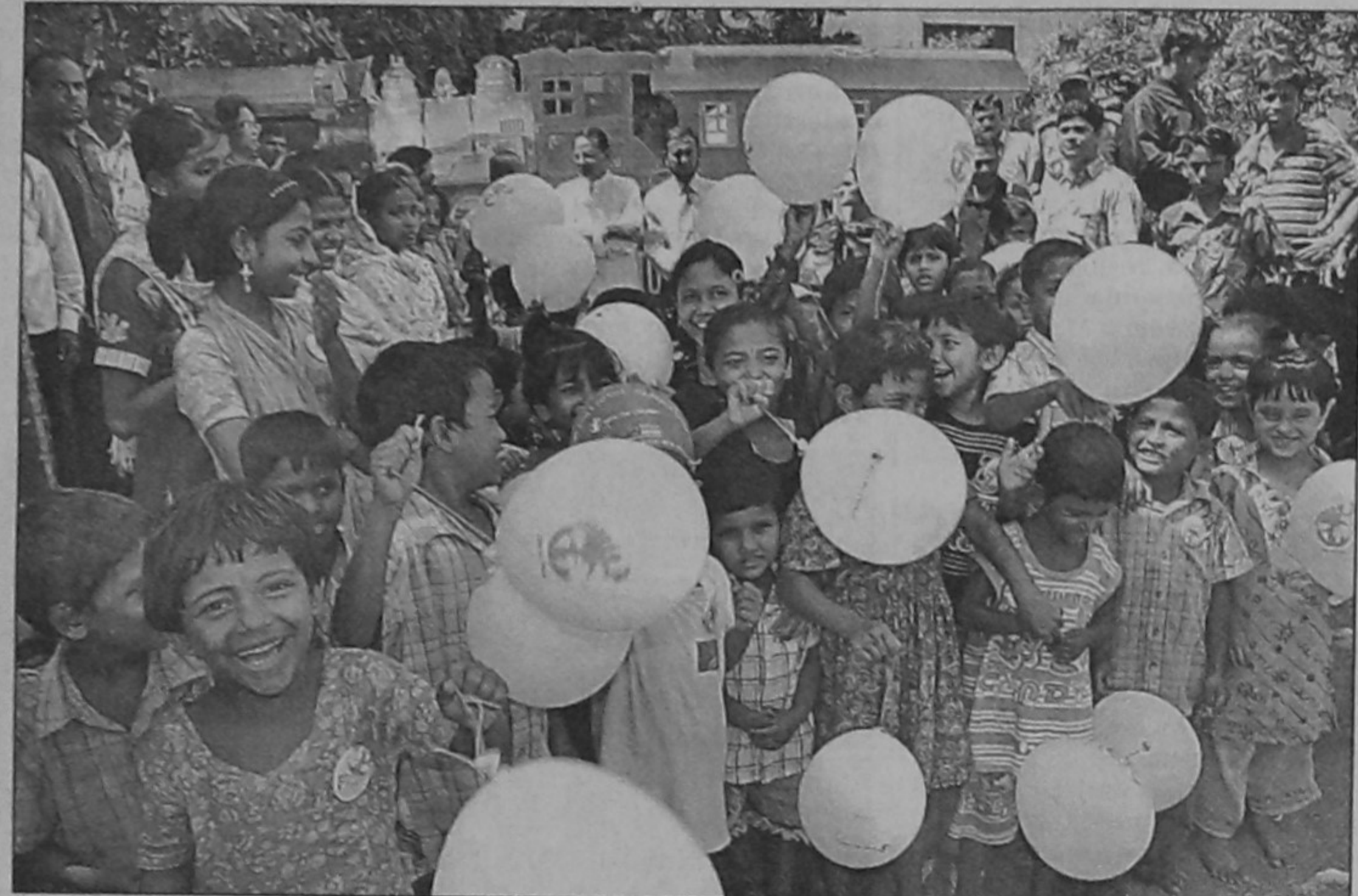
Children take part in a programme titled 'Get on track to save children's lives' in front of IDB Bhaban in the city yesterday with a call to ensure healthcare facilities for poor and underprivileged children. Save the Children UK, Eminence and The Editor jointly organised the event. (Story on Page 2)

Earlier, Muslim Commercial Bank donated Tk 14 lakh for construction of a ward in the hospital.