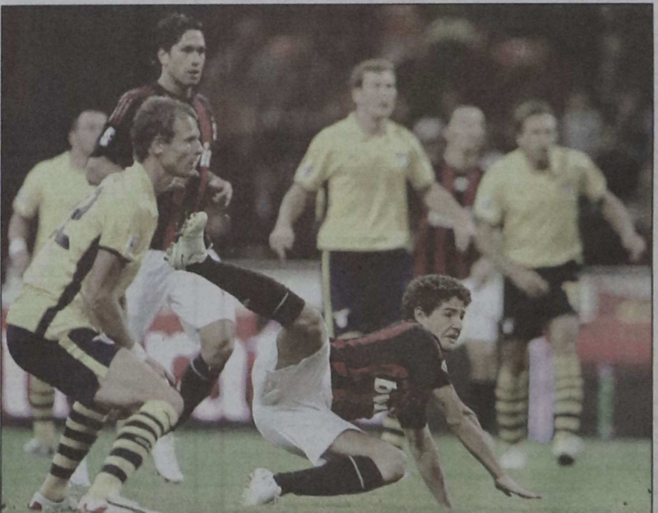
AC Milan striker Alexandre Pato puts in a diving header amongst a host of Lazio players to score during their Serie A match at the San Siro on Sunday. Milan picked up their first win of the season courtesy of a Kaka-inspired 4-1 scoreline.