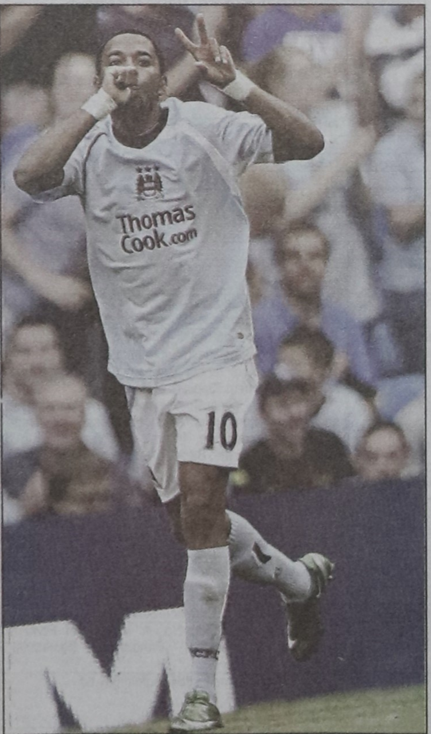
Manchester City's record signing Robinho embarks on his trademark celebration after scoring in their Premiership match against Portsmouth on Sunday. Robinho put in a blistering performance as City thumped Pompey 6-0.

"At 4-0 the game was effectively over, but the level in performance did not drop," added Hughes. "In the end I was taking players off to allow them to get standing ovations."