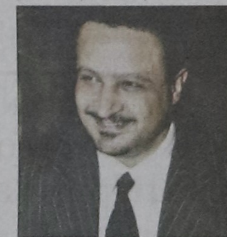
Abdullah Naser Al-Busairy Ambassador of the Kingdom of Saudi Arabia to Bangladesh

I pray to Almighty Allah to bring back this sweet and happy occasion for many years to come to the people of the Kingdom of Saudi Arabia and the Islamic Ummah under the dynamic leadership of our able and wise guardians the Custodian of the Two Holy Mosques King Abdullah Bin Abdul Aziz and His Royal Highness the Crown Prince Sultan Bin Abdul Aziz and under the auspices of distinct and excellent relations existing between the two brotherly countries, Saudi Arabia and Bangladesh, in an atmosphere characterized by love, peace, safety and stability.