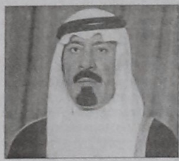
His Majesty King Abdullah Bin Abdul Aziz