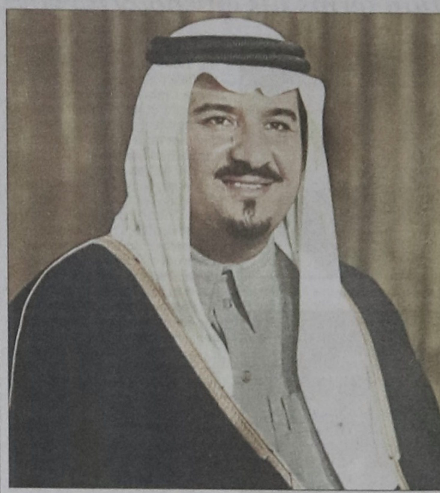
Crown Prince Sultan Bin Abdul Aziz