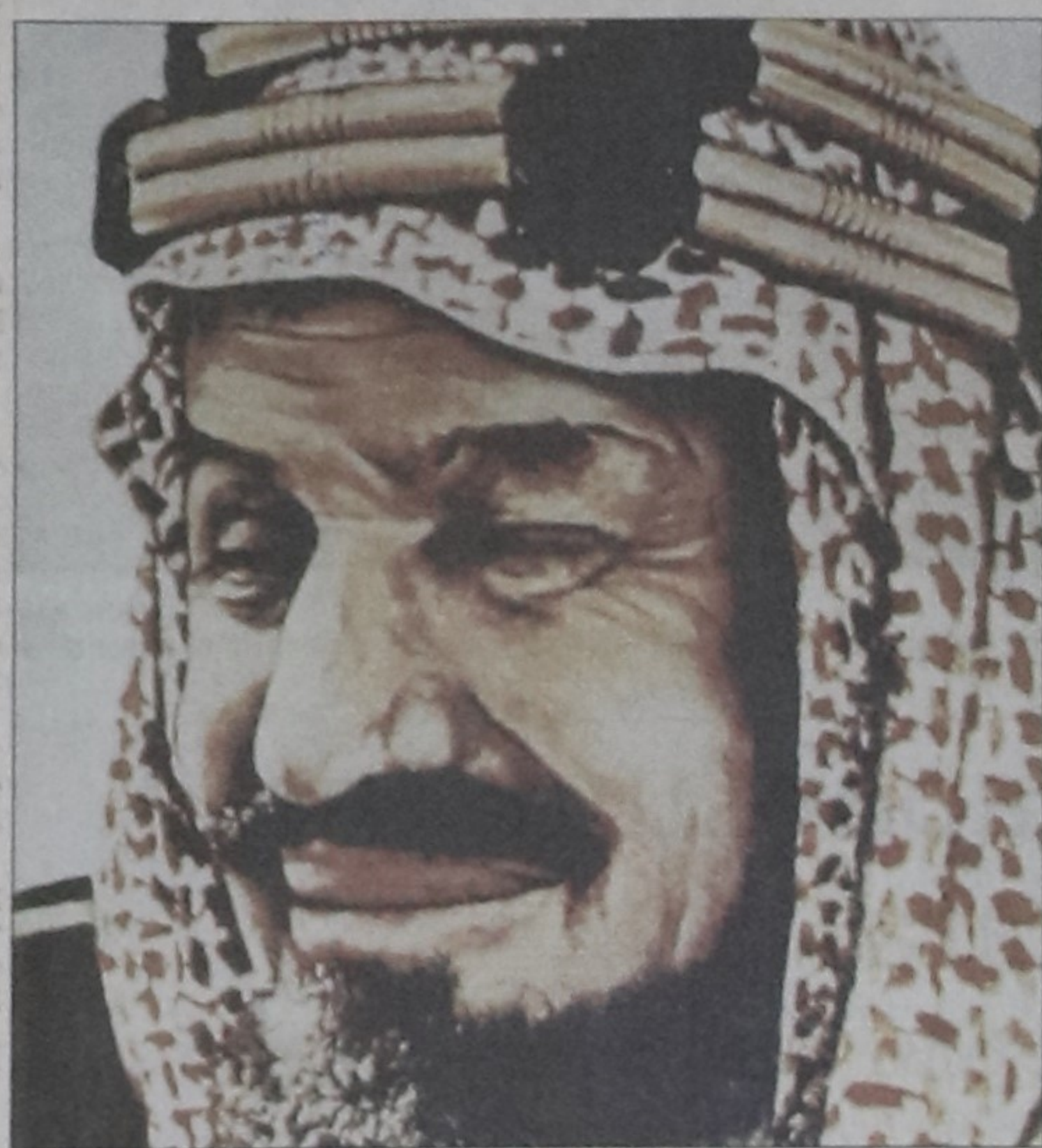
Late King Abdul Aziz: Founder of the Kingdom of Saudi Arabia