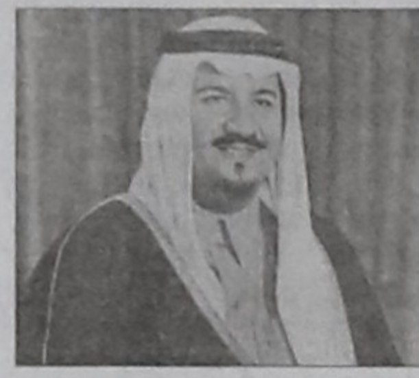
His Royal Highness Crown Prince Sultan Bin Abdul Aziz