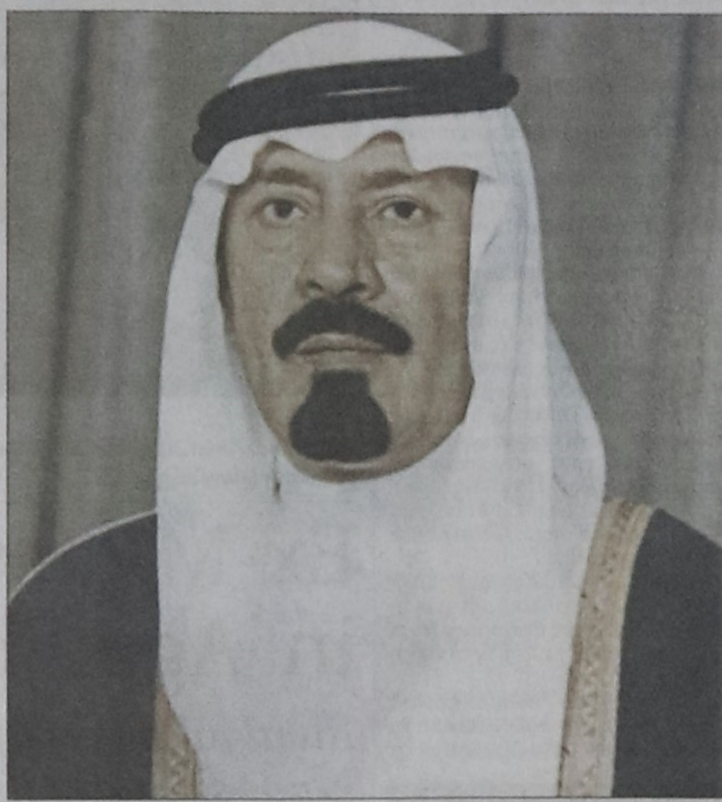
King Abdullah Bin Abdul Aziz: Custodian of the Two Holy Mosques