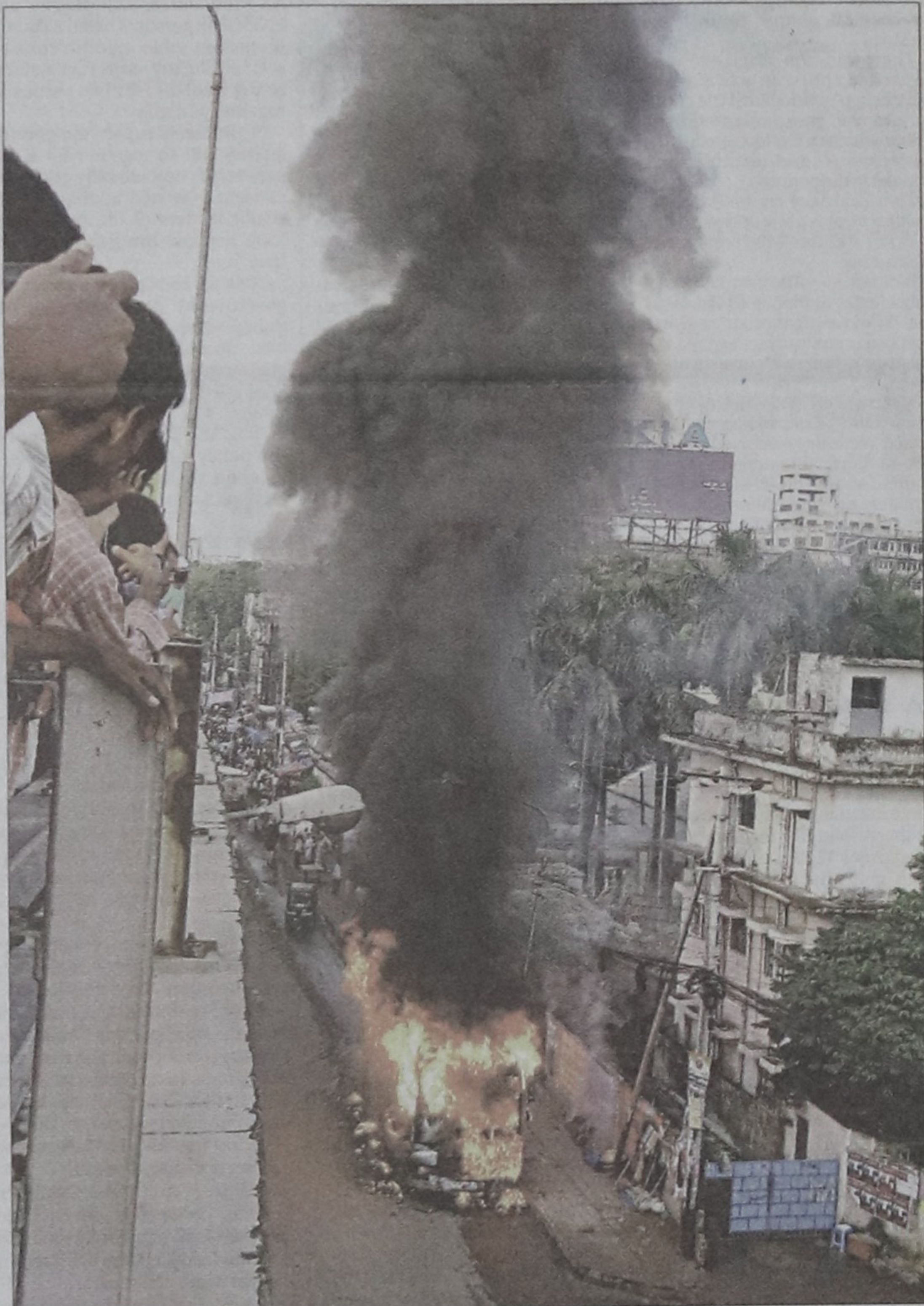
People watch from a distance as a CNG-run bus is in flames near Mohakhali flyover in the capital yesterday. The fire originated from the vehicle's battery and caused traffic jams in adjoining areas.