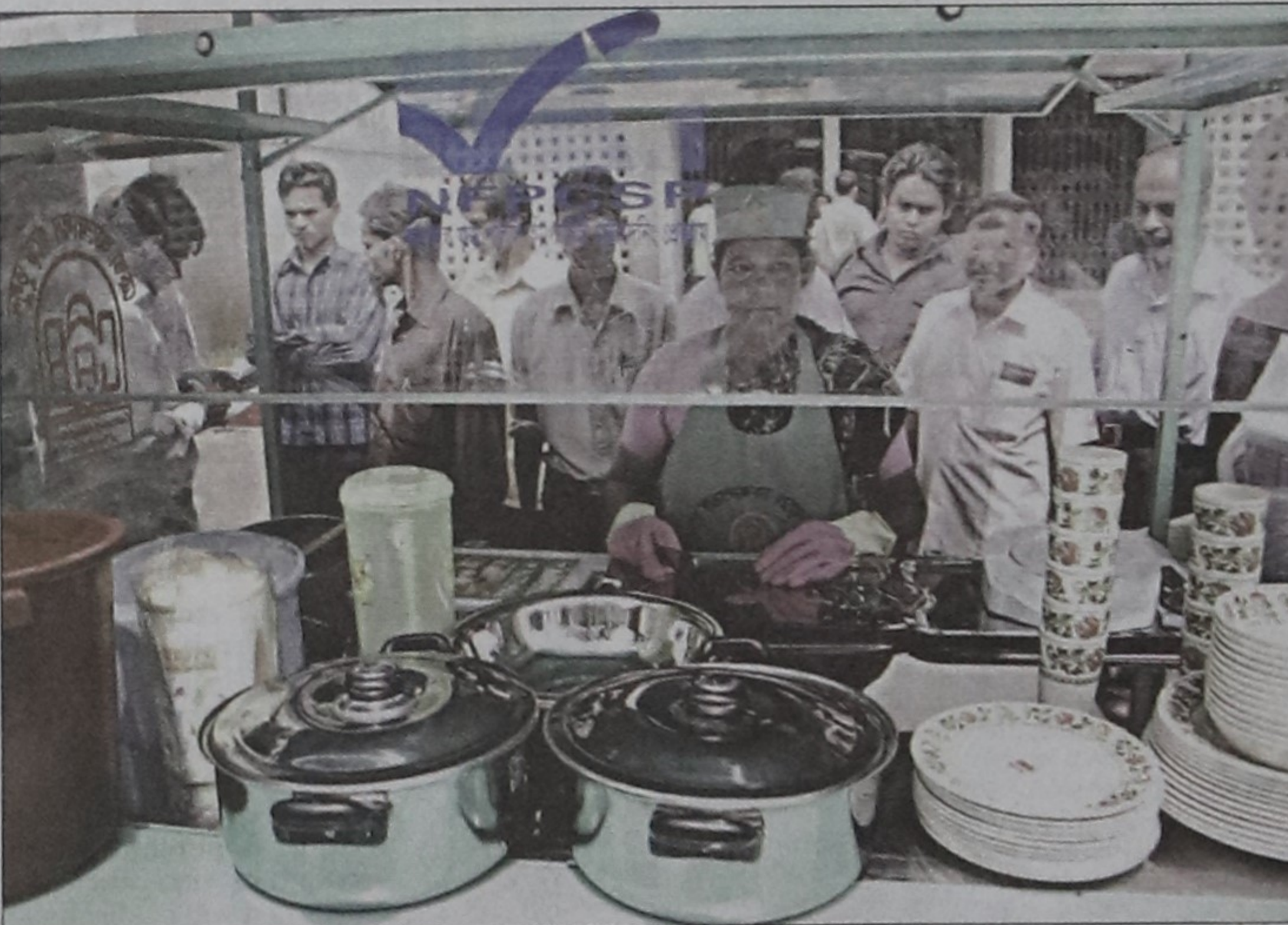
Consumers Association of Bangladesh and National Food Policy Capacity Strengthening Programme of FAO give food carts to 11 street vendors in Dhaka yesterday. Story on page 2.

They also discussed the country's latest situation.