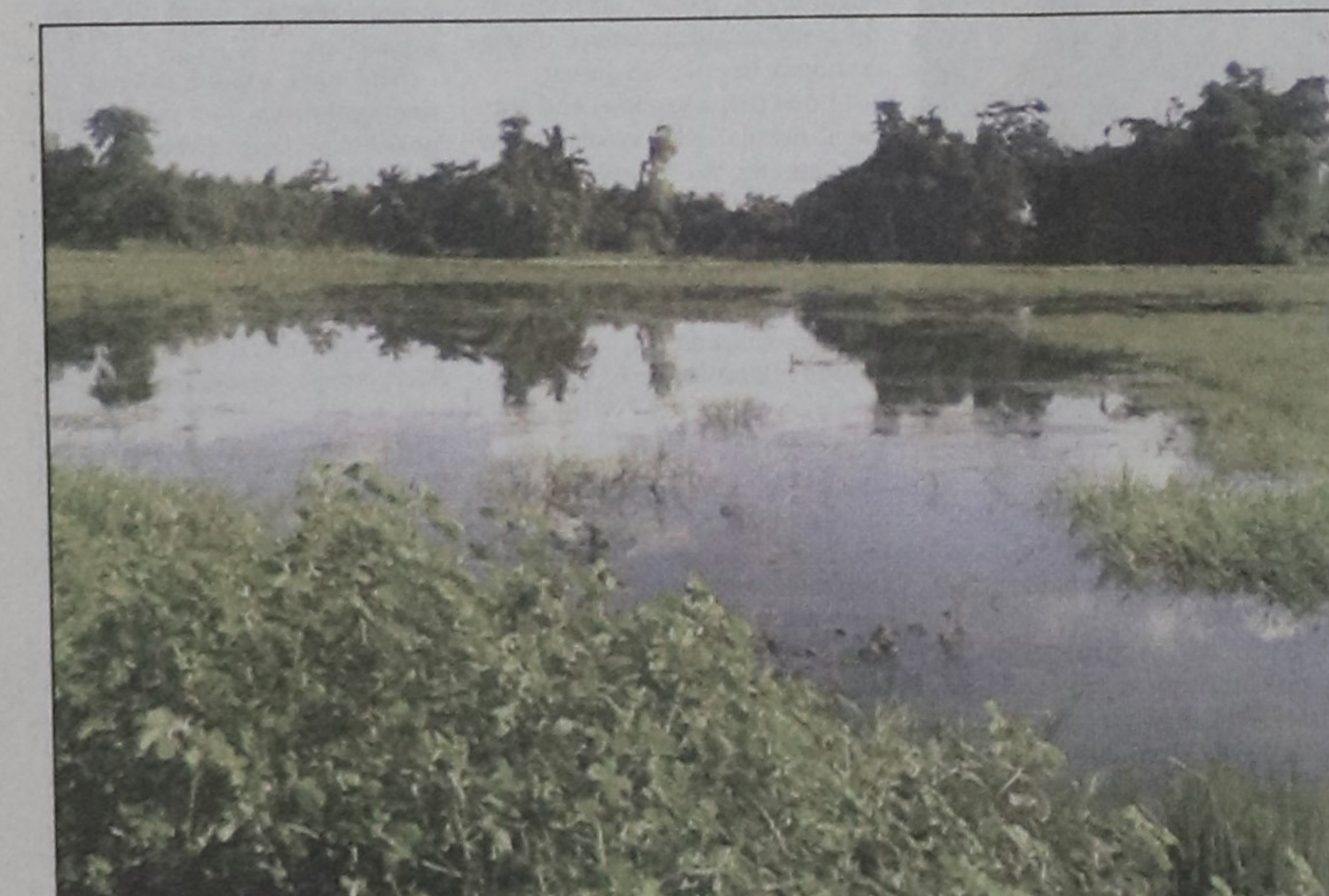
Water remains stagnant in vast areas of Sanjabpur village in Kamalganj upazila as the adjacent RHD road lacks a culvert.