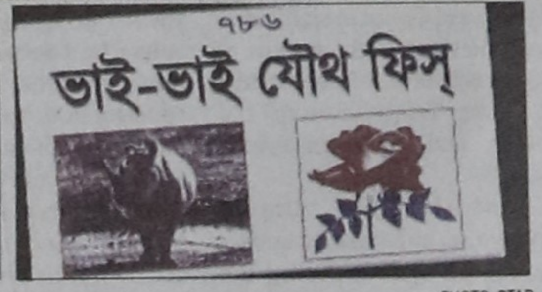
Huge hilsa being unloaded from a trawler at Pathorghata fishing ghat in Barguna district, top, two sides of a 'safety token' that pirates issue after realising toll from a trawler.